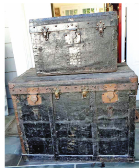
2, Malles Lavolaille, Paris Trunks