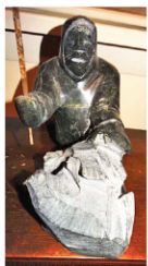
Vintage Alaskan Inuit Man