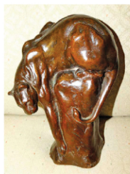
"Reaching Panther" #174 by Anna Vaughn Hyatt - Gorham