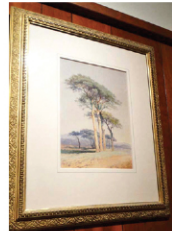
9 1/2 x 13 1/2 G. Inness Landscape