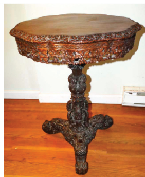
Excellent Carved Pedestal Side Table