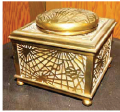
Tiffany Studios Bronze, Pine Needle, Ink Well