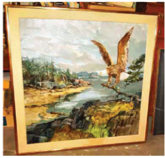
Watercolor "Silver Cove" by L. Sisson, 42 x 42

For more pictures see auctionzip.com (auctioneer # 2954) • **Day of auction 401 265-5104**