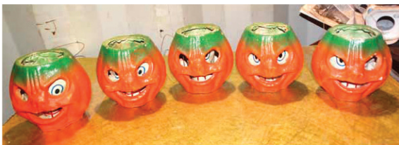
5 Halloween Pumpkins