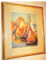
Watercolor "Catboats" by Mabel Woodward