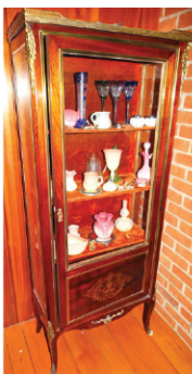
French China Cabinet & Vintage Items