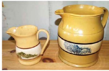
2, Mochaware Pitchers, Seaweed Decoration