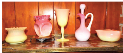
Mt Washington Burmese Items