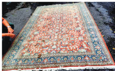
Hereke Rug 7' x 10'6"