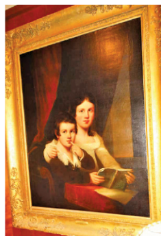
Oil/Canvas Portrait by Alvan Fisher 27 x 35