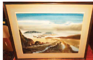
Watercolor by L. Sisson "Booth Harbour" 30 x 21