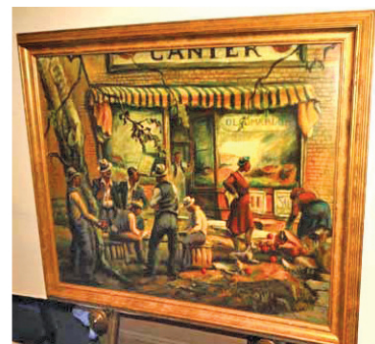
Men & Women at Store Signed, LL, 27 x 22

FURNITURE: period slant front desk; early one-drawer 1/2 round table; French one-door china cabinet; tiger maple round stand; 2-drawer blanket chest; excellent carved pedestal side table; armoire; 3 Windsor chairs; lap desk table; early chip carved box; tilt top table; 2 blanket chests; hutch table; English inlaid folding card table; French metal wash basin stand; W. Evans Shrewsbury grandfather clock ; wall liquor cabinet w/ carved bird handle; 10'6" x 7' Hereke rug; 10 1/2' x 3' runner; other Oriental rugs