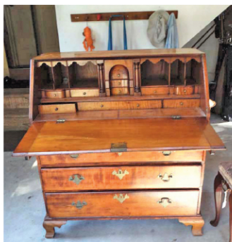
Period Slant Front Desk