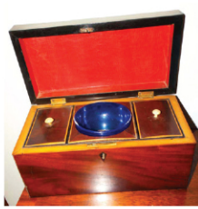
Regency Tea Caddy