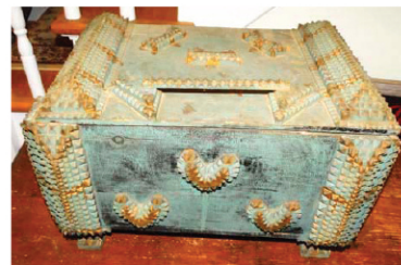
Early Chip Carved Box