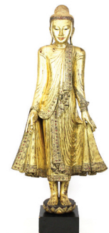
19th c Burmese Standing Buddha Figure, 80" high