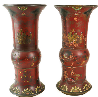
Berlin Red Lacquer Faience Beaker Form Vases