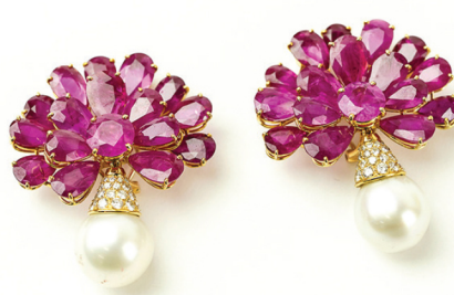
53 CT Ruby, Diamond, & Pearl Earrings