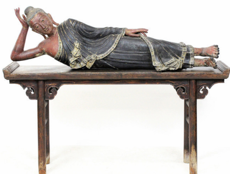
19th c Monumental Burmese Reclining Buddha, 60" long