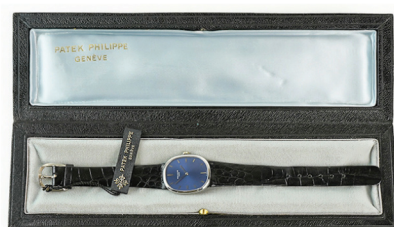
Mint Patek Philippe 18k Wrist Watch