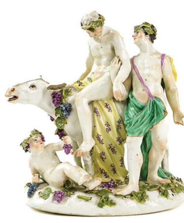
18th c Meissen Figure of Bacchus and Silenus