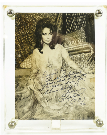
Elizabeth Taylor Inscribed Photo