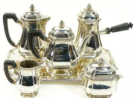
Henri Lapparra French Minerva Silver 6 pc Tea Set