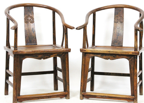
Pair of 19th c Chinese Elm Horseshoe Chairs