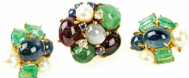
Seaman Schepps 3 Piece Cluster Set