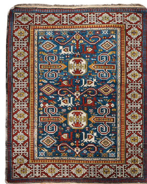
19th c fine Karabagh Kazak Area Rug