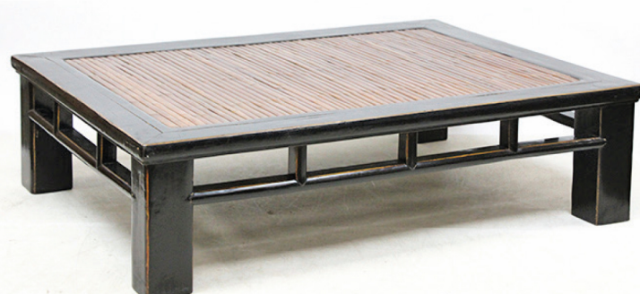
19th c Chinese Low Table or Day Bed