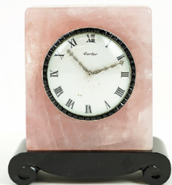
Cartier Rose Quartz Desk Clock

137 JAMES BROWN DRIVE, WILLISTON, VERMONT