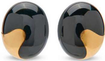
Lot 1. TIFFANY & CO., ANGELA CUMMINGS Gold and Onyx Earrings, $1,000-1,500