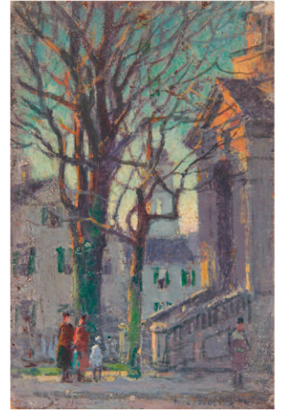
Lot 110. PAUL CORNOYER, Street View , oil on cardboard, 6 x 4 in., $1,000-2,000