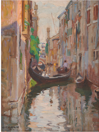
Lot 107. ALDRO THOMPSON HIBBARD, Gondolas, Venice , 1914, oil on board, 13 1/2 x 10 in., $1,000-1,500