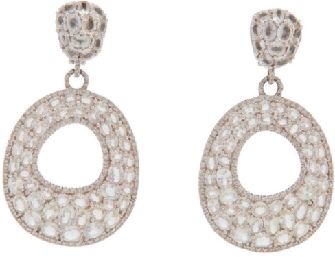
Lot 13. Gold, Colorless Sapphire, and Diamond Earrings, $3,000–4,000