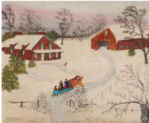
Lot 118. ANNA MARY ROBERTSON 'GRANDMA' MOSES, Almost Home , oil and glitter on masonite, 9 7/8 x 12 in., $15,000-25,000