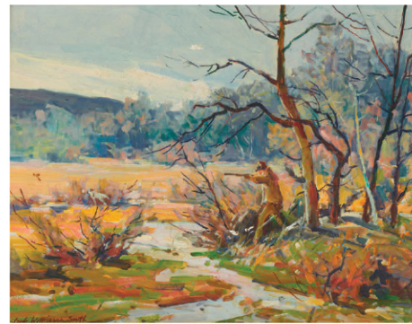
Lot 113. JACK WILKINSON SMITH, Fall Hunting Scene , oil on board, 12 x 15 in., $1,500–2,500