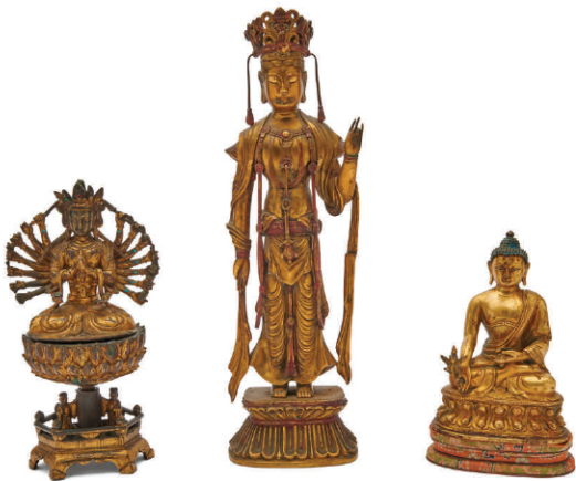
Lot 338. Three Chinese Gilt Bronze Figures, the tallest: 14 1/2 in., $2,000–4,000