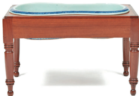
Lot 335. Rare Chinese Canton Blue and White Bidet, length: 24 in., $3,000–5,000