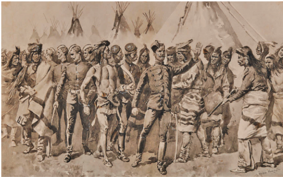
Lot 191. FREDERIC REMINGTON, Daring Arrest of Bull Elk - Attempted Rescue by a Mob of Blackfeet , watercolor on paper, 21 3/4 x 30 1/4 in., $20,000-30,000