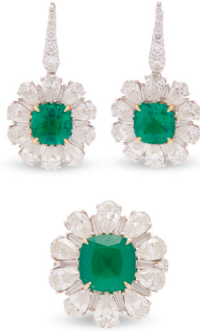
Lot 29. Platinum, Emerald, and Diamond Suite, $10,000-15,000