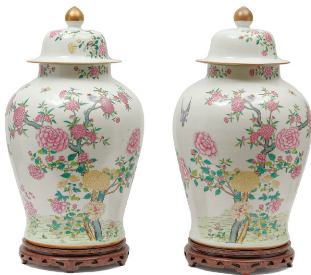
Lot 340. Pair of Fine Chinese Covered Vases, height: 29 in., $5,000–7,000