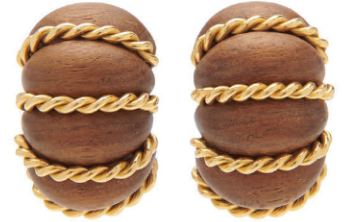
Lot 37. SEAMAN SCHEPPS Gold and Wood 'Shrimp' Eardrums, $1,000-1,500