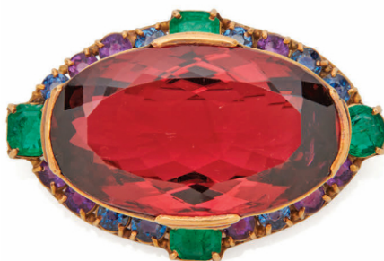
Lot 31. TIFFANY & Co. Gold, Rubellite Tourmaline, Montana Sapphire, and Emerald Brooch, $15,000–20,000