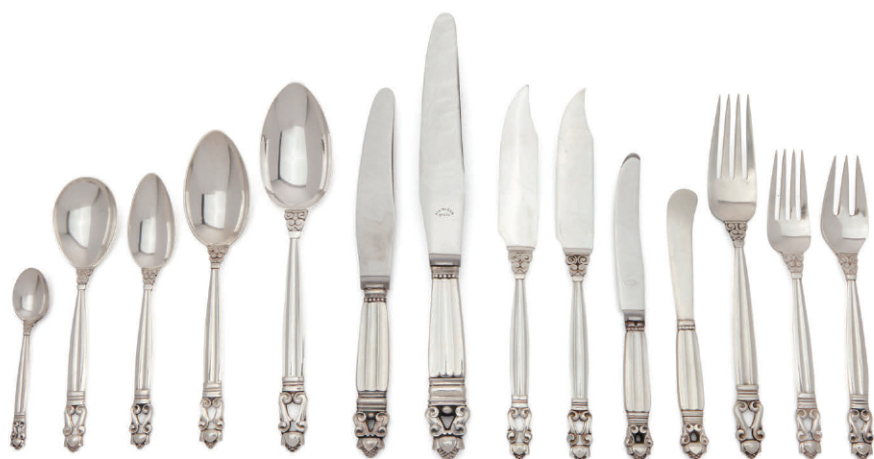
Lot 291. GEORG JENSEN Silver Flatware, Acorn Pattern, 197 pieces, $15,000–20,000