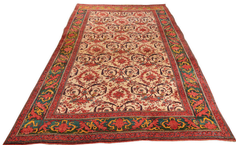
Lot 371. Bidjar Carpet, Persia, last quarter 19th century, 16 ft. 10 in. x 10 ft. 3 in., $5,000–10,000