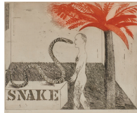
Lot 169. DAVID HOCKNEY, Jungle Boy , 1964, etching and aquatint, 15 x 20 in., $5,000-10,000