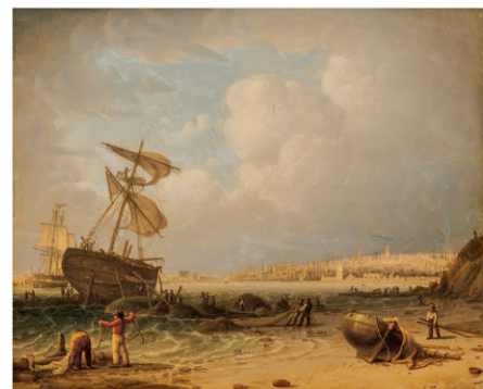
Lot 222. ROBERT SALMON, View of Liverpool , oil on panel, 10 x 12 in., $5,000–8,000