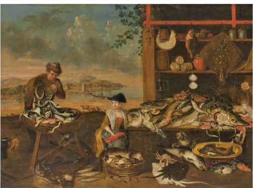
Lot 224. BALTHASAR NEBOT, A Fishmonger's Stall by an Estuary , oil on canvas, 24 1/2 x 33 1/2 in., $20,000–30,000