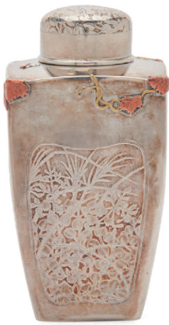
Lot 273. TIFFANY & Co. Mixed Metal Japanesque Covered Tea Caddy, $3,000–5,000