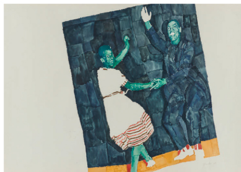
Lot 145. RICHARD YARDE, Savoy Jitterbug , 1983, watercolor, 28 x 40 1/2 in., $4,000-6,000