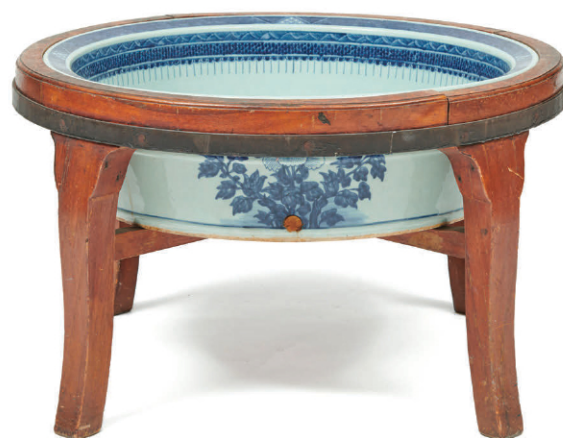
Lot 334. Rare Chinese Canton Blue and White Fish Basin, diameter: 27 in., $3,000–5,000