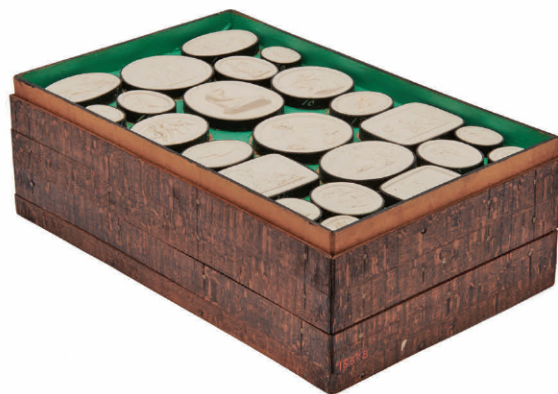
Lot 347. Box Set of Four Trays of Intaglios, $2,000–3,000