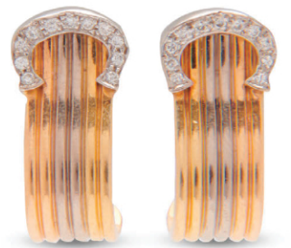
Lot 35. CARTIER Gold and Diamond 'C de Cartier' Earrings, $1,200–1,800