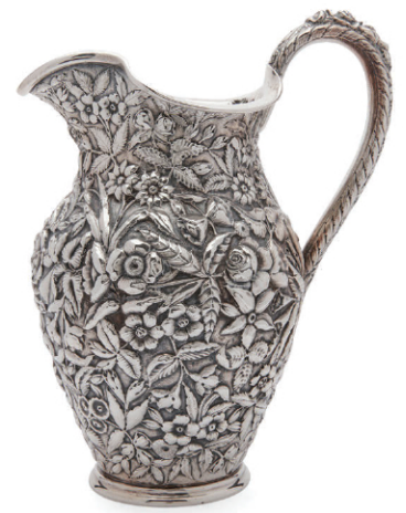
Lot 284. S. KIRK & SON Co. Silver Pitcher, $1,000–1,500