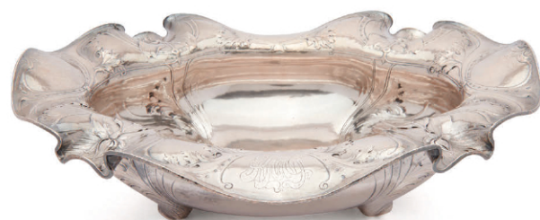
Lot 275. GORHAM Martelé Silver Center Bowl, $5,000–7,000