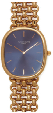
Lot 94. PATEK PHILIPPE Gold 'Ellipse' Wristwatch, $4,000–6,000