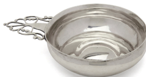
Lot 278. GEORGE WELLES Coin Silver Porringer, $2,000–3,000