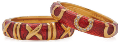
Lot 73. Two HIBALGO Gold and Enamel Rings, $1,000–2,000