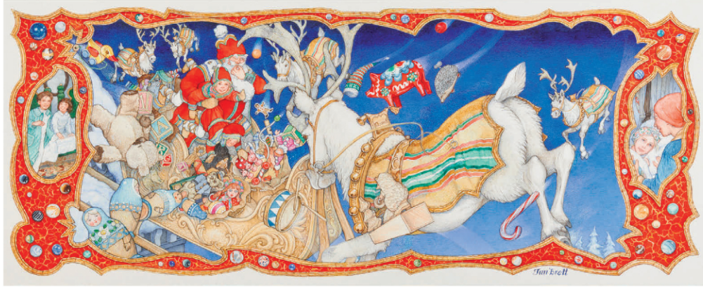
Lot 137. JAN BRETT, To His Team Gave a Whistle, from The Night Before Christmas , watercolor, 9 x 22 in., $500–800