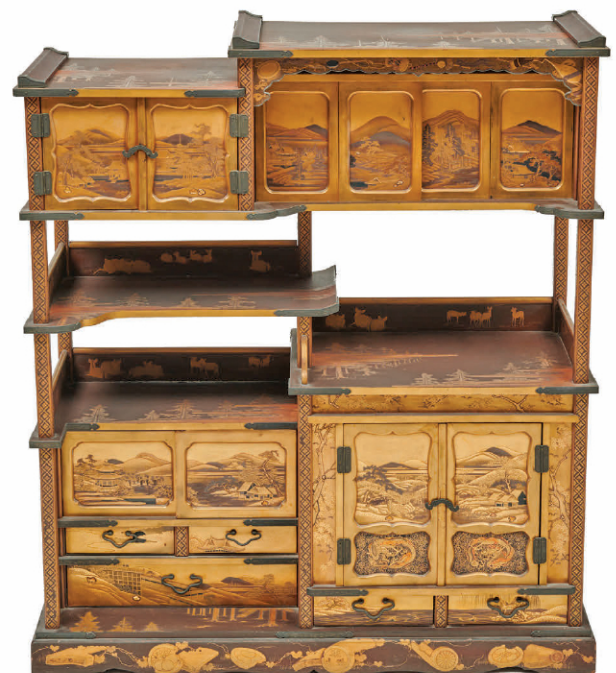
Lot 331. Fine Japanese Maki-e Lacquered Chest, late 19th century, height: 42 in., $5,000–10,000