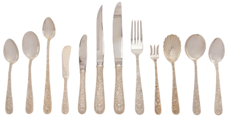
Lot 286. S. KIRK & SON Co. Silver Repousse Flatware Service, 212 pieces, $3,000–5,000