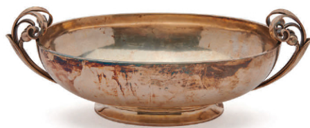
Lot 299. GEORG JENSEN Silver Two Handled Center Bowl, $3,000–5,000