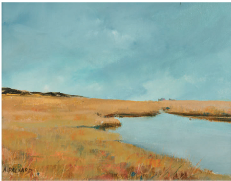
Lot 124. ANNE PACKARD, Wellfleet Marsh , oil on board, 8 x 10 in., $1,000–2,000