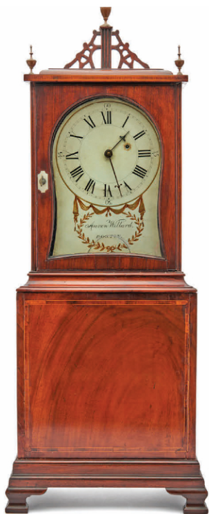
Lot 352. AARON WILLARD Eight-Day Shelf Clock, $4,000–6,000