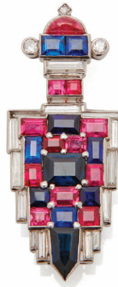
Lot 60. Platinum, Sapphire, Ruby, and Diamond Brooch, $2,000-4,000