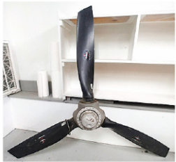
McCauley airplane propeller