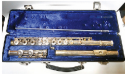
Gemeinhardt 3sh silver flute

To include: oil painting by Henry P. Smith, mid-century painting by Bartholomew, Louis Comfort Tiffany vase, Steuben lamp, antique books in a large assortment of ephemera, McCauley airplane propeller, collection of militaria, 2 mahogany dining room sets, Kittinger handkerchief table, Tiffany and Company Ice bucket, Royal Doulton China service for 8, Waterford Crystal, collection of Japanese porcelain, baseball card collection, collection of golf clubs and related items, Geminhardt 3SH silver flute, a large variety of country and primitive items, Oriental, and hundreds upon hundreds of other items.