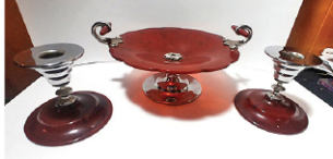
Manning & Bowman