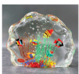
Murano Art Glass Fish Aquarium Glass Sculpture