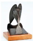
Pablo Picasso 1960s Bronze Sculpture Cubist Woman's Head