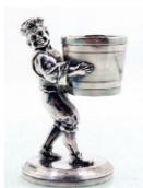
James W Tufts Boston Silver Plate Boy Figure Toothpick Holder