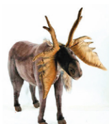
Stuffed Toy Moose Prop Figure 52 in. Length