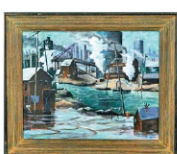
Industrial Era on River Oil Painting