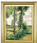
Willard L Metcalf, Pastel Landscape