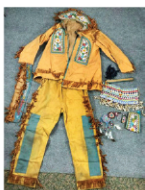
Native American Indian Beaded Outfit