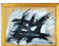
Style of Franz Kline, Lines Abstract