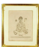
Foujita #118/250 Self Portrait Lithograph

Information: 845-663-3037 call or text; email: donny@donnymaloneauctions.com