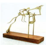
Brutalist Mid Century Horse and Rider Sculpture