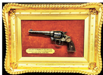
Colt model 1895 Navy revolver serial #16532