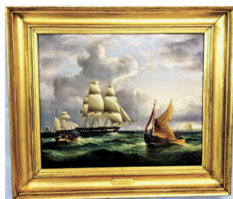
James E. Buttersworth schooner painting