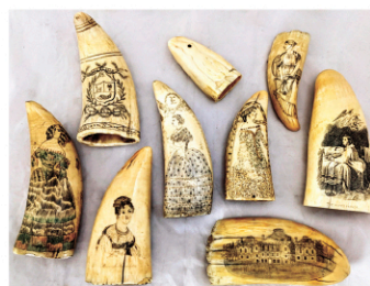
Scrimshaw Teeth Selection