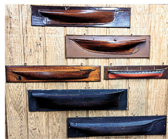
Antique Half models