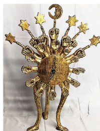
Pedro Friedeberg clock