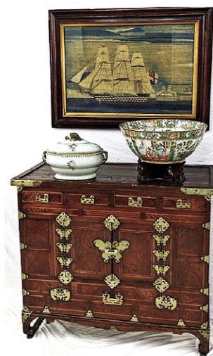
Ship Woolwork & Oriental