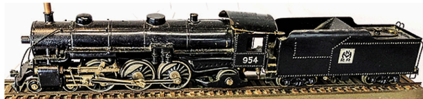
Scale model steam locomotive