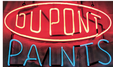
Dupont Paints paint neon sign