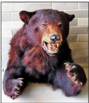
Sample of animal mounts.

Previews: Fri. Oct. 29 1:00-5:00PM, Wed, Thurs, and Sat By Appointment Only and Sunday 11:00AM to start time.