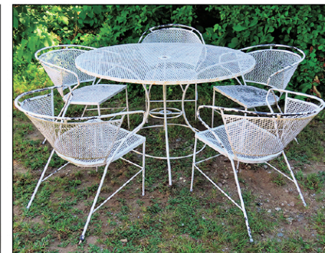
Woodard Patio set – 1 of 5 featured.