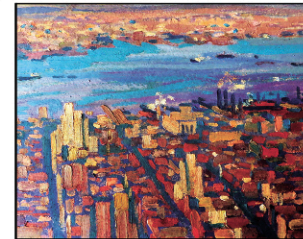
Sample of Jacobus Belsen artwork