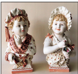
Porcelain figures signed KPM.