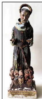
Carved sculpture of St. Anthony 18th c.