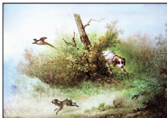
French painting on porcelain.