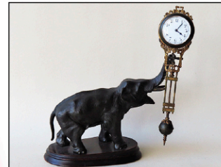
French bronze pendulum clock.