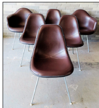
Set of 5 Herman Miller leather chairs.

Selling the partial contents of several local estates including a Millbrook Farmhouse, Rhinebeck & Hyde Park village homes, local physicians estate, attic finds from an Old Saybrook country estate, etc. Sale to include 700 lots. FURNITURE: American Pembroke table - blanket chest in original blue-green paint plus other blanket boxes - a fine 19th c. corner cupboard - 4 matching step-down Windsor chairs - other primitive furniture - outstanding Victorian oak bedroom set - Kensington Jacobean style Dining Room Set - Mid-Century modern coffee tables, Herman Miller chairs, Harp chair, Dux chairs, Selig Chest, Ekornes lounge chair - Hunt Country kitchen table & chairs - A like new Ralph Lauren 3 piece wicker porch set - 5 wrought iron patio sets including Woodard plus other garden related - six good floor standing and table top glass showcases 19th c. - Large wooden farm stand display - Eight boat models in glass showcases including 1 in tramp art diorama frame - Rustic objects - Tiffany sterling bowl - Two sterling flatware sets - Other sterling - Silver tankard 18th c. - Fountain pens including sterling - Swiss 6 tune music box - Columbia Grafonola - Spool boxes - Dirk Van Erp copper bowl and other Arts & Crafts collectibles - 1854 American gold coin - Cast Iron horse head hitching post - Brown bear full body rug - Black bear mount plus other animal mounts - Newhouse No. 5 bear trap - Architectural