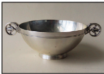
Signed Tiffany & Co. – sample sterling.