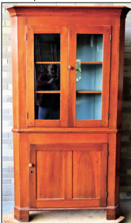
Good 19th century corner cupboard.