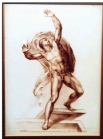
Sample of engravings – Fr. Bartolozzi 18th C.