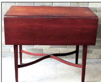
Sample of early country furnishings.