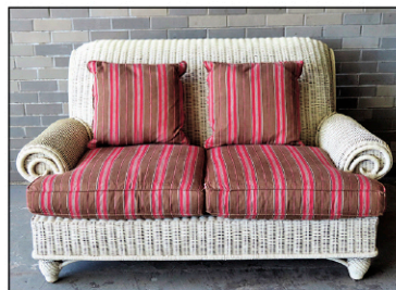
Ralph Lauren 3 piece wicker set.