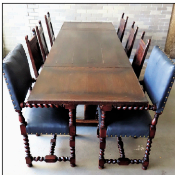
A Jacobean style Kensington DR set.