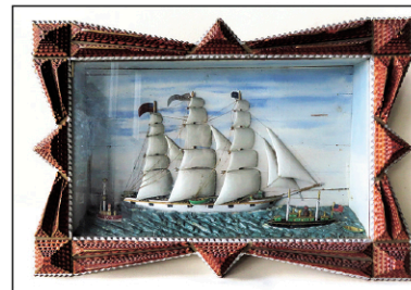
Diorama ship model plus others.