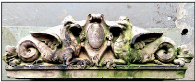
Carved stone building sculpture