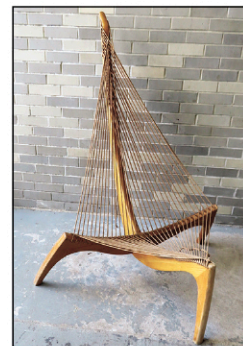
Mid-Century harp chair