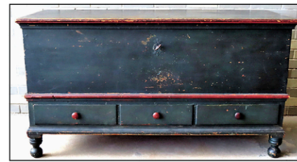
Sample of Country.