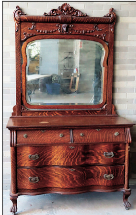
Sample of Victorian.