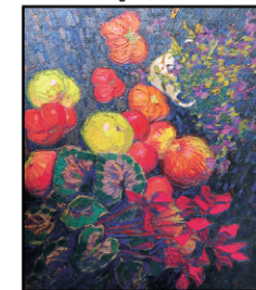
Sample of Jacobus Belsen artwork