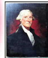
O/C Portrait of George Washington.