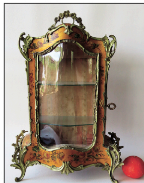
Victorian Miniature vitrine.