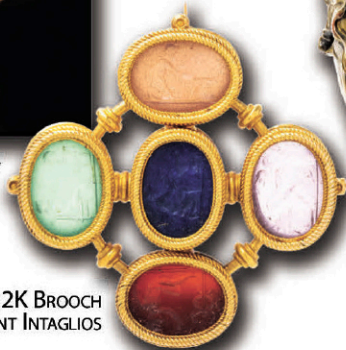
18TH CENTURY 22K BROOCH WITH FIVE ANCIENT INTAGLIOS