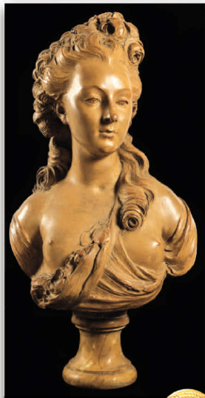
BUST OF MADAME DU BARRY