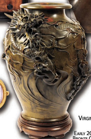
EARLY 20TH CENTURY ARCHAIC PATINATED BRONZE CHINESE VASE