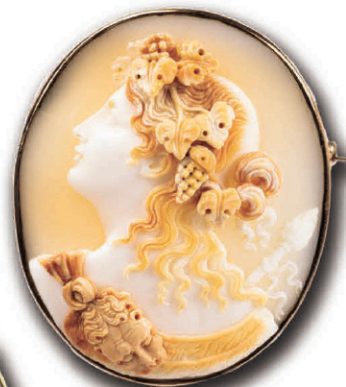
VICTORIAN ERA SHELL COMEON IN 14K YELLOW GOLD MOUNT