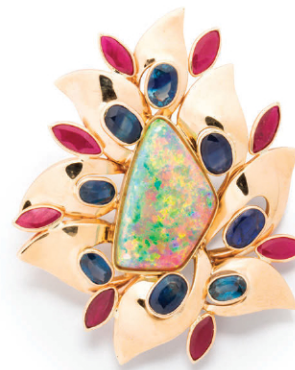
An opal, ruby, sapphire and fourteen karat pendant brooch