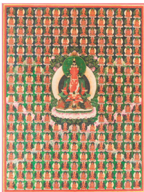
Sino-Tibetan thangka depicting Amitayus