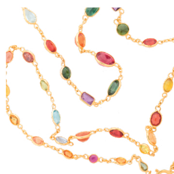
A multi-hued sapphire and eighteen karat gold necklace