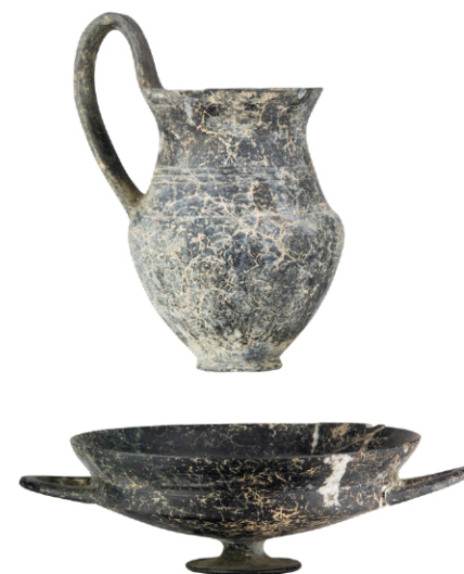
Pottery to include Etruscan style and Pre-Columbian vessels and figures