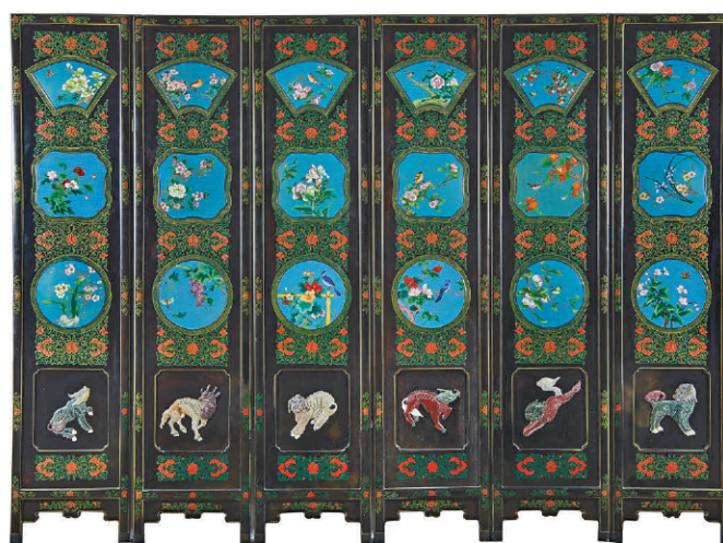
Chinese six-panel folding screen