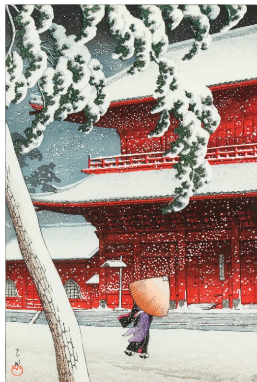
Kawase Hasui (Japanese, 1883-1957), Shiba Zozoji Temple, from the series of Tokyo nijukei (20 views of Tokyo), woodblock print, 1925