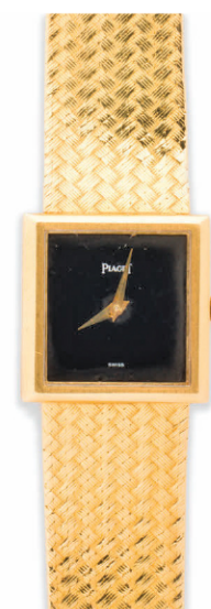
An eighteen karat gold bracelet watch, Piaget