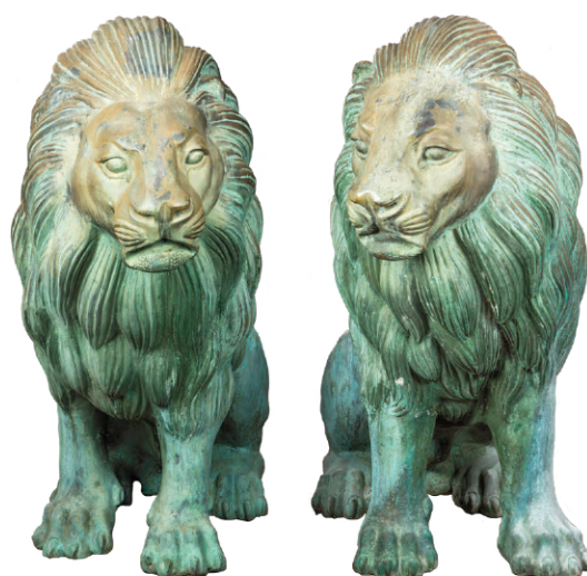
Pair of patinated bronze lions