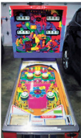
1 of 2 Pinballs