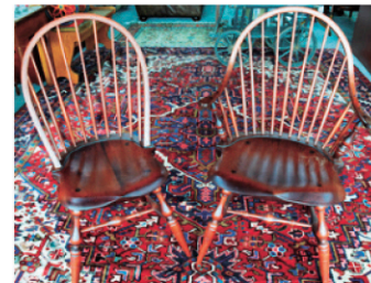
Set of 6 Windsors