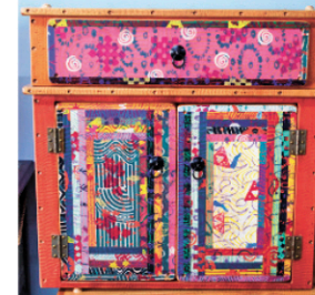
Several Painted Furniture Lots