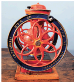
Large Coffee Mill