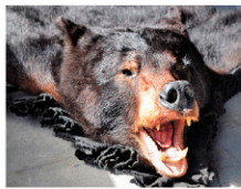
Marvelous Bear Rug