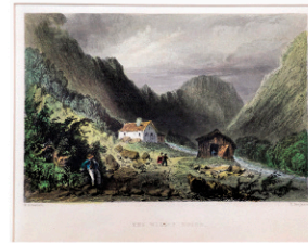
13 NH Lithographs