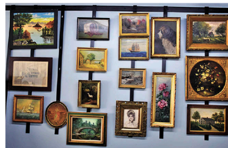
Wall of Art