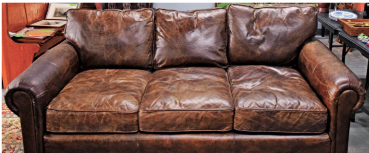
Restoration Hardware Leather Couch