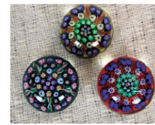
Several Art Glass Lots