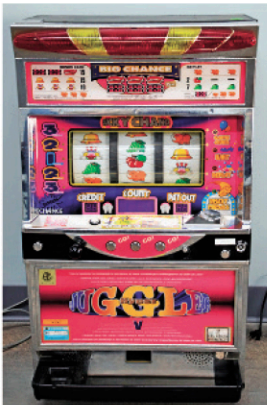
1 of 2 Slot Machines

250 lots to include multiple NH, Maine and Civil War documents, Famous autographs, Kittinger furniture, oriental rugs, artwork, antique tools, kiln, rose medallion, dolls, bison head, lamps, shades, and maps