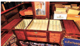
French inlaid dressing table