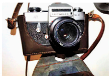
Leica Flex SL2 Wetzlar camera