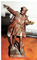
#021 Gorham- Christopher Columbus statue