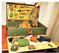
G.I. Joe toys & acc.

FURNITURE: exc. period 5-drawer bureau; period Hepplewhite bureau; French inlaid dressing table; camphor chest; candle stand; sea chest; 2-drawer stands; 5-drawer oak bureau; mini blanket chest