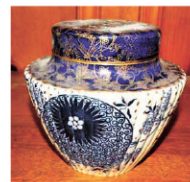
Doulton Burslem ginger jar