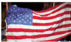
48 star flag