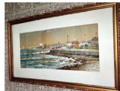
w/c Narragansett sea wall by Edmund Darch Lewis