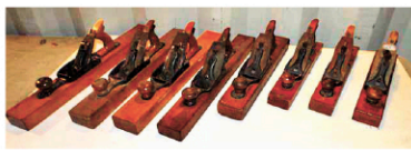
Approx 20 transitional planes