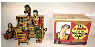
Lil Abner & dog patch band - box