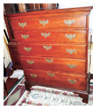
Period 5-drawer bureau