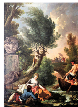
Jean-Baptiste Henri Deshayes (French, 1729-1765). Paysage de Rivière avec des Pêcheurs