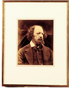
Julia Margaret Cameron (British, 1815-1879). Alfred Lord Tennyson, 3 June 1868. Medium: Albumen silver print from glass negative