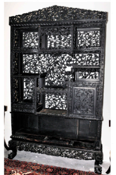
Chinese Ebonized Rosewood Etagere. Late 19th century