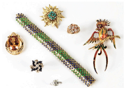
Part Collection Estate Jewelry