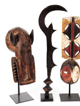
Part Collection African Tribal Artifacts