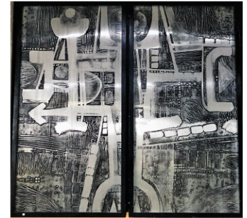
Gruppo NP2: Nerone Ceccarelli and Gianni Patuzzi (Italian). Untitled . 1966. A pair of acid-etched steel plates