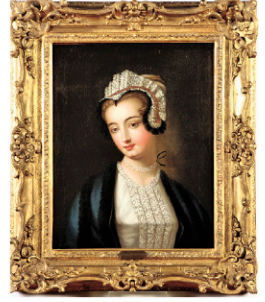
Attributed to Sébastien Bourdon (French, 1616 - 1671). Member of the Swedish Royal Household