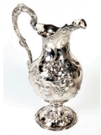
Sterling Silver Repousse Water Pitcher. 19th century