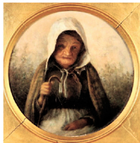
Dutch School (17th Century). Old Woman Resting