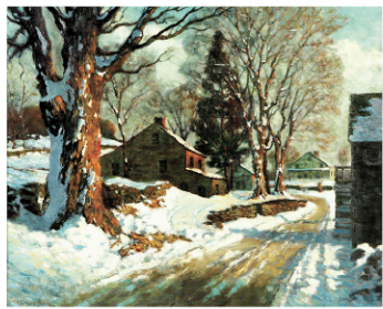
Edward Willis Redfield (American, 1869-1965). Snowy Road through Pennsylvania Town