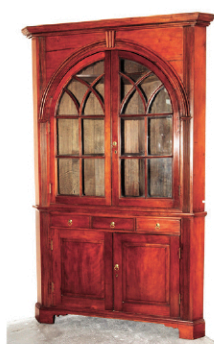
Virginia Chippendale Country Corner Cupboard (18th century).