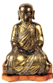
Bronze Chinese Gilded And Patinated Buddha With Associated Wood Base, 18th Century or earlier.