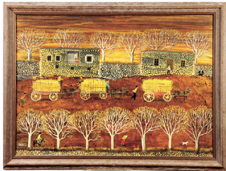
Yalçın Gökçebag (Turkish, born 1944). Corn Harvest, Turkish Village