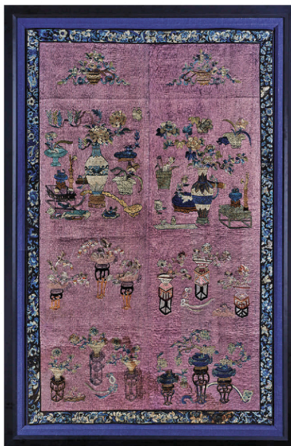
Chinese lavender ground embroidery panel