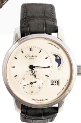
A stainless steel wristwatch, PanoMaticLunar, Glashütte Original