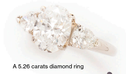
A 5.26 carats diamond ring