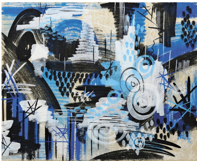
Gordon Onslow Ford (American/British, 1912–2003), "Of the Wilds," 1955, gouache on canvas, 38"h x 47" (1 of 2)