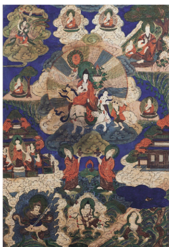
(lot of 2) Tibetan Thangkas of Tsongkhapa