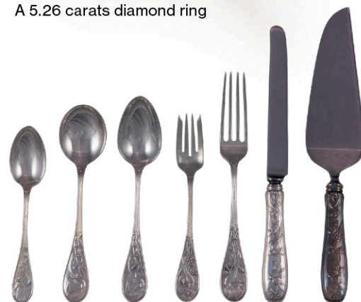
Tiffany sterling flatware service for twelve in the Audubon pattern