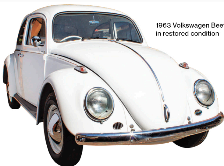
1963 Volkswagen Beetle in restored condition