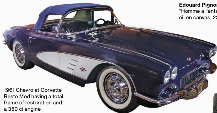
1961 Chevrolet Corvette Resto Mod having a total frame of restoration and a 350 ci engine