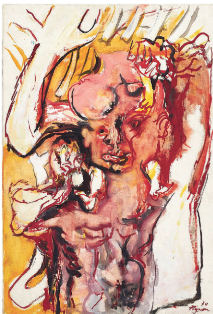
Edouard Pignon (French, 1905-1993), "Homme a l'enfant (rouge-blanc)," 1970, oil on canvas, 22" x 14.75"