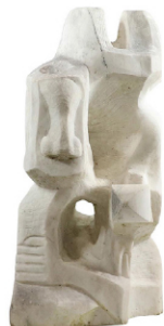
20thC. Latin American Modernist Marble Sculpture