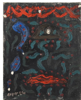
Karel Appel, Abstract Oil on Canvas Painting