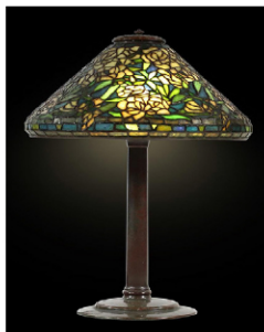
Tiffany Studios New York "Wild Rose" Leaded Glass Table