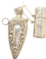
[2] .925 Sterling Silver Fancy Snuff Bottles Pendants