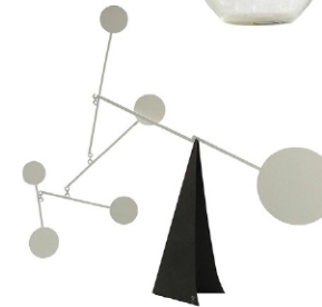
Modern Design Black & White Metal Table Top Mobile