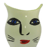
Kosta Boda Art Glass Cat Face Vase Signed Ulrica Hviva