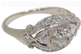
14K White Gold Diamonds Engagement Ring Size 6.75