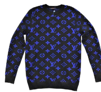
Louis Vuitton Monogram Men's Sweater. Clean, with Tag, never worn.