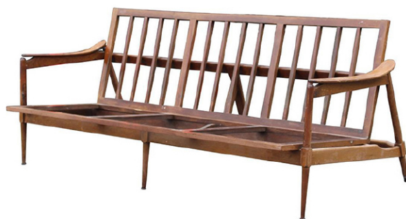
Mid-Century Modern 3-Seat Sofa Frame Curved Arms