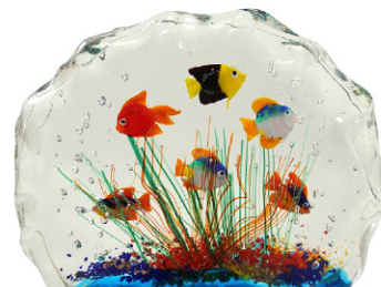
Murano Art Glass Aquarium Sculpture with Shoal of Fish