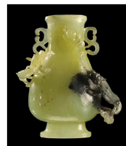
Antique 19th C. Chinese Jade Vase Carved Outer Dragons