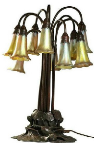
TIFFANY STUDIOS NEW YORK 10 Light Lily Lamp