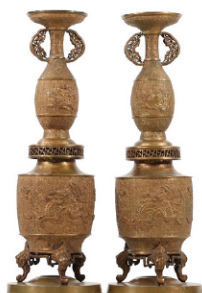
[2] Asian Oriental Tall Bronze Temple Candle Holders. Intricate incised design with dragons