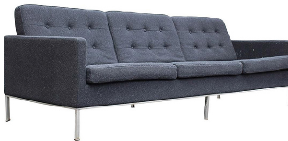
Organic Modernism Black 3-Seat Upholstered Sofa