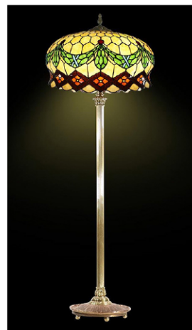
Wilkinson Exceptional "Drape" Leaded Glass Floor Lamp