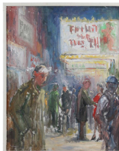
1950s Impressionist Painting 42nd Street with Figures