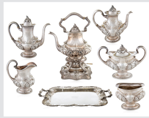
Lot 315 - AN AMERICAN NINE-PIECE SILVER TEA SERVICE, MAUSER & CO., NEW YORK, 1887-1903 Est.: $7,500-$10,000