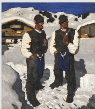
Lot 9 - ALFONS WALDE (AUSTRIAN 1891-1958), Bauernsonntag Est.: $200,000-$300,000