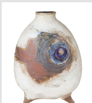
Lot 889 - A MODERN EARTHENWARE VASE Est. $500-$700