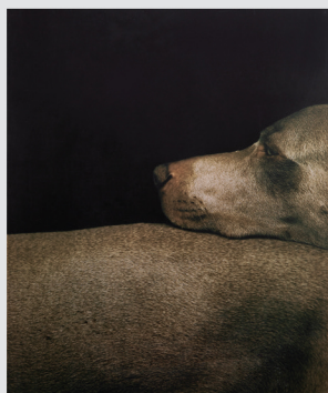
Lot 576 - WILLIAM WEGMAN (AMERICAN B. 1943), Overview, 1998 Est. $1,000-$2,000