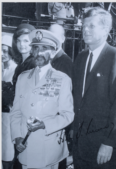
Lot 239 - A VINTAGE SIGNED PHOTOGRAPH OF JACKIE AND JOHN F. KENNEDY AND HAILE SELASSIE, 1963, Est.: 1,200-$1,800