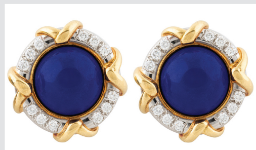
Lot 360 - TIFFANY 18KT ROUND LAPIS LAZULI, DIAMOND AND GOLD EARRINGS, CIRCA 1985 Est.: $2,500-$3,500