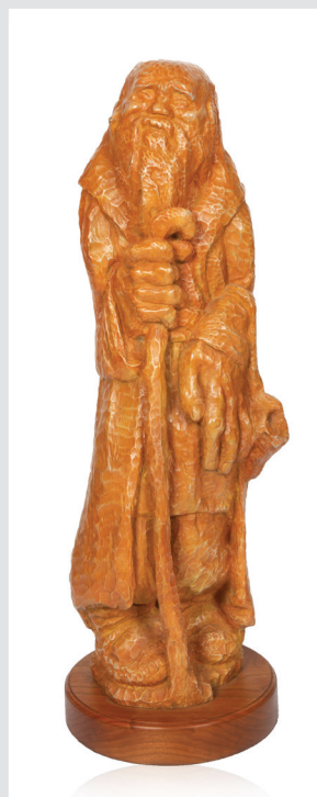
Lot 88 - NICOLAI FECHIN (AMERICAN 1881-1955), Large Pilgrim, 1997, height without base: 26 3/8 in.; height with base: 28 in. Est.: $7,000-$9,000