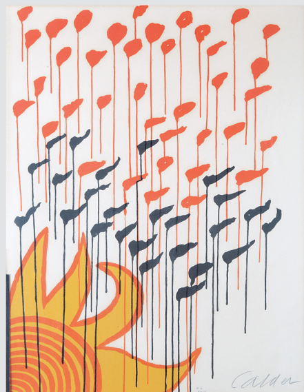
Lot 119 - ALEXANDER CALDER (AMERICAN 1898-1976), One plate from Magie eolienne portfolio, 1972, 25 5/8 x 19 1/4 in. Est.: $1,500-$2,000