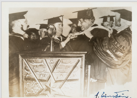
Lot 238 - A VINTAGE SIGNED PHOTOGRAPH OF EINSTEIN RECEIVING AN HONORARY DIPLOMA FROM YESHIVA UNIVERSITY, NEW YORK CITY, 1934 Est.: $3,000-$5,000