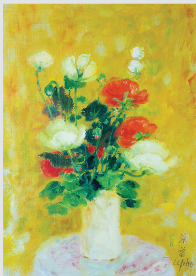
Lot 3 - LE PHO (VIETNAMESE-FRENCH 1907-2001), Les Pavots, 1977, 18 1/8 x 13 1/4 in. Est.: $15,000-$20,000