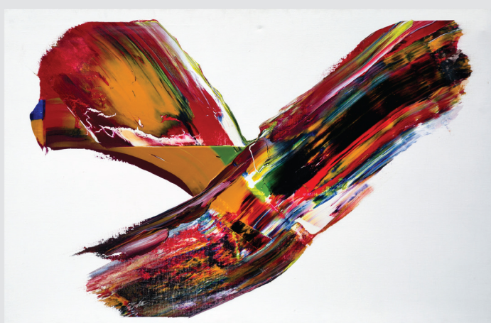
Lot 103 - PAUL JENKINS (AMERICAN 1923-2012), Phenomena Rope the Wind, 1979, 50 x 78 in. Est.: $20,000-$30,000