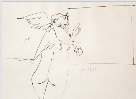
Lot 114 - ANDY WARHOL (AMERICAN 1928-1987), Angel, 1972, 9 x 11 3/4 in. Est.: $3,000-$5,000