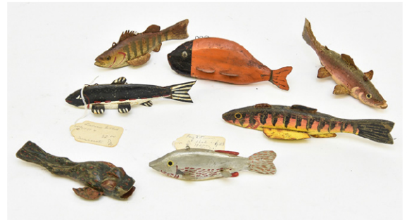
Part of a Minnesota Folk Art Ice Fishing Lure Collection