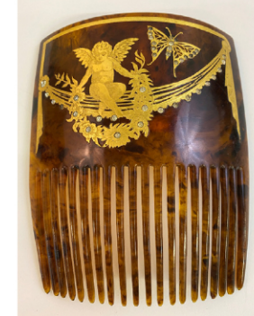
French Victorian Hair Comb - part of a large collection