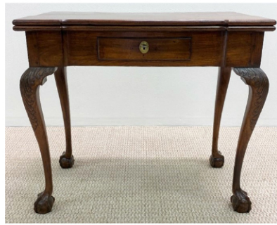
Chippendale Gaming Table