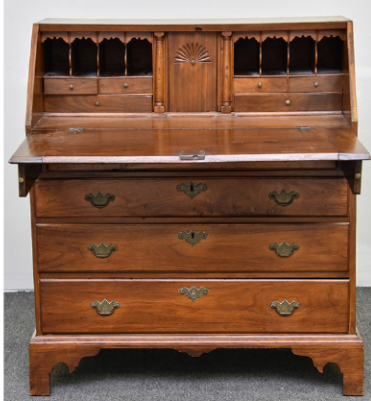
New England Maple Desk