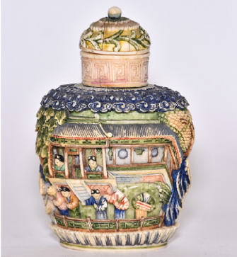
Chinese Snuff Bottle, 18th c.