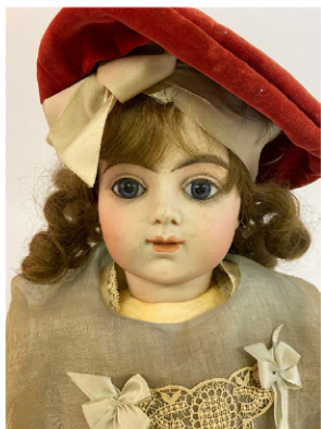
Bebe Bru 10 French Doll