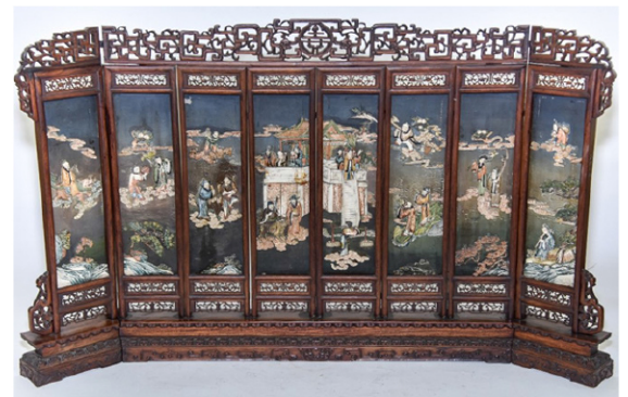
Imperial Chinese Table Screen