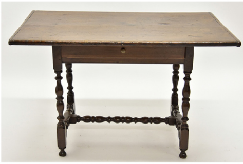
New England William & Mary Tavern Table