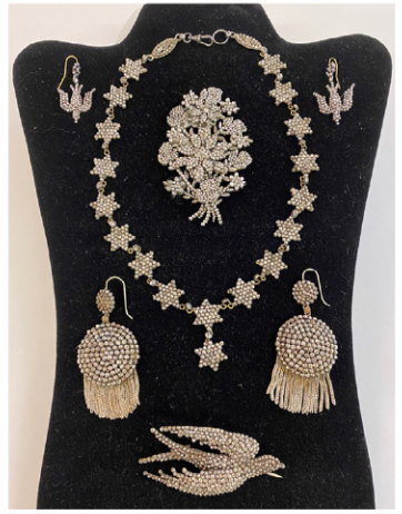
Early Cut Steel Jewelry Set