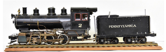
Large Live Steam Locomotive