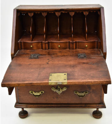
Childs New England Desk