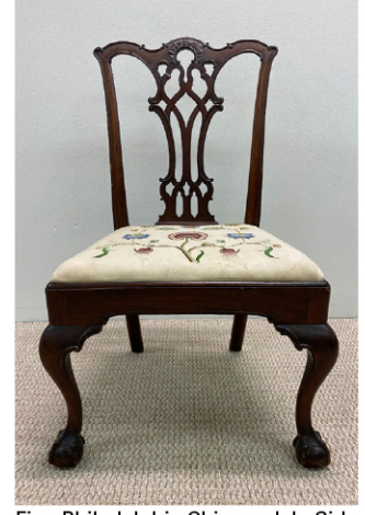
Fine Philadelphia Chippendale Side Chair