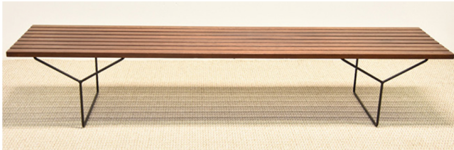
Large Harry Bertoia Bench