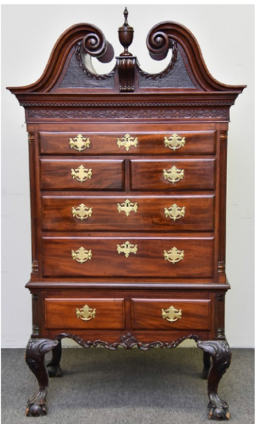
Diminutive Bench Made Highboy