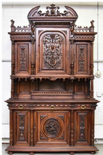
Monumental Black Forest Sideboard