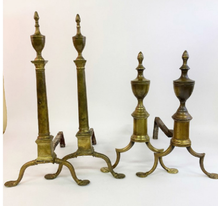
Two Pair Philadelphia Andirons, c. 1790