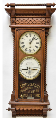
One of many clocks