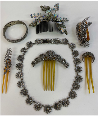
Victorian Steel Cut Jewelry and Hair Combs

Wiederseim.com • (610) 827-1910 • info@wiederseim.com