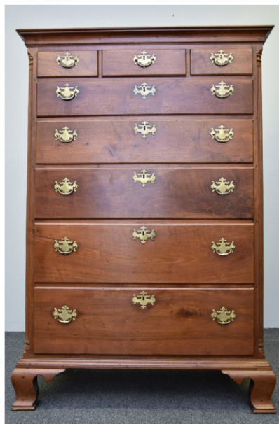
18th c. Delaware Valley High Chest