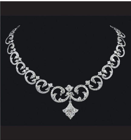
Collection of Estate and Fine Jewelry including Edwardian Platinum and Diamond Necklace, Rare Patek Philippe 18kt. Pocket Watch