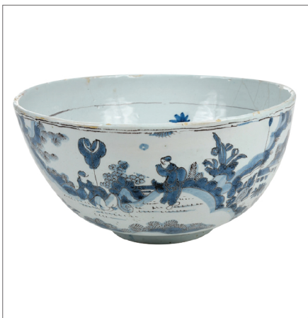
Collection of Decorative Arts including Rare Early English Delftware Punch Bowl