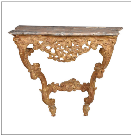
Pair Louis XV Carved Marble Top Console Tables one of a pair, French, 18th century