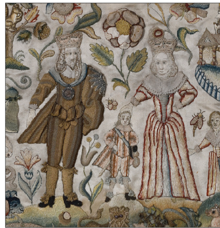
Textiles from the Collection of Dudley and Constance Godfrey including Fine Charles I Raised Silk and Lace Needlework and Charles II Silk Biblical Needlework