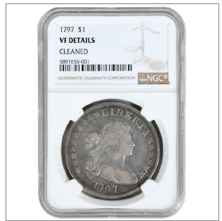
Collection of Coins 1885-CC Morgan Dollar