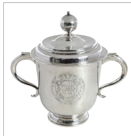
English, French, and Tiffany Silver Queen Anne English Silver Covered Two Handle Cup