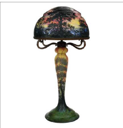
Art Glass including Daum Nancy Art Glass Lamp with Sunset Landscape