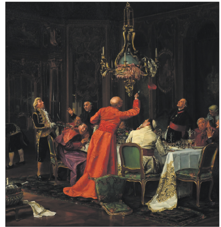
François Brunery His Eminence's Monkey