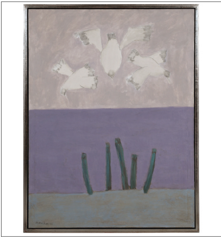
Milton Avery Birds Over Sea, 1957