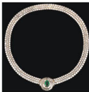
Piaget "High Jewelry" Emerald & Diamond Necklace