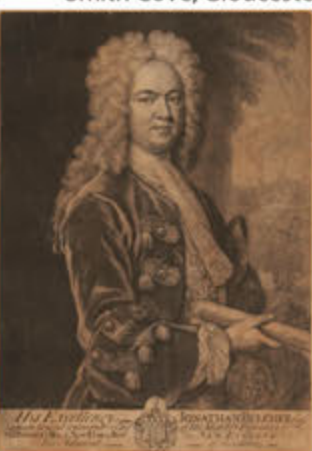
MA Gov. Belcher, engraved by Faber