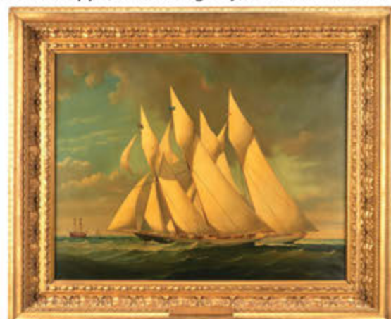
Charles Gregory, "Cambria Racing in The America's Cup, 1870"