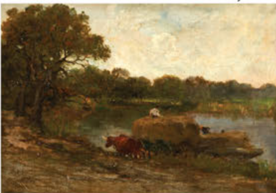
Chas. Gruppe, "Unloading Hay, Connecticut River"