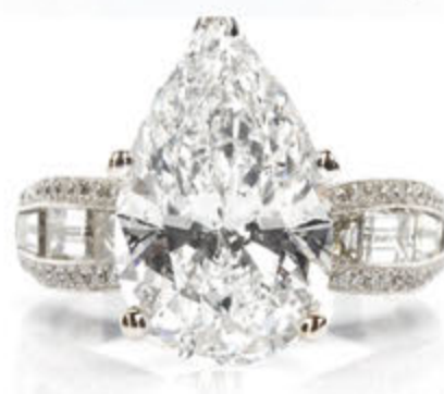
6.3 ct. Diamond Ring, designed by JB Star

Two-Day Fine Art & Antiques Auction - Knoxville, TN - July 11 (9am) & 12 (1pm) - ET COMPLETE CATALOG: WWW.CASEANTIQUES.COM