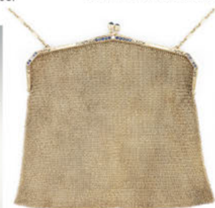
Tiffany 14K, Diamond & Sapphire Purse w/coin purse, ex-Lena Jones Spring