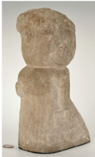
William Edmondson "Lady With A Book"