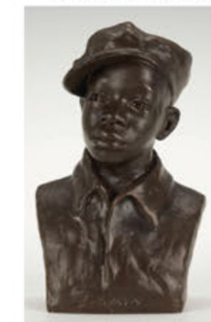
Augusta Savage, "Gamin"