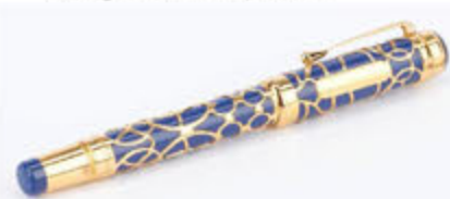
Luxury Pen Collection, including Montblanc "Prince Regent"