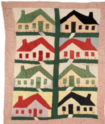
African-American Quilt, Exhibited, Colonial Williamsburg