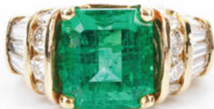
5.3 ct Emerald and Diamond Ring