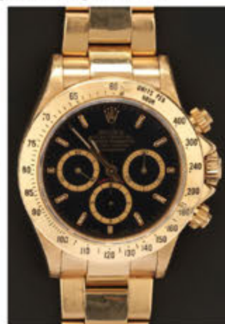
18K Rolex Explorer