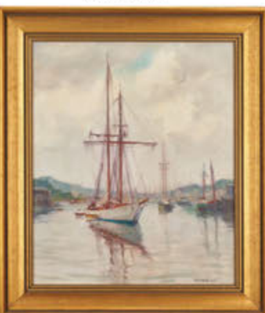
Emile Gruppe, "Smith Cove, Gloucester"