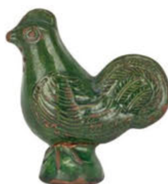
Moravian Chicken Caster