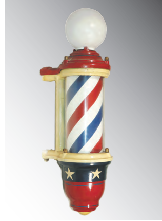
Cast Iron Barber Pole