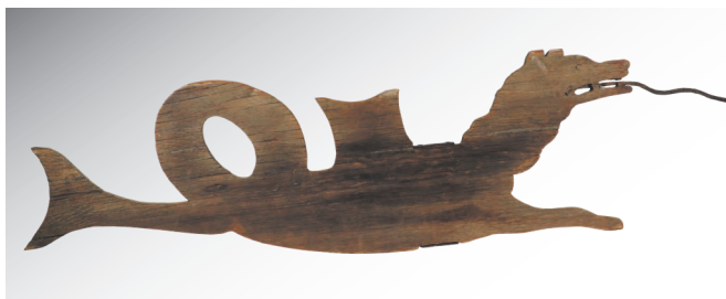
18th c. Sea Serpent Form Weathervane