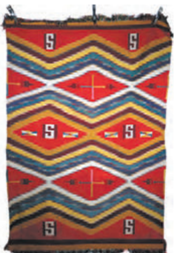
Ca. 1900 Navajo Germantown Rug