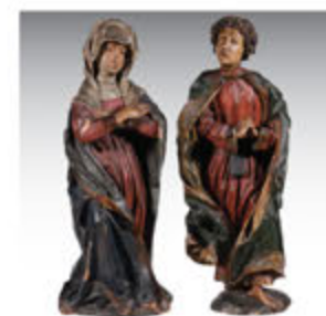
Late Gothic Ecclesiastical Figures