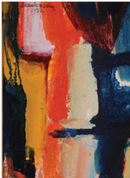
Alexei Von Jawlensky, 1930