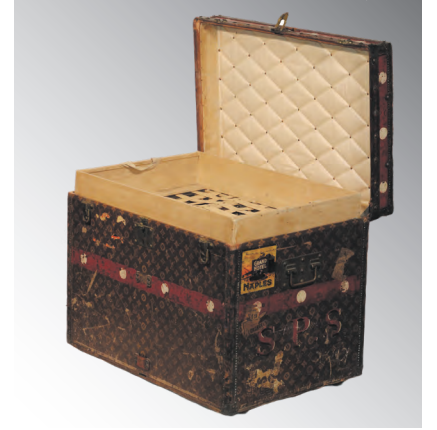
Louis Vuitton Trunk