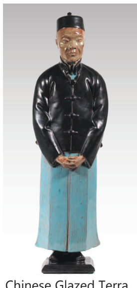
Chinese Glazed Terra Cotta Figure