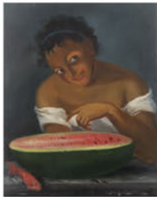
Folk Art Painting, 19th c.