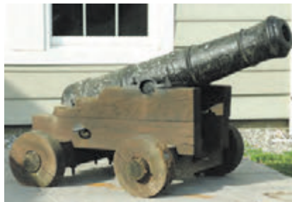
Revolutionary War Naval Cannon