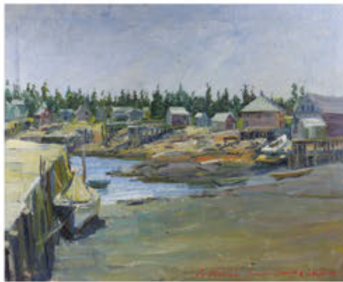
Charles Dana Gibson