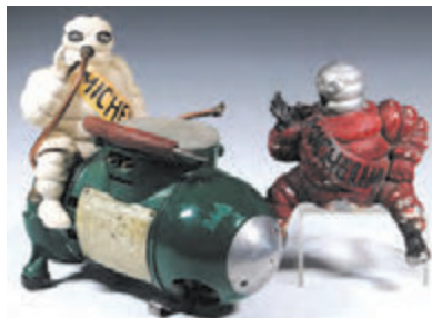
Michelin Tire Inflator, ca. 1920