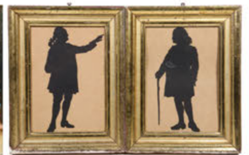
More than 55 lots of miniature portraits and silhouettes