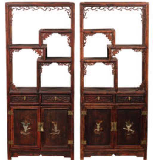
Chinese Display Cabinets w/Stone Inlay

Thomaston Place AUCTION Galleries the Preservation Generation™