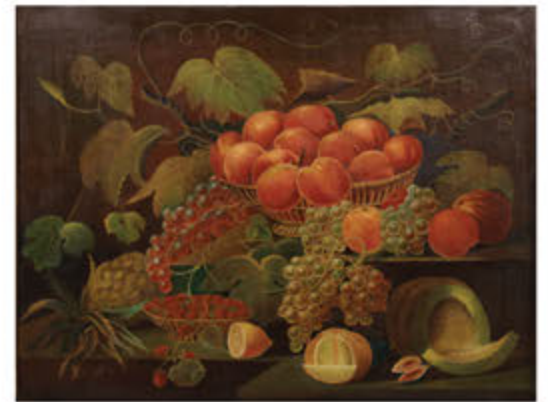
American Itinerant Artist, ca. 1860