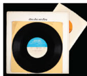
Bob Dylan Studio Recording, "Too Much of Nothing"