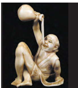
Early Japanese Netsukes, more than 55 lots