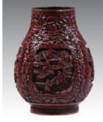
Qing Cinnabar Vase