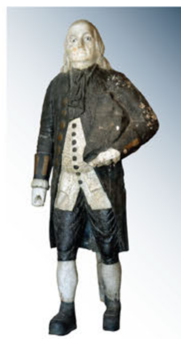
Full-Length Ship's Figurehead from SS Franklin, ca. 1850