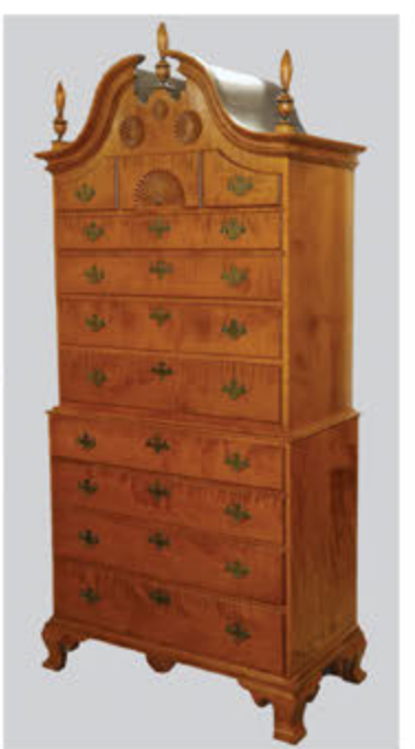
A wide selection of American, European and Contemporary Furniture