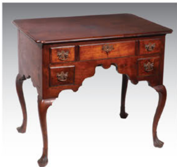
Queen Anne Philadelphia Walnut Lowboy