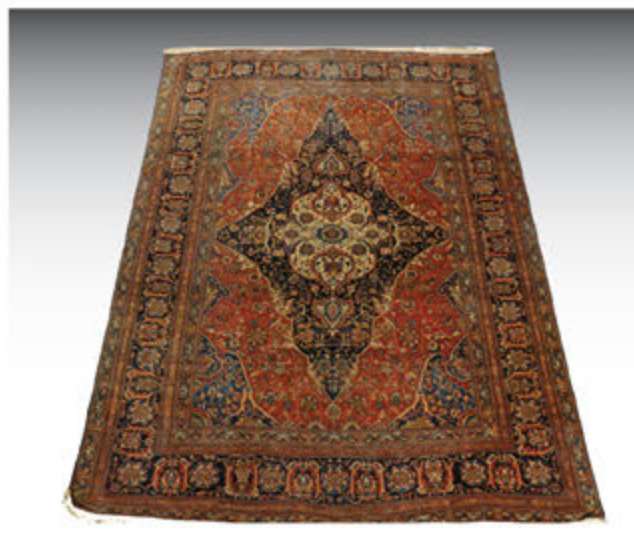
Fereghan-Sarouk Carpet 7' 3" x 9' 6"