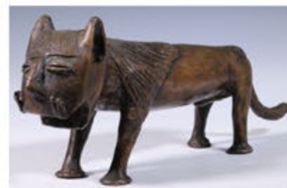
Bronze Tiger, 23 African Lots