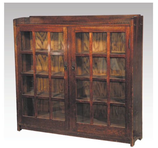
Gustav Stickley Two Door Bookcase

Thomaston Place AUCTION Galleries the Preservation Generation™