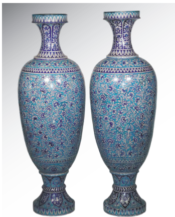
Palace Scale Persian Pottery Vases, 18th - 19th c.