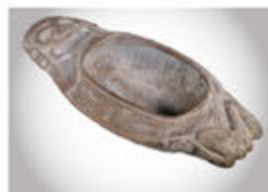
Taino Cahoba Bowl