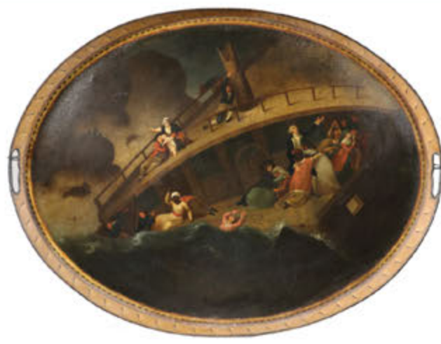
18th c. Painted Tole Tray of Shipwreck Scene