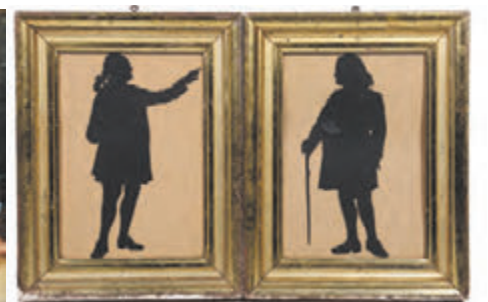
More than 55 lots of miniature portraits and silhouettes