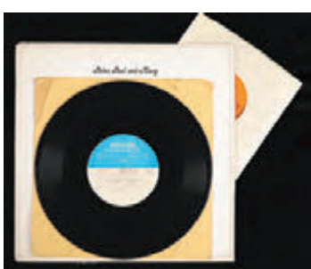
Bob Dylan Studio Recording, "Too Much of Nothing"