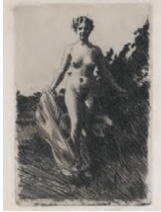
Anders Zorn, 1 of 6