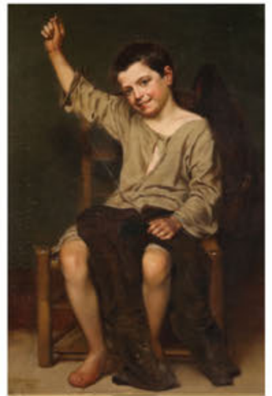
John George Brown