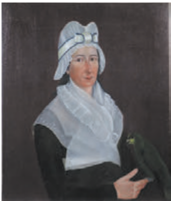
Attributed to John Brewster

Fine Art | Antiques | 20th c. Decorative Items