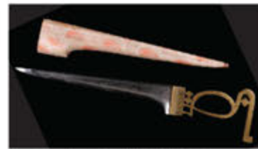
Mughal Gold Inlaid Dagger