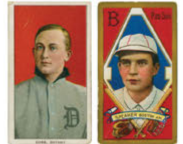
Early Baseball Cards, 24 lots