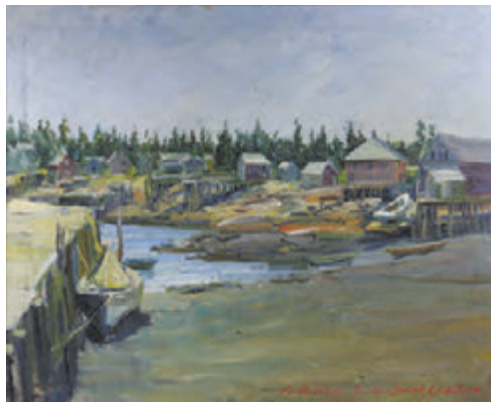
Charles Dana Gibson