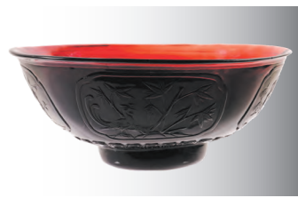
Peking Glass Bowl Qing Dynasty, 1 of 5 lots