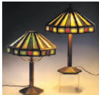
Bradley & Hubbard Lamps