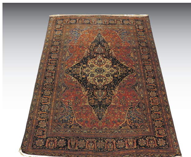
Fereghan-Sarouk Carpet 7' 3" x 9' 6"