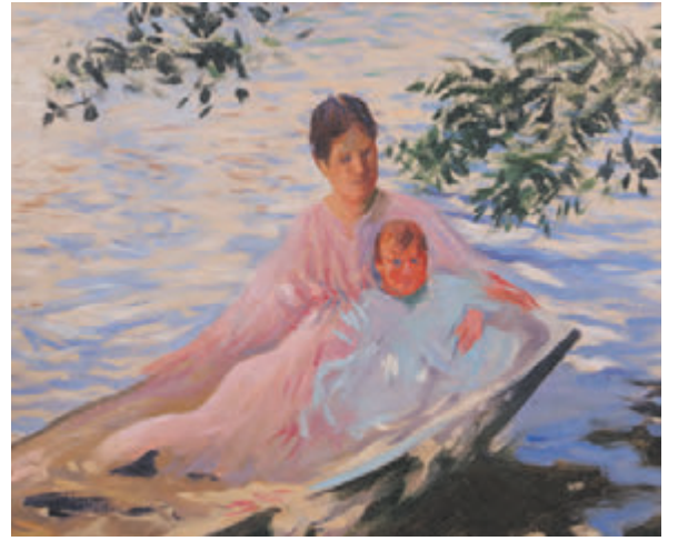
Edmund Charles Tarbell (study)