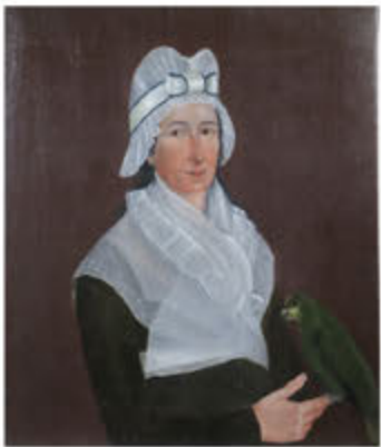
Attributed to John Brewster

Fine Art | Antiques | 20th c. Decorative Items