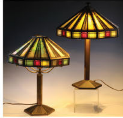
Bradley & Hubbard Glass Lamps