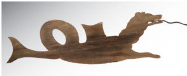
18th c. Sea Serpent Form Weathervane