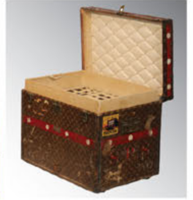
Louis Vuitton Trunk