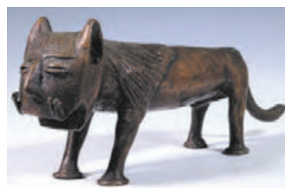
Bronze Tiger, 23 African Lots