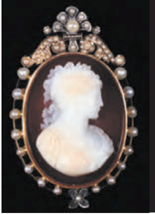
Estate Jewelry & Watches - 106 Lots