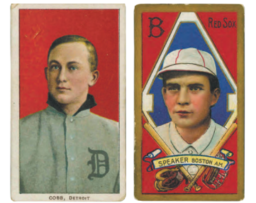
Collection of Early 1900s Baseball Cards, 24 lots