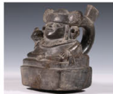
Pre-Columbian Pottery, 18 lots