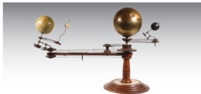
Rare Laing's Planetarium Orrery