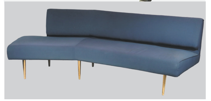
A variety of furniture from a 17th c. Elm Monestary Table to Mid-Century Edward Wormley-designed Sofa