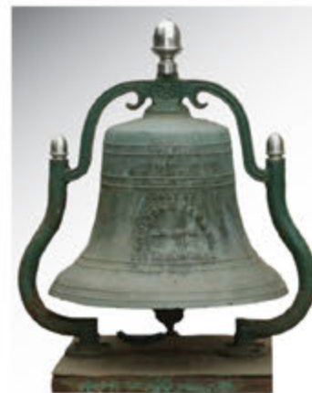
Large Deck Bell from Pittsburgh Riverboat, 19th c.