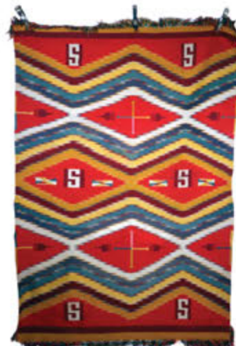
Ca. 1900 Navajo Germantown Rug