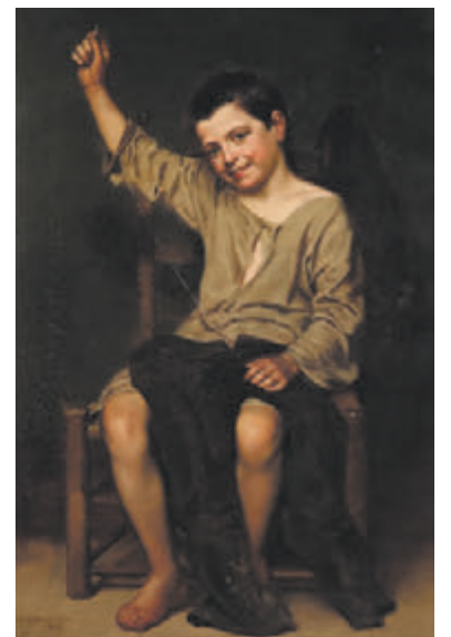
John George Brown