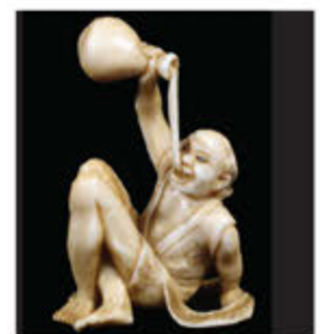
Early Japanese Netsukes, more than 55 lots