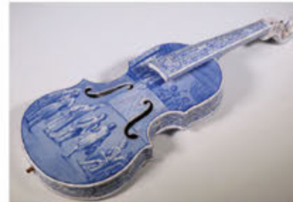
French Faience Violin, 19th c.