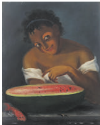
Folk Art Painting, 19th c.