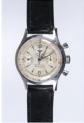
Jewelry & Watches - 106 Lots