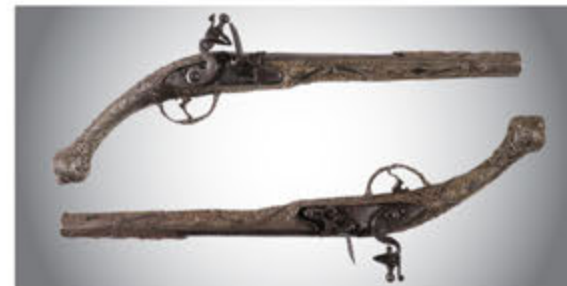
19th c. French Silver-Plated Flintlock Pistols