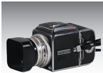
Hasselblad 500CM Camera