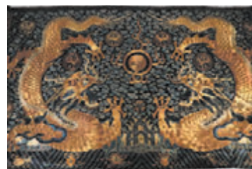
Chinese 19th c. Embroidered Silk Wall Hanging