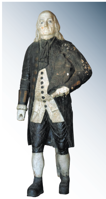
Full-Length Ship's Figurehead from SS Franklin, ca. 1850