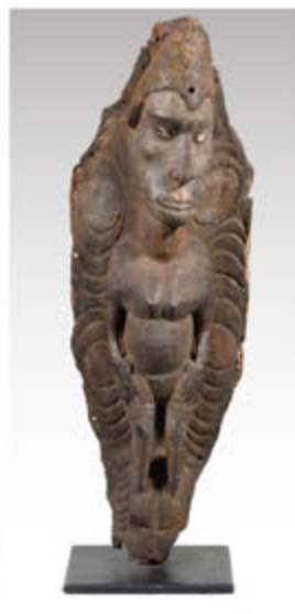
Papua New Guinea Carving, 19th c.