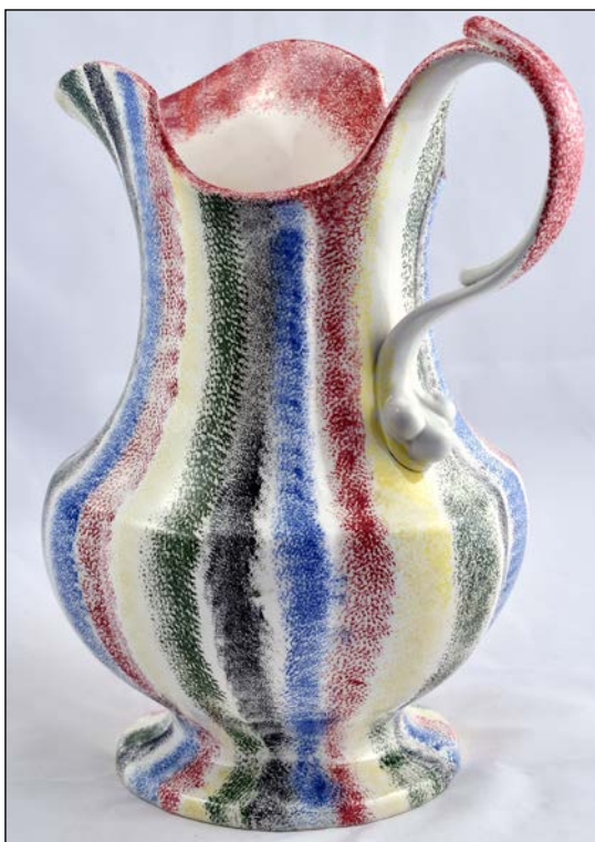
JOHN H. ROGERS ANTIQUES, New London, N.H. — Five-color spatter pitcher, 12½ inches tall.

—Antiques at Stratton Mountain Vermont Antiques Dealers' Show