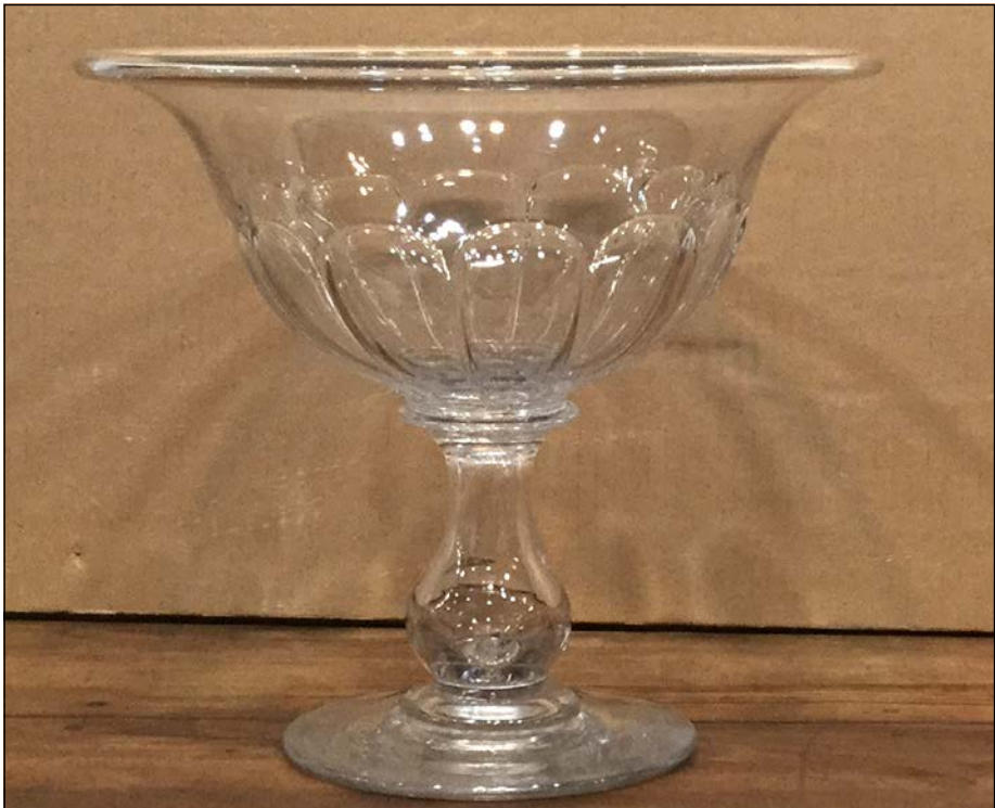
WHITE & WHITE ANTIQUES, Skaneateles, N.Y. — Pittsburgh 12-panel compote, circa 1820-40. —Weston Antiques Show