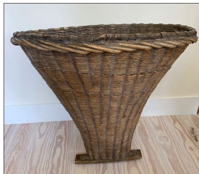
THE RED HORSE, Bridgewater, Vt. — Exceptional vendange basket for grape picking harvest in beautifully aged color and condition, early Twentieth Century. It measures 30 inches wide by 27 inches high by 25 inches deep. —Weston Antiques Show