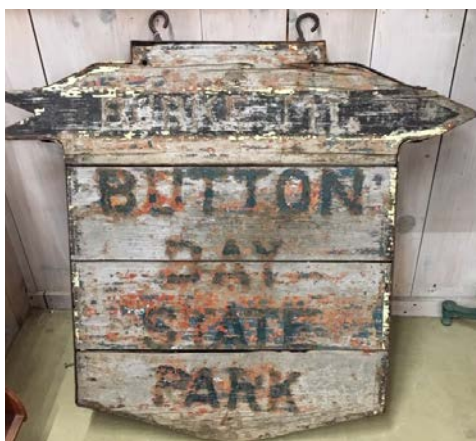
Vermont State Park sign for Button Bay, Lake Champlain, c. 1930. It also has the shadowy remnant of pointer to Burke Mt. in thrifty VT fashion. Painted wood surrounded by wrought iron. 36 inches tall.