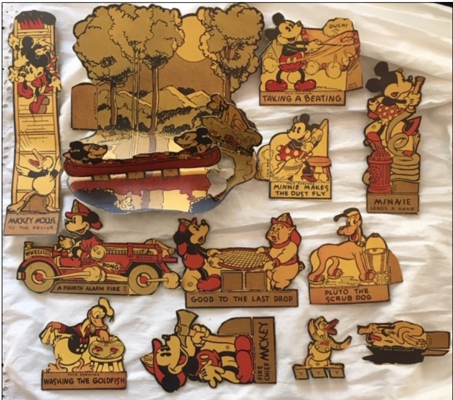
SUSAN GAULT ANTIQUES, Thetford, Vt. — Mickey Mouse box board cut-outs marked “W.D. Ent for Walt Disney Enterprises” are in good condition. —Black River Antique Show

PO Box 49, Bridgewater, Vermont 05034 802-672-3220 www.theredhorseantiques.com