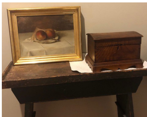
Circa 1870 oil on canvas still life in period gold frame, and small bracket base grain painted dome top chest with Quebec origin.