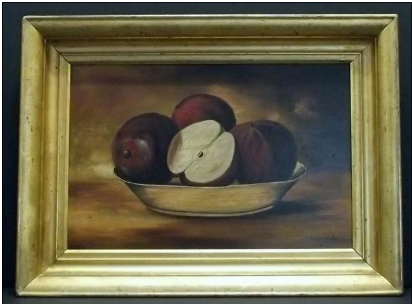
LATCHAM HOUSE ANTIQUES, Waterville, Ohio — Still life of apples in a bowl on a bare wood table, late Nineteenth or early Twentieth Century. Sight size is 9½ by 14-3/8 inches. —Okemo Antiques Show