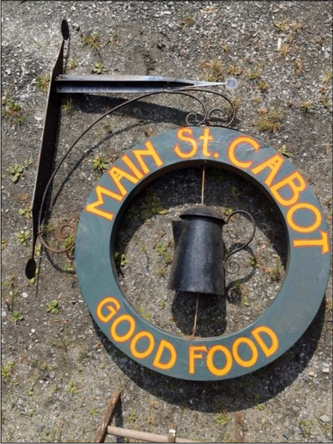
SUSAN GAULT ANTIQUES, Thetford, Vt. — Trade sign for a Cabot, Vt., cafe that was closed in the 1980s. It is 34 inches tall. The coffee pot is three-dimensional, and the bracket is included. —Black River Antique Show