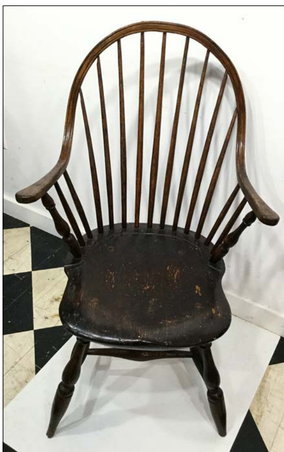
WHITE & WHITE ANTIQUES, Skaneateles, N.Y. — Country continuous arm Windsor, circa 1790. —Weston Antiques Show