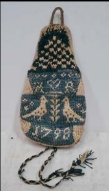
Knit watch pocket holder