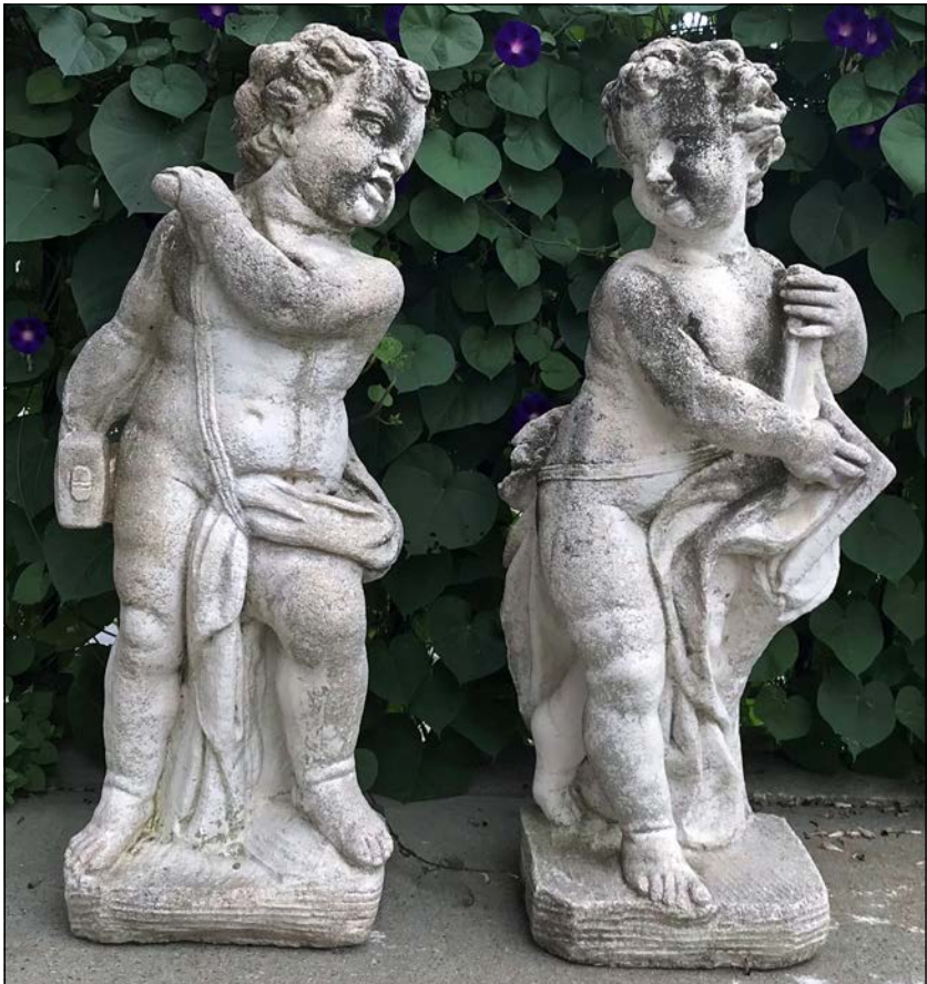
STONE BLOCK ART & ANTIQUES, Vergennes, Vt. — Cast stone measuring 40 inches tall. —Antiques at Stratton Mountain Vermont Antiques Dealers’ Show