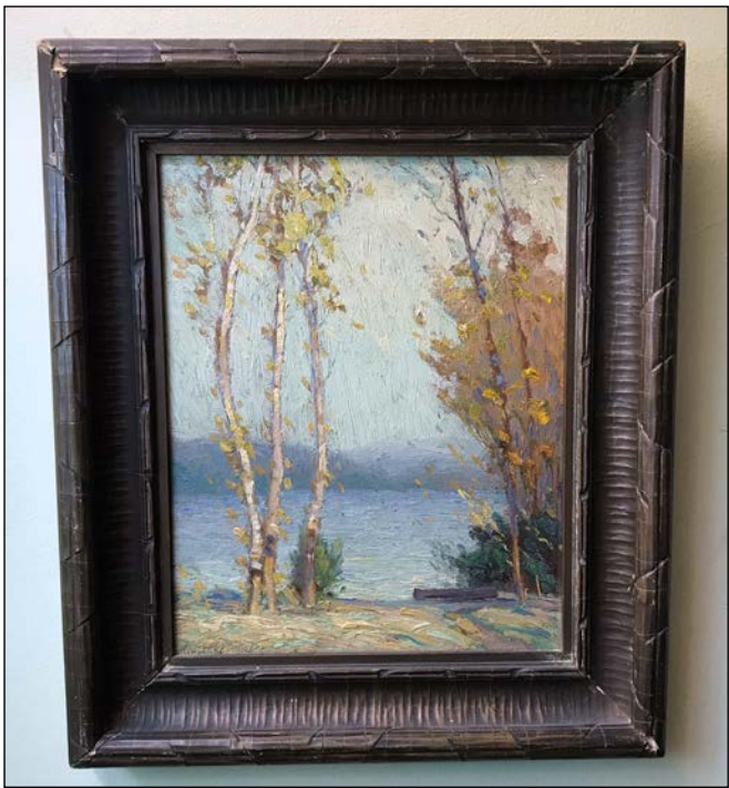
STONE BLOCK ART & ANTIQUES, Vergennes, Vt. — Gustav Wiegand, circa 1915 oil on board, "Birches, Blue Mountain Lake" with a Salmagundi label. —Antiques at Stratton Mountain Vermont Antiques Dealers' Show