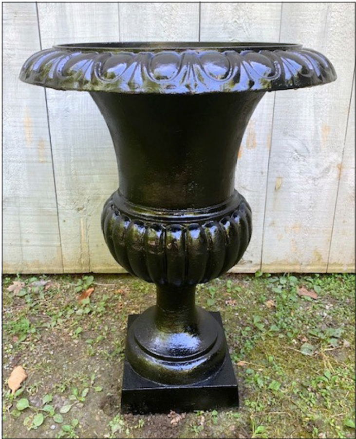
THE RED HORSE, Bridgewater, Vt. — Handsomely proportioned black-painted iron urn with ribbed bowl and thumb-nail edge. It measures 22 inches long by 30 inches high, circa 1930. —Weston Antiques Show