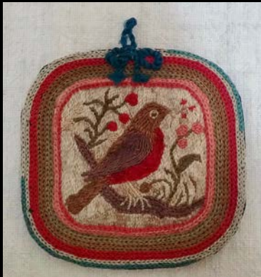
Diminutive embroidered pot holder with Robin c. 1880