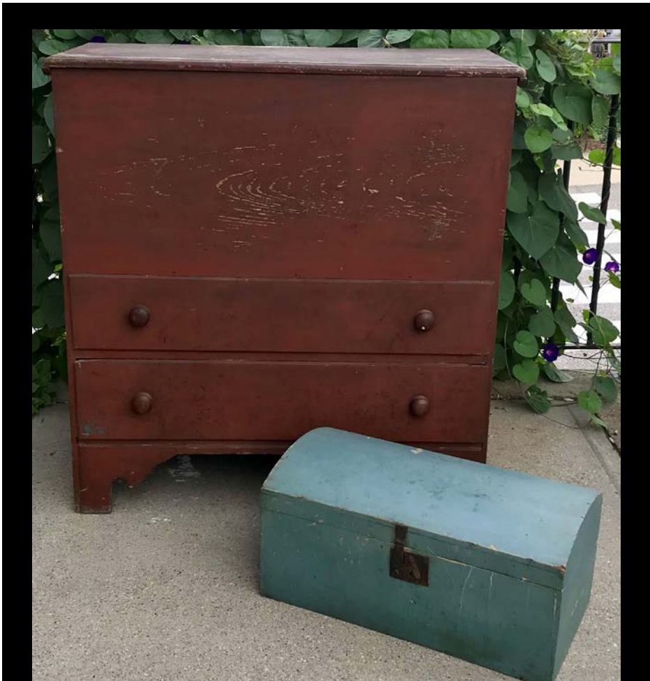
Crusty Red, Robin's Egg Blue