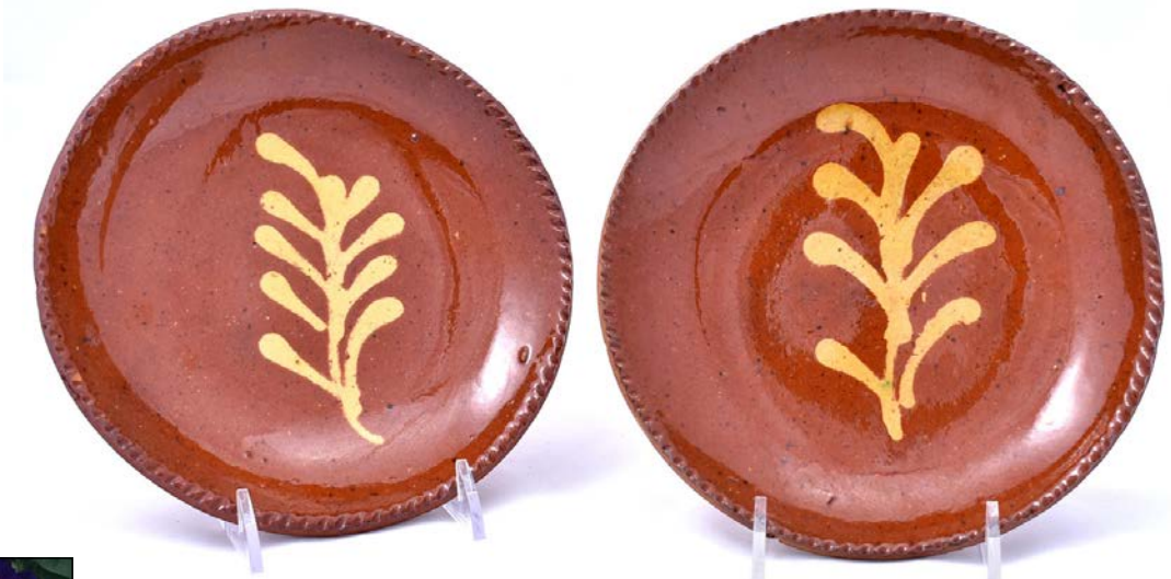
JOHN H. ROGERS ANTIQUES, New London, N.H. — Pair of Nineteenth Century Pennsylvania redware plates measuring 6½ inches in diameter. —Antiques at Stratton Mountain Vermont Antiques Dealers’ Show