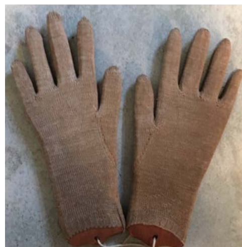
Wooden glove forms wearing hand-crocheted gloves. Very appealing! C. 1900. 11.5 inches tall.

Thos. Bartlett Antiques, Chichester, NH Stone House Antique Center, Chester, VT