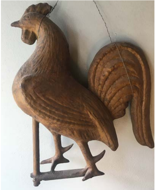
19th c. Rooster weathervane in original “as found” condition.

Exhibiting at the Antiques at Stratton Mountain Vermont Antiques Dealer’s Show