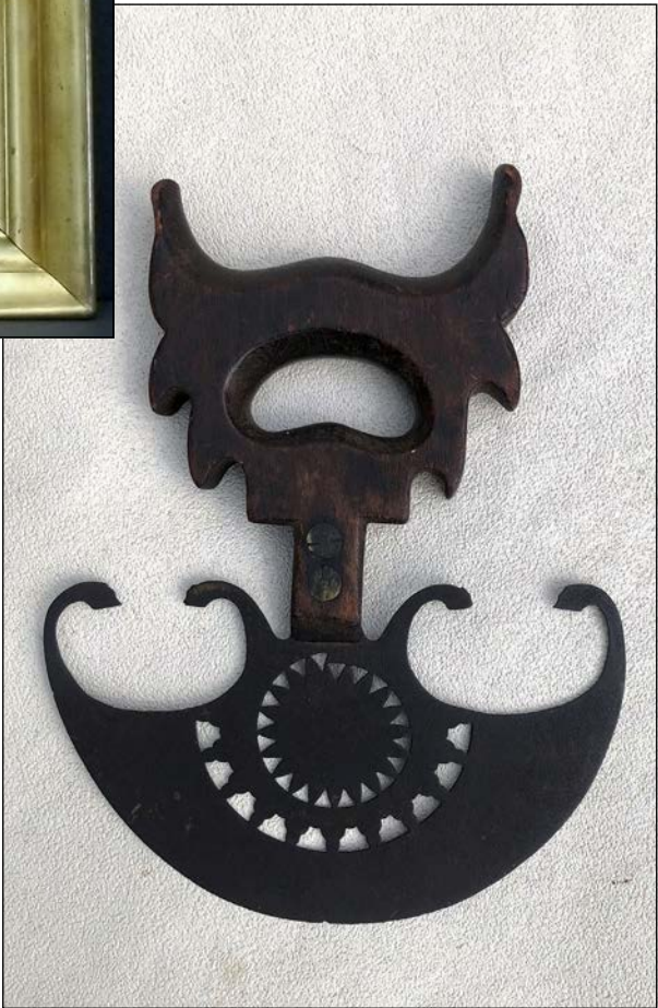
STEPHEN-DOUGLAS ANTIQUES, Walpole, N.H. and Rockingham, Vt. — Extraordinary iron and wood food chopper from the early Nineteenth Century. —Antiques in Vermont