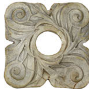
Louis Sullivan (and Adler) plaster architectural element executed for the interior of The Auditorium Building Chicago II. (one of two to be offered)