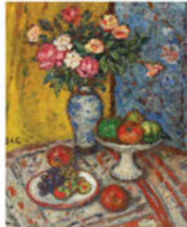
Georges d'Espagnat (French, 1870-1950), Still Life with Fruit and Tapestries, oil on canvas, 32" x 25.75"