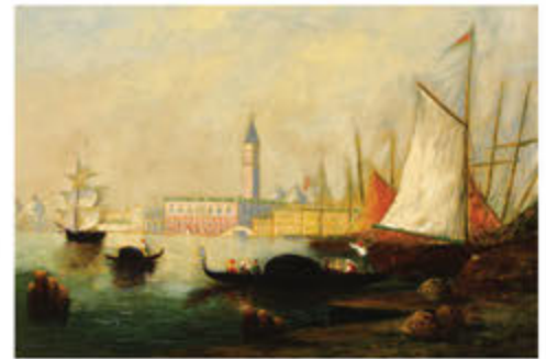
Félix Ziem (French, 1821-1911), View of Venice, 1900, oil on canvas, 11.5" h x 17.25"