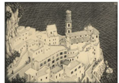
M.C. Escher (Dutch, 1898-1972), Atrani, Coast of Amalfi, 1931, lithograph, 10.75" x 15"