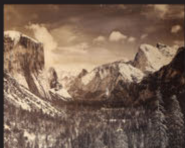
Ansel Adams (American, 1902-1984), "Yosemite Valley from Inspiration Point, Winter, Yosemite National Park," c. 1940, sepia toned gelatin silver print mural mounted to Homosote board, printed 1950s by Gabriel Moulin Studios (San Francisco, CA), 95" x 119" (1 of 100+)