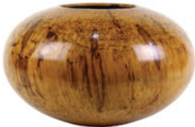
Philip Moulthrop (American 1947-) spalted red maple turned vessel