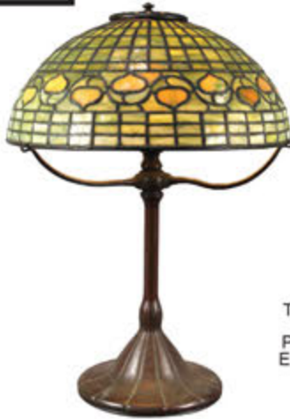
Tiffany Studios, New York, patinated bronze and leaded glass table lamp, with a Leaf and Vine pattern shade