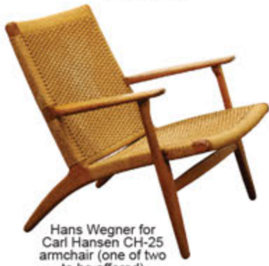
Hans Wegner for Carl Hansen CH-25 armchair (one of two to be offered)