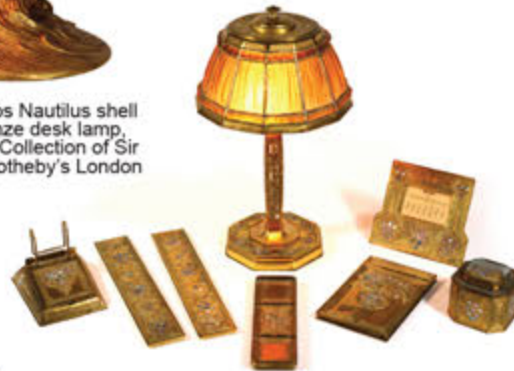
Tiffany Studios Abalone desk set including a linen fold lamp