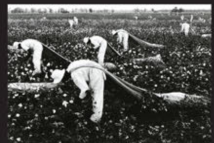
Danny Lyon (American, b. 1941), "The Cotton Pickers," 1968, gelatin silver print, 9" x 13.5" (1 of 6)