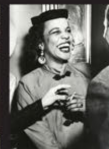
Weegee (American, 1899-1968), "Harlem" (Black woman w/ cigarette), circa 1945, gelatin silver vintage print, 13.75" x 10.5" (1 of 2)