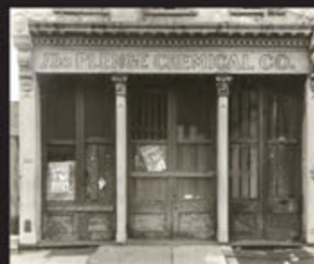
Walker Evans (American, 1903-1975), "Store front, Charleston, South Carolina, March 1936," 1936, gelatin silver print, 8" x 10" (1 of 2)