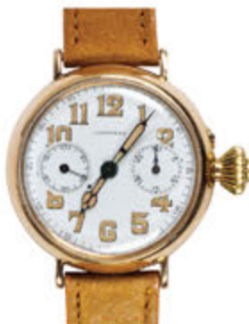
Rare Longines 14K Yellow Gold Monopusher Wrist-Chronograph, Circa 1919