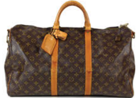
Large selection of luxury items including Louis Vuitton hand bags and shoulder bags