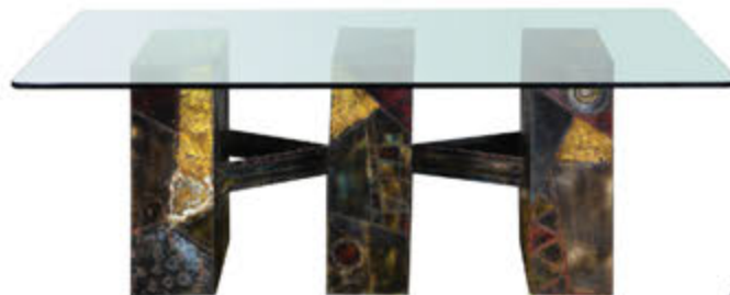
Paul Evans for Directional dining table, circa 1970