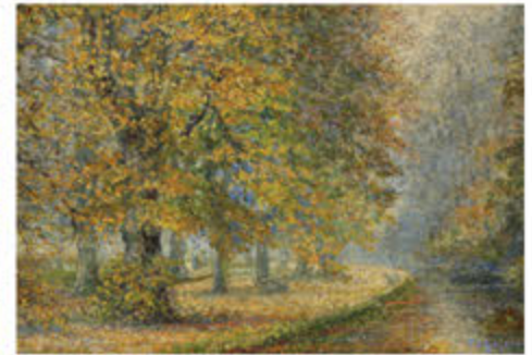
Theodore Clement Steele (American, 1847-1926), Untitled (Autumn Woods by a River), oil on board, 12" x 18"