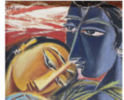
George Keyt (Sri Lankan, 1901-1993), Untitled (Two Figures), 1965, acrylic on board, 12.5" x 14.5"