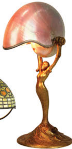
Tiffany Studios Nautilus shell and gilt bronze desk lamp, Provenance: Collection of Sir Elton John, Sotheby's London