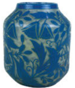
Daum Nancy rare Art Deco cameo "Bellflower" vase circa 1925