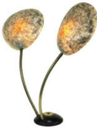
Greta Grossman Cobra table lamp, circa 1950