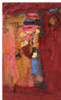
Jay DeFeo (American, 1929-1989), "Painting with Eggshell," 1959, oil with found materials (eggshells) on canvas, 27.5" x 17.5"