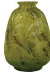
Emile Gallé Marine wheel cut and fire polished vase circa 1900