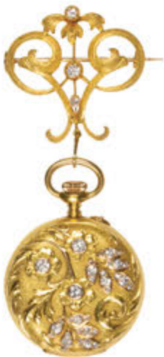
Art Nouveau Ulysse Nardin Diamond, 18K Yellow Gold Pendant-Watch and Chatelaine