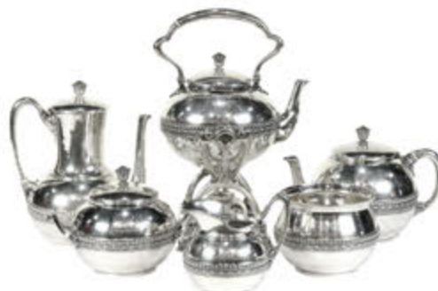
Tiffany & Co. sterling silver tea and coffee service