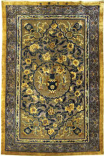
Antique Chinese silk and gilt metal thread carpet, possibly Imperial, late 18th/19th century