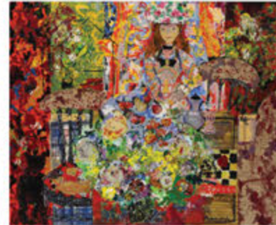
Emilio Grau Sala (Spanish, 1911-1975), Untitled (Jeune femme a l'interieur), oil and collage on canvas, 32" x 39.5"