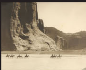
Edward Sheriff Curtis (American, 1868-1952), "Canyon de Chelly," 1904 (later printing), gelatin silver print, signed lower right, 10.75" x 13.5"