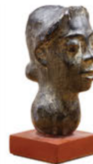
Sargent Johnson (American, 1888-1967), Bust of a Woman, circa 1938, glazed terracotta sculpture, 3" h