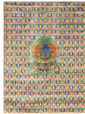
Himalayan painted thangka, Blue Tara, 35" h x 26.25" w