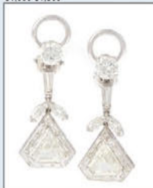
A pair of diamond and platinum earrings $2,000-$3,000