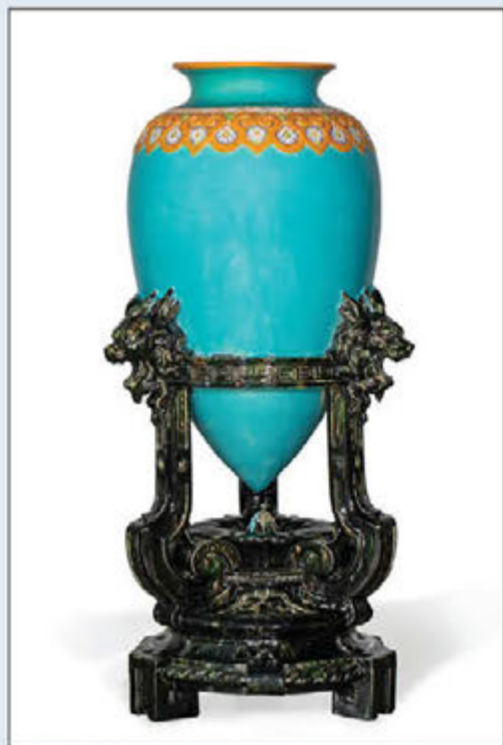
A Mintons majolica turquoise ground 'Chinese' vase $2,000-$3,000

Design for the Home and Garden Saturday, May 18 & Sunday, May 19 10:30AM PST