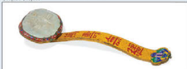
A Chinese carved jade mounted cloisonné enamel ruyi scepter $1,000-$1,500