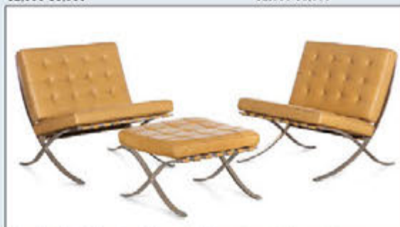
A Ludwig Mies Van Der Rohe pair of Barcelona chairs and ottoman $1,500-$2,000