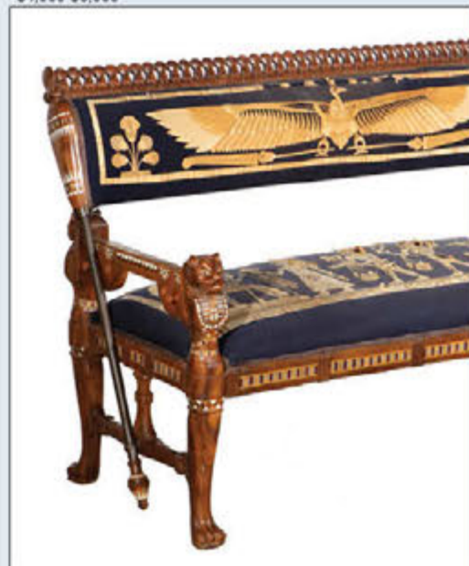
An Egyptian Revival mother of pearl inlaid settee, possibly Cairo $6,000-$8,000