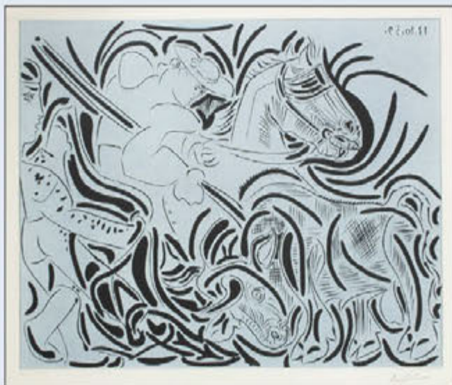
Pablo Picasso (Spanish, 1881-1973), Pique III (B. 920; Ba. 1243), 1959 $25,000-$35,000