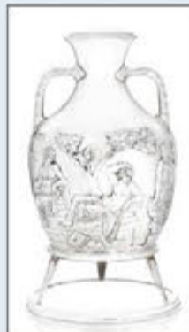
Silver model of Portland vase $2,000-$3,000