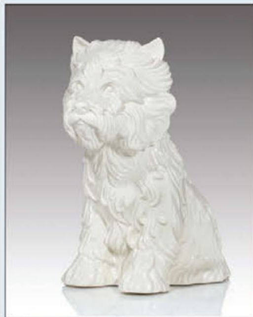
Jeff Koons (American, b. 1955), Puppy, 1990 $4,000-$6,000