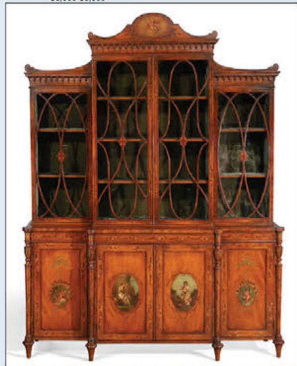
A Sheraton Revival paint decorated satinwood breakfront bookcase $5,000-$7,000