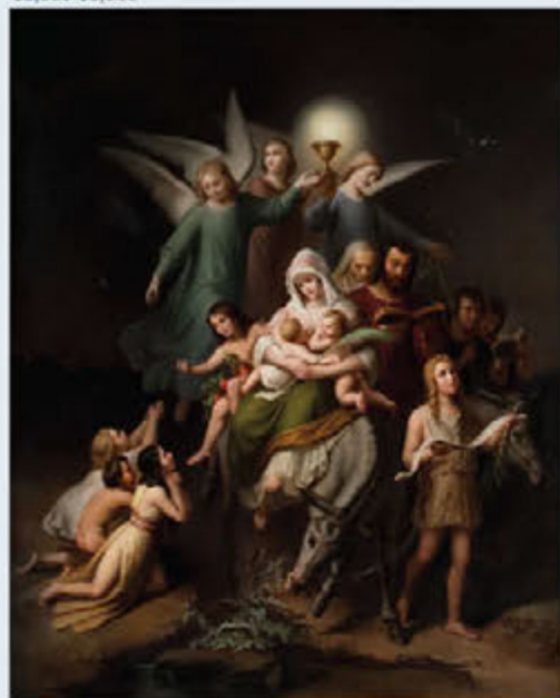
A large Berlin (K.P.M.) porcelain plaque: The Holy Family $10,000-$15,000