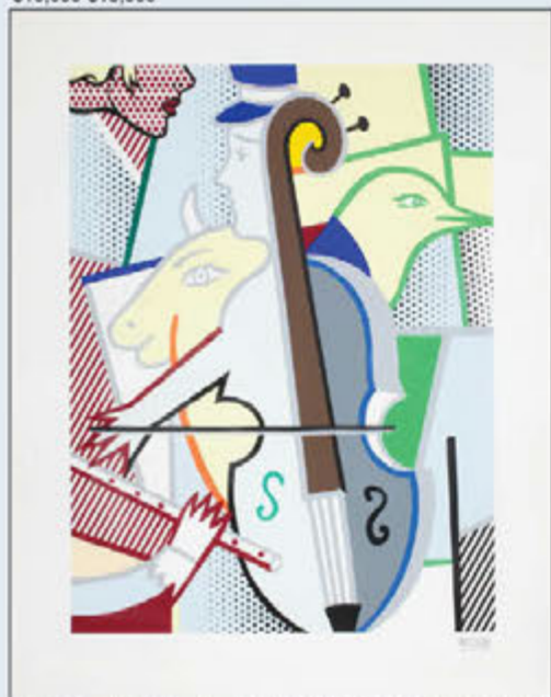
Roy Lichtenstein (American, 1923-1997), Cubist Cello (C. 311), 1997 $10,000-$15,000