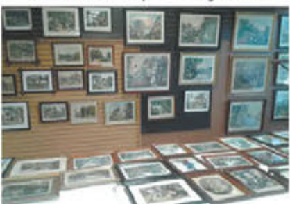
Rare collection of 70+ 1855-70 Currier & Ives prints from a lady who lovingly collected them for over 60+ years