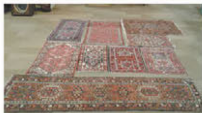
Part of the 19 th Century Oriental Rug Collection