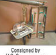
Consigned by U.S. Congressman