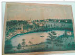
Phoebe Tallcot painted the folk-art painting of Skaneateles in 1835-6 in such detail + folk art beauty not seen in any painting we have seen of the Village.

Gerald Petro Auctioneer and Appraiser | Est. 1971 Office: 315 668-2346 | cell: 315 561-9777 | cell: 315 591-1784 iroquoisauction@gmail.com