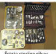
Estate sterling silver collection