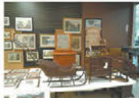
Part of the 19 th Century Child's Furniture Collection