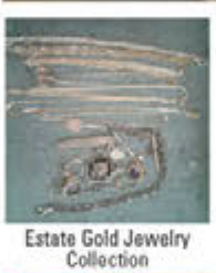
Estate Gold Jewelry Collection