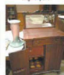
#27 1890s American Carved Mahogany Claw Foot Bar with Beveled Mirror