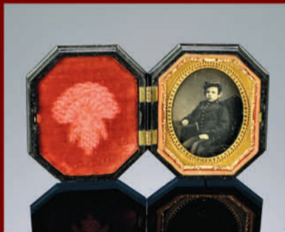
Previously un-cataloged image of Tad Lincoln in uniform