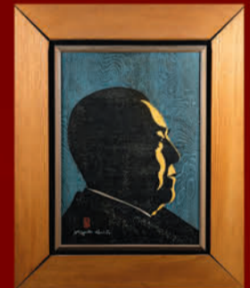
Kiyoshi Saito Woodblock Feb. 1967 Time Mag cover