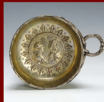
1779 Sterling Silver Tastevin with Louis XIV Medal