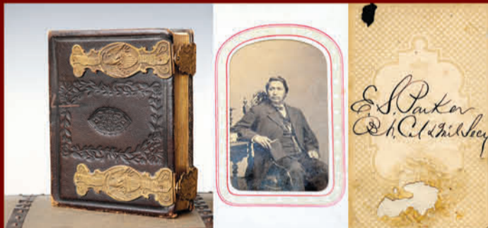
Autographed Civil War CDV album

JMW Turner Watercolor "Bonneville in Savoy" with provenance