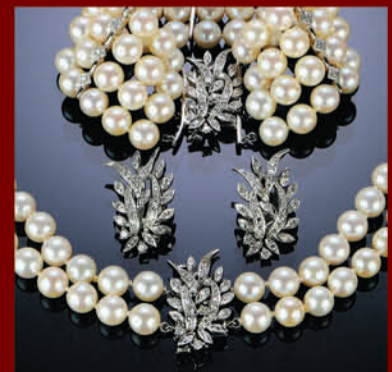
Four Piece Pearl, Diamond and 14K Gold Set