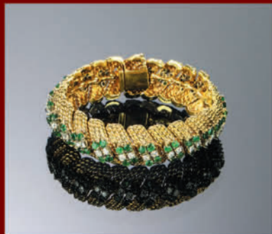
18K Gold emerald and diamond bracelet