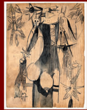
Wifredo Lam Archive