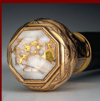
Presentation cane with 14k Gold and Quartz