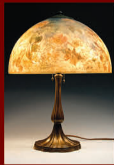
Handel lamp w/ painted glass shade