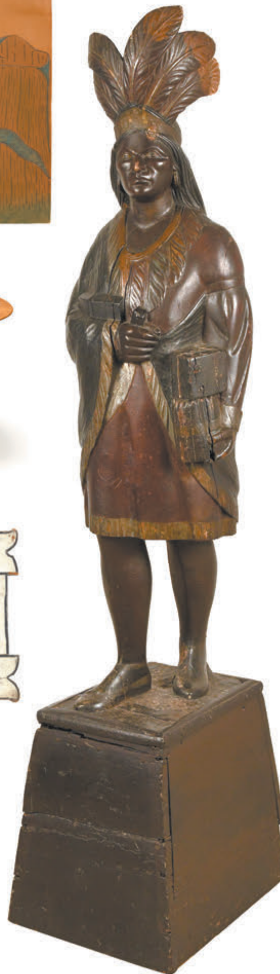
Robb Cigar Store Indian