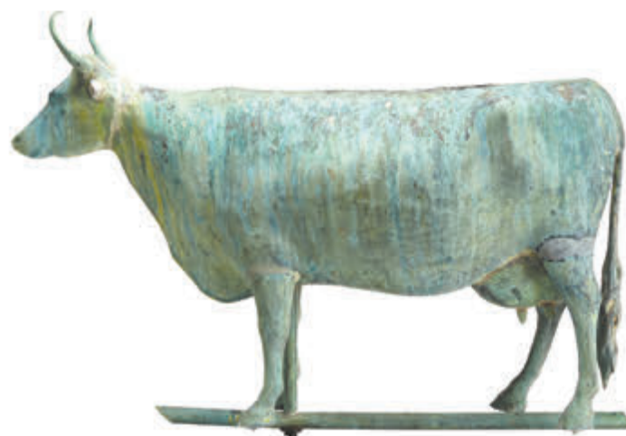
Cow Weathervane signed Harris

Preview Dates & Times: Saturday, March 16, 10am - 5pm EST, Sunday, March 17, 9am - 12pm EST, or by appointment