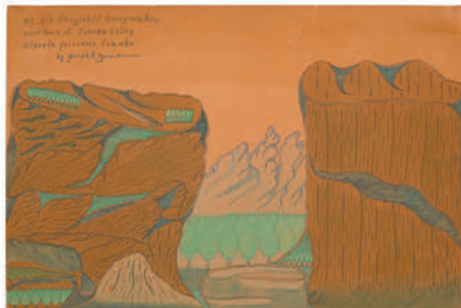
Joseph Yoakum Two original works in this sale