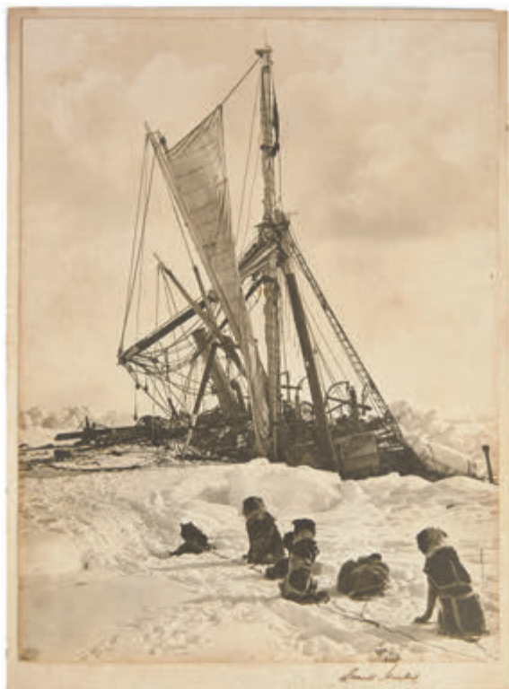
Original Frank Hurley Shackleton Photograph Three Hurley Shackleton Photos in this sale