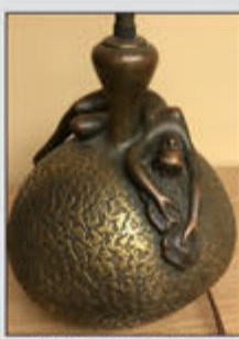
11" bronze nude lamp base