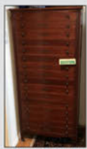
Unusual 16 draw mahogany type chest