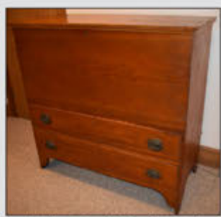
Antique country furniture and accessories