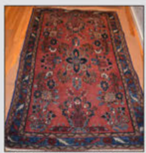
Session 1 Curiosities Auction at 3:30 - Oriental rugs, lithographs, and interesting smalls.