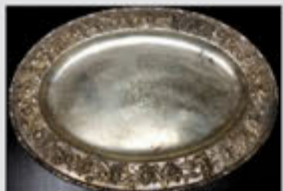
21" sterling repousse oval platter S. Kirk and Sons