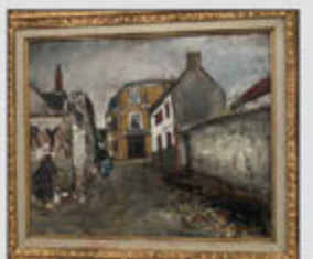
Oil on canvas - Francois Gall