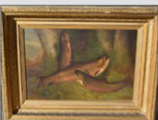
S.W. Griggs oil on canvas portrait of 3 trout with reel 1874 (23x35)