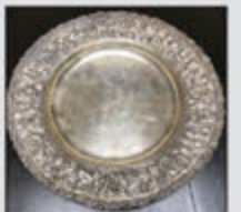
14" sterling repousse charger S. Kirk and Sons