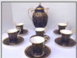
Minton cobalt and gold tea set