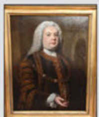
One of several antique portraits