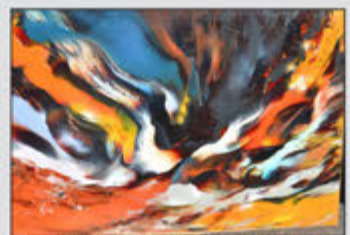
49"x73" abstract on canvas "Genesis" by Leonardo Nierman and a smaller Nierman