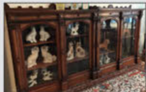
Pair of Victorian bookcases

To begin the New Year, Coyle's Auction will present a Two Session Antique and Estates Auction at the VFW Hall in Medway, MA. The January auction will feature a diverse offering of a large number of fine, fresh to the market paintings and art from a Massachusetts collection, the final installation of Mid-Century and late 19th C prints from the DeCordova Sculpture Park and Museum in Lincoln, MA as well as a fine selection of antique American, English and French style furniture, fine porcelain and glass, orientalia, fine artwork, silver, pottery, crystal, country and primitives and much more drawn from contents of downtown Boston apartment, Cambridge, W. Newton, Walpole, Wellesley Hills and others. The January Auction will feature hundreds of fresh to the market offerings, items arrive daily. Please visit our website at www.coylesauction.com for additional photos and information.