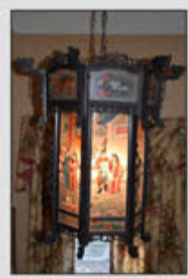
Unusual Asian panel hanging fixture