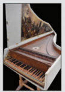
Assembled harpsichord with painted scenes (decorative use)

Session 1 at 3:30 PM: Curiosities, art, and Rugs Auction: 12+ oriental rugs incl oversize room size oriental rug, vintage linens, a number of fine modern lithographs, intaglios etc some from the DeCordova Museum and a Massachusetts collection, sm group of museum posters from the K. Wheeler collection of Chestnut Hill, Test flight suits and leather bomber jacket, early wooden propeller, and other interesting items.