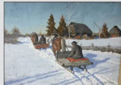
Oil on paper winter scene