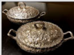
2 sterling repousse covered vegetable dishes