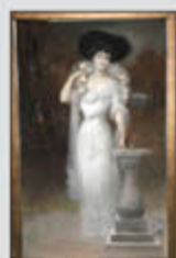
Pastel of lady, J. Wells Champney