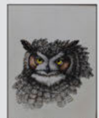
One of five owl watercolor illustrations, Karl Karalus "Owls of N. America" illustrator