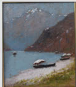
Small landscape oil ptg Edward Gay