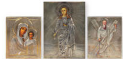
Selection of Russian icons