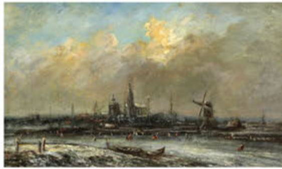
Johan Barthold Jongkind (Dutch, 1819-1891), Skaters Outside Overschie, Holland, oil on canvas, 14.75" x 21.5"