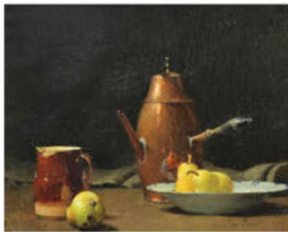
Emil Carlsen (American/Danish, 1853-1932), Still Life with Pot, Pitcher and Pears, 1903, oil on board, 16" x 20"