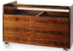
Norwegian Modern magazine rack, by Bruksbo, Bagn Mobelindustri