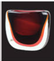
Murano glass vase