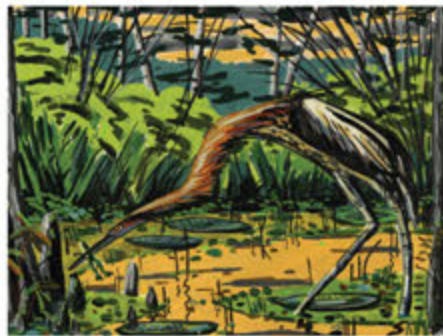
David Bates (American, b 1952), "Green Heron," 1989, gouache on paper, 8.5" x 12"