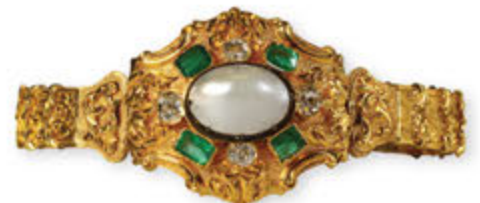
Victorian Natural Blister Pearl, Emerald, Diamond, Silver and 18K Yellow Gold Bracelet