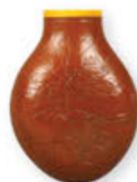
Collection of Chinese snuff bottles