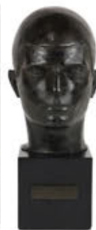
Maurice Sterne (American, 1878-1957), "Head of a Bomb Thrower," composite sculpture, 18" h