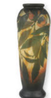
French Daum Nancy cameo glass vase circa 1900