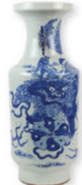
Chinese underglaze blue porcelain vase with fu-lions