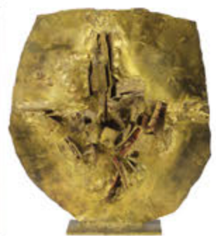
Bernard "Tony" Rosenthal (American, 1914-2009), Brutalist Form, circa 1960, welded brass, 16.75" h