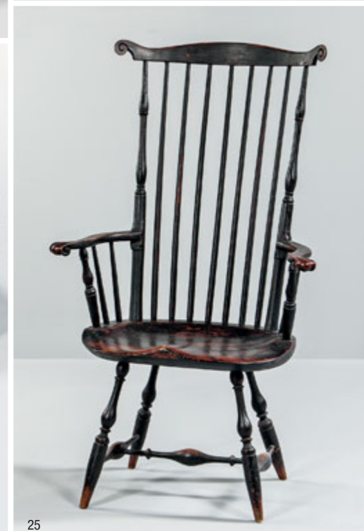
13 Molded Sheet Copper Eagle Weathervane, possibly A.L. Jewell, Waltham, Massachusetts, early 1850s 14 Fine Polychrome Double-sided Parcheesi/Checkers Board, America, 19th century 15 Abigail Scott Duniway Oregon Equal Suffrage Association Silk Banner, Portland, 1912 16 Yarn-sewn Tiger Rug, 19th century 17 Carved Handled Burl Bowl, America, late 18th/early 19th century 18 Group of Smalls 19 Rare Early Red-painted Pine Hanging Cupboard with Glazed Watch Window and Silver Pocket Watch, 18th century 20 Painted Wood and Sheet Iron "Inn" Sign with Sailboat, America, early 20th century 21 Slip-decorated Pearlware Pitcher and Bowl Set, England, c. 1830 22 Polychrome Carved Shadow Box Diorama of the Lilian, America, late 19th century 23 Pieced and Appliqued Quadruple Pinwheel Quilt in Green and Red, late 19th century 24 Red-brown and Polychrome Decorated Pine Lift-top Box, New England or New York, c. 1830 25 Black-painted Windsor Fan-back Armchair, Nantucket, late 18th century

For buyers, consignors, and the passionately curious FIND WORTH AT SKINNERINC.COM