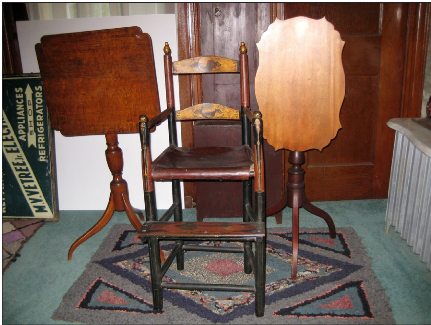
ROBERT MARKOWITZ, Groveland, Mass. — Tilt top of which the single maple board top displays a mixture of bird's-eye and tiger graining with "whale's tails" corner notching, plus a New Hampshire tilt top with a wonderfully shaped top and an early child's chair with Nineteenth Century pinstriping and vignettes in decorative lozenges on the slats. This is just a sampling of the furniture in the booth.