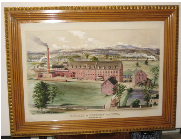
Large detailed and colorful 19th century watercolor bird's eye view of Kimball and Gerrish's Factory in Manchester, NH by the well documented itinerant artist J.H. Rollin Caughey.