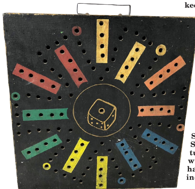
SOUTH ROAD ART & ANTIQUES , Stanfordville, N.Y. — Twentieth Century Canadian folk art game board with dice, painted wood and a metal handle, measuring 16½ by 18 by 2 inches.