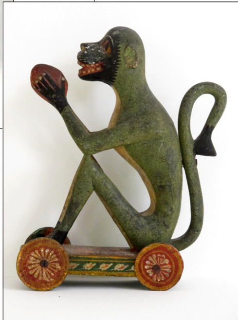
DAVID THOMPSON ANTIQUES & ART, South Dennis, Mass. — Nineteenth Century carved and polychromed wood circus monkey pull toy 8½ by 6¾ by 2½ inches. This is from an old New Hampshire collection. An example by the same hand is in the collection of the Shelburne Museum in Vermont.