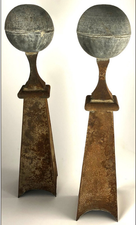
SOUTH ROAD ART & ANTIQUES, Stanfordville, N.Y. — Pair of late Nineteenth Century French architectural finials, zinc, measuring 21 inches high by 4 1/2 inches long.