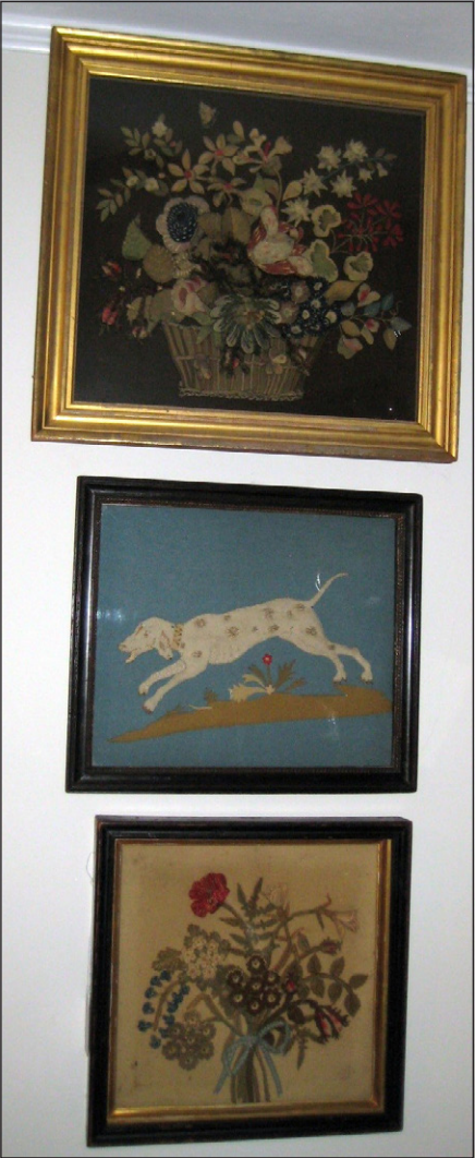
ROBERT MARKOWITZ, Groveland, Mass. — A portion of a collection of Eighteenth and Nineteenth Century cut felt work pictures. Sorry that the picture is a bit dark. The dog one is signed in stitching “AW” on the collar. Still trying to decide which to bring but these will most likely be among them.