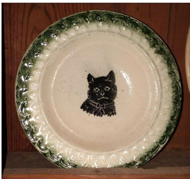
VEE KAUSEL, Harwinton, Conn. — Stick sponge bowl with cat measuring 6¾ inches in diameter.