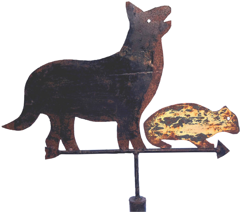
Antique Sheepdog and Lamb Weathervane Painted iron, mounted on base, 38” h x 25” w, early 20th century

By appointment Susan Wechsler | 917 903 8077 233 South Road, Stanfordville, NY 12581 www.southroadantiques.com | southroadantiques@me.com