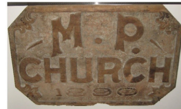
ROBERT MARKOWITZ, Groveland, Mass. — From a grouping of the trade signs and advertising at the show is a pharmacist's sign which is part of an architectural piece of graceful wrought iron curves in old paint. The other is hand carved from a single heavy slab of maple with traces of white smalt. It was probably meant to resemble marble. Note the yard stick.