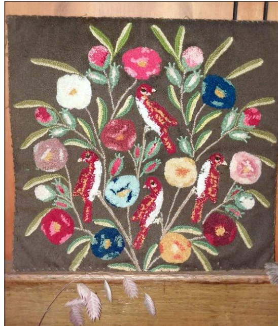
VEE KAUSEL , Harwinton, Conn. — Stump-work flowers and birds, measuring 10½ by 11 inches.