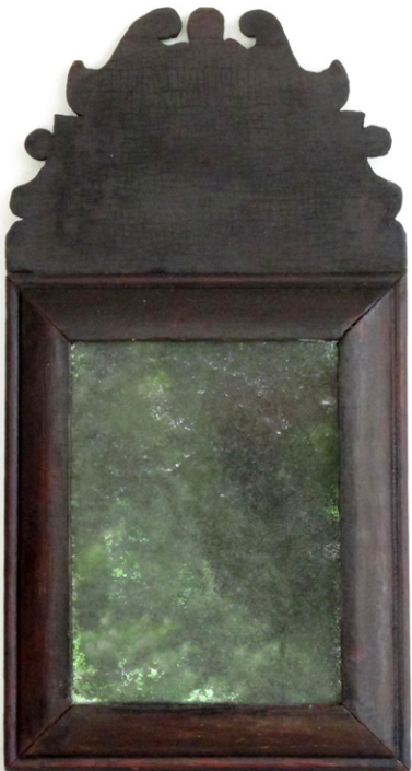
DAVID THOMPSON ANTIQUES & ART, South Dennis, Mass. — Buffington family looking glass, American, 1750-75, with removable crest, 16½ by 8¾ inches. It is made of Eastern white pine with heavy craquelure, original glass. Both parts are each labeled in ink in an early hand on paper “... Buffington, Chestnut St.” There were members of the Buffington family living in several locations in Eastern Massachusetts. From an old New Hampshire collection.