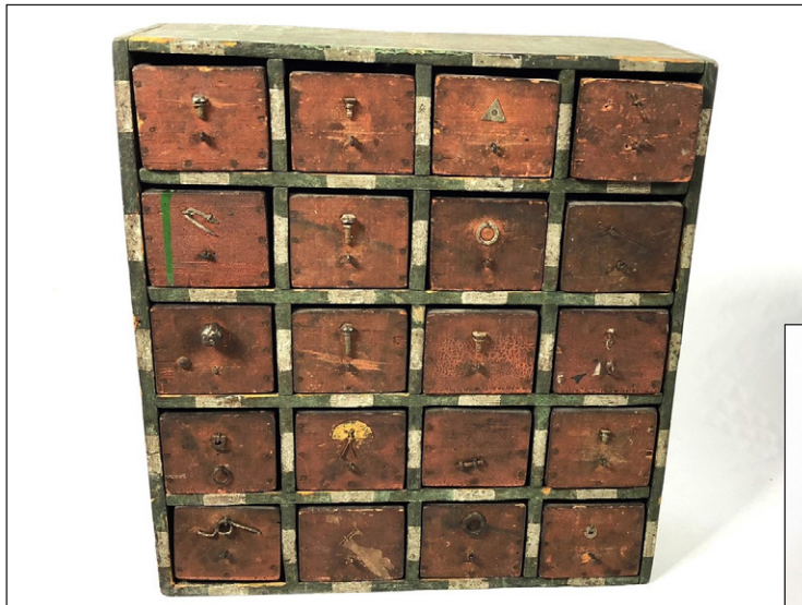
SOUTH ROAD ART & ANTIQUES, Stanfordville, N.Y. — Twentieth Century American folky hardware bin with painted wood and metal parts, 15-inch square.