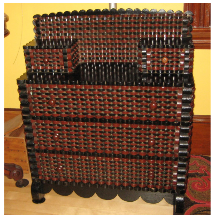
Child's size folk art dresser in original paint. Signed and dated.