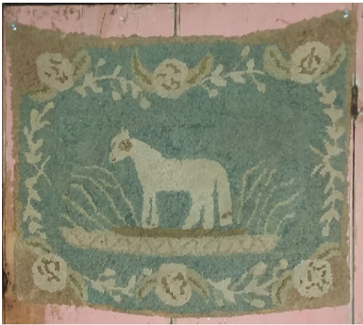
Hooked horse rug 24.5" x 21"