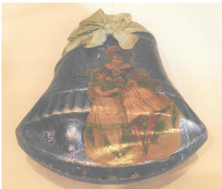
A Victorian bell shaped Christmas candy box meant to be hung on a Christmas tree.