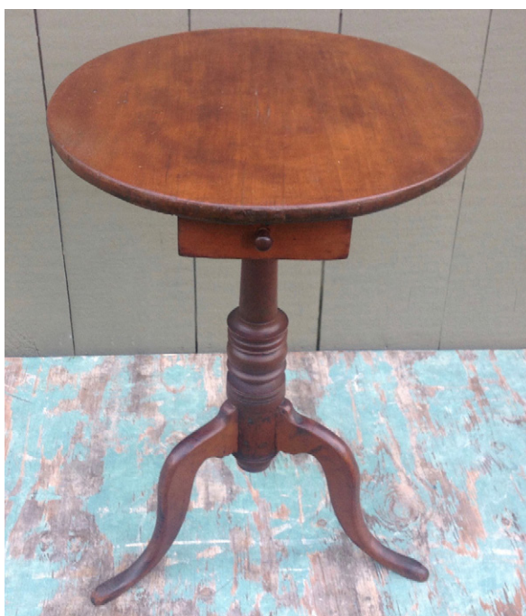
18th Century Tripod Stand with Pass Through Drawer

www.hlantiques.com hlantiques@icloud.com Telephone: (732)-951-2288 Cell: 732-690-2116