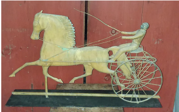
Full bodied horse and sulky 32" c. 1880, probably Harris & Company

Showing at Americana Celebration August 7th, 2018