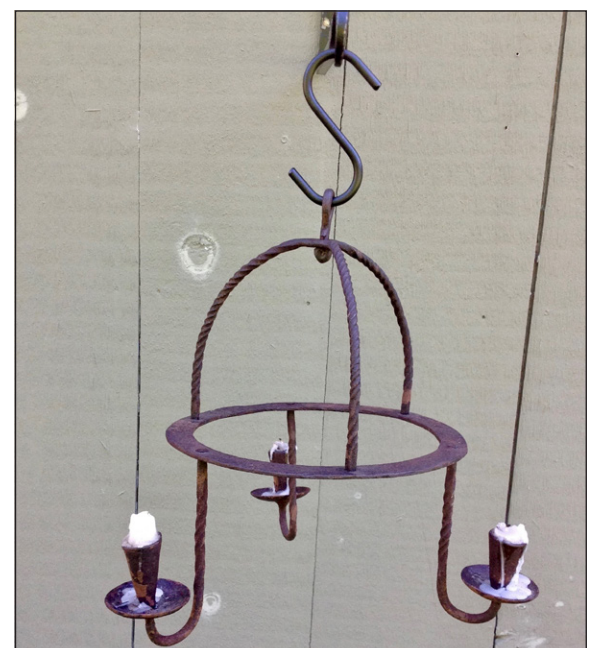
H&L ANTIQUES, Princeton, N.J. — Three-arm chandelier wrought iron chandelier 1790-1810.