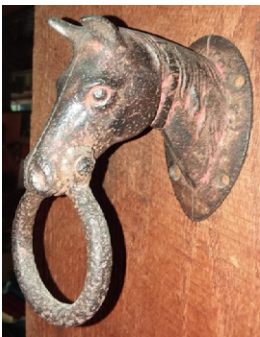
Cast iron Horse Head Hitch Traces of old red paint