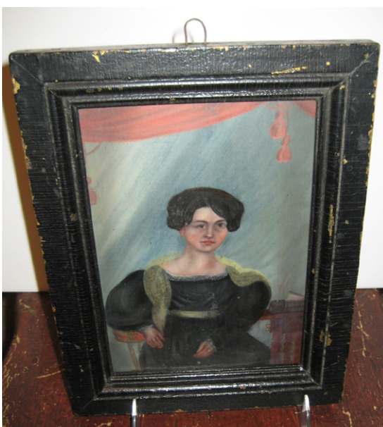
MINIATURE oil on board folk art portrait of woman seated in a decorated "fancy chair" at a work stand with inkwell, quill and books. Found in VT.

Clocks, furniture, advertising, trade signs, folk art, anything atypical and unusual rmarkowitz1@comcast.net