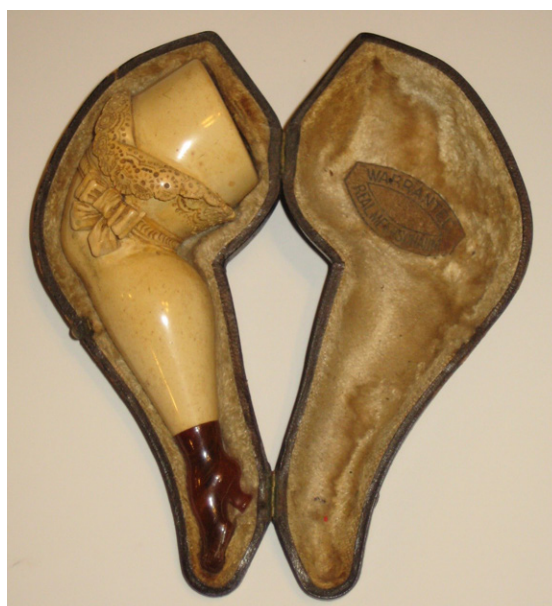
Meerschaum pipe carved in the form of a woman's leg - the ultimate Victorian male fetish object? With original case.