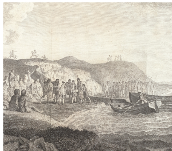
Complete Set of the Voyages of Capt. Cook , with Atlas