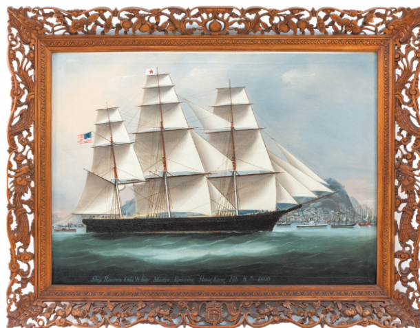
Magnificent China Trade Ship Portrait