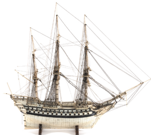
Napoleonic Prisoner-of-War Bone Model of a 72-Gun Ship