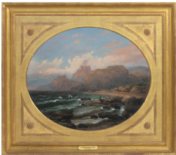
"A Treacherous Cove" by Thomas Birch, circa 1830