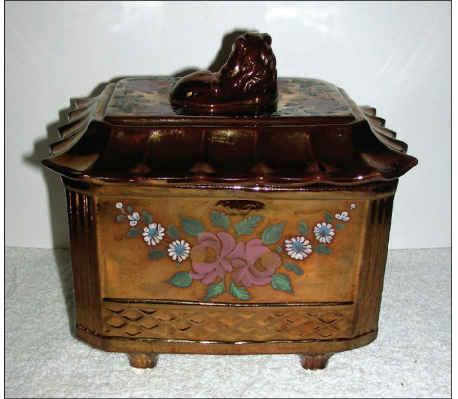
WEST PELHAM ANTIQUES, Pelham, Mass. — Unusual English copper lustre double-chambered tea canister with lion finial and overglaze floral decoration, circa 1830, 6½ inches by 5 inches by 6¾ inches.