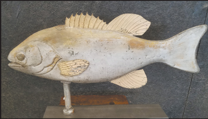
Fish Weathervane - in original surface c. 1920 36" L x 20" H

At Home Antiques Kingston NY 917 402 1778 • 845 331 3902 milneinc@aol.com