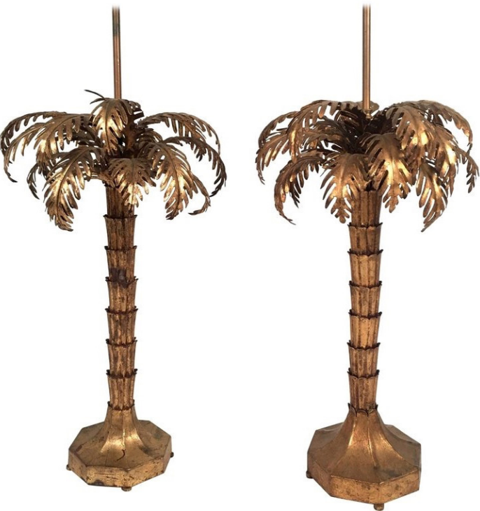
ANDREW SPINDLER ANTIQUES & DESIGN, Essex, Mass. — A stylish matched pair of Italian gilt-metal palm tree-form lamps; the palm fronds arching over a tapering fluted and segmented trunk on sloped hexagonal base, raised on small ball feet. The pair dates circa 1940s and measure 39 inches high.