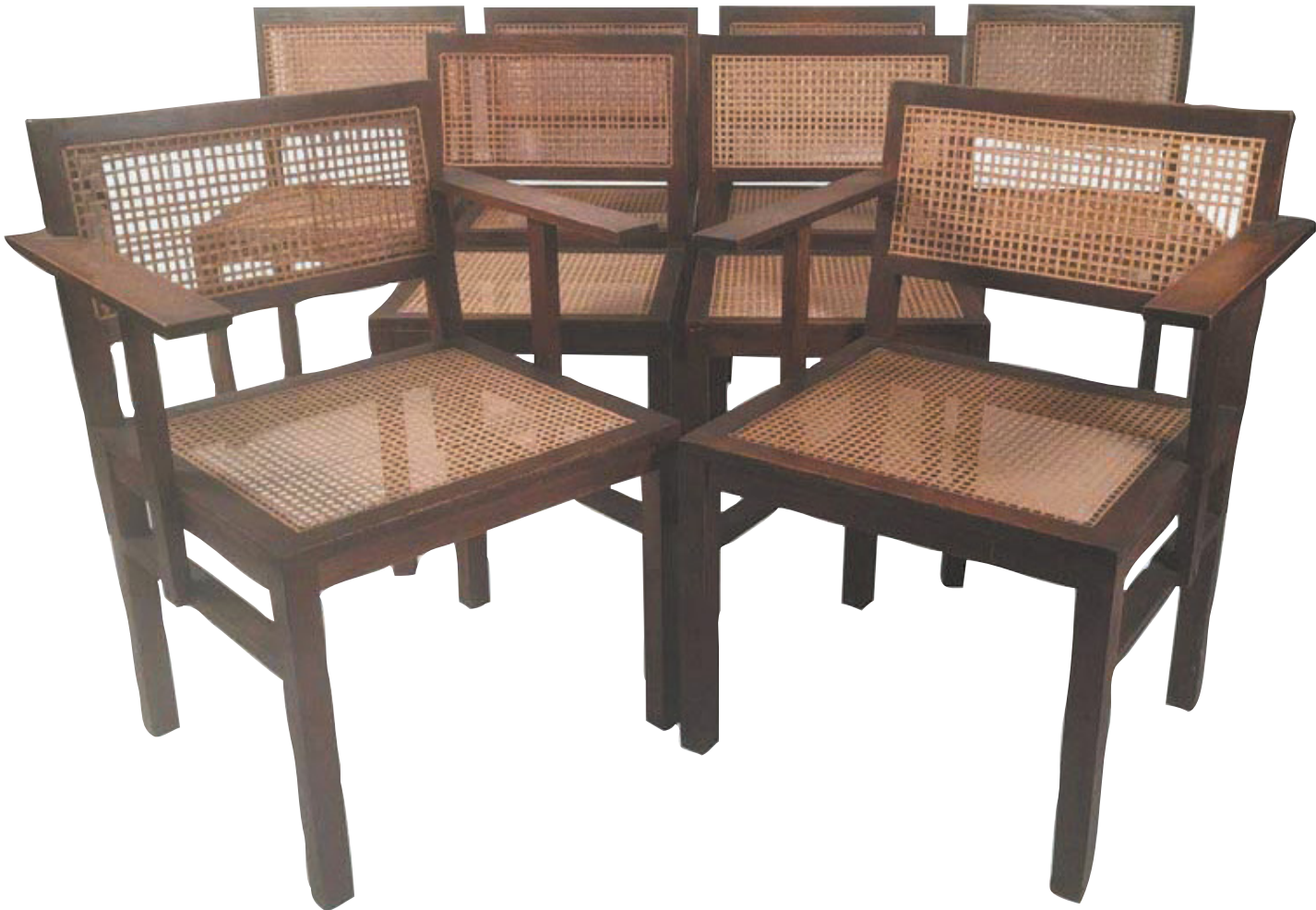
A SET OF 8 BAUHAUS PERIOD DINING CHAIRS IN OAK WITH RECTANGULAR CANED BACKS AND SEATS, COMPRISING 2 ARM CHAIRS AND 6 SIDE CHAIRS, GERMAN, CIRCA 1920s.