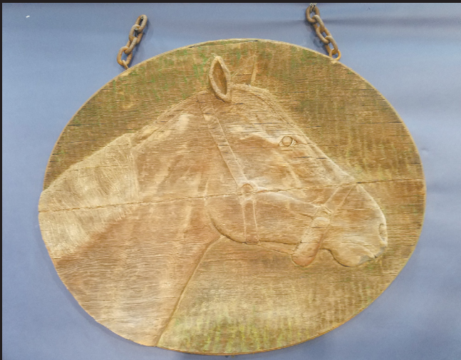
Late 19th c. Carved Horse Trade Sign from a NY State horse farm, 34" H x 42" L