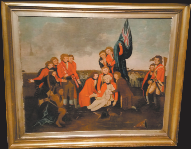
Folk art copy of a well-known painting done by Benamine West, 1770 depicting the fatal wounding of General James Wolf during the battle of Quebec between the French and the English. The war began on September 13, 1759. The outcome of the seven year's war was the ousting of France in the colonies and the supremacy of Britain in the colonies. The bitterness held by the French was the reason for their alliance with the colonies during the revolutionary war.