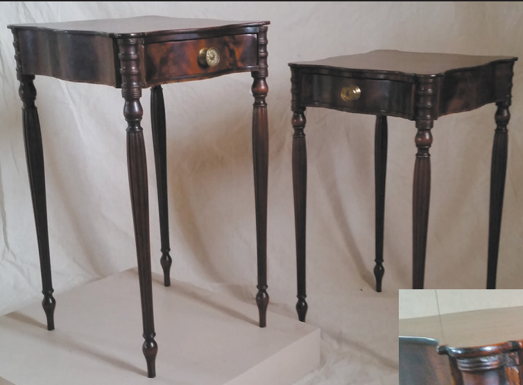
An extremely rare pair of one drawer stands in original condition from the North Shore. Representative of an important single owner collection that we will be exhibiting at Wallace Hall, January 19 -21, 2018, Park Avenue at 84th Street.