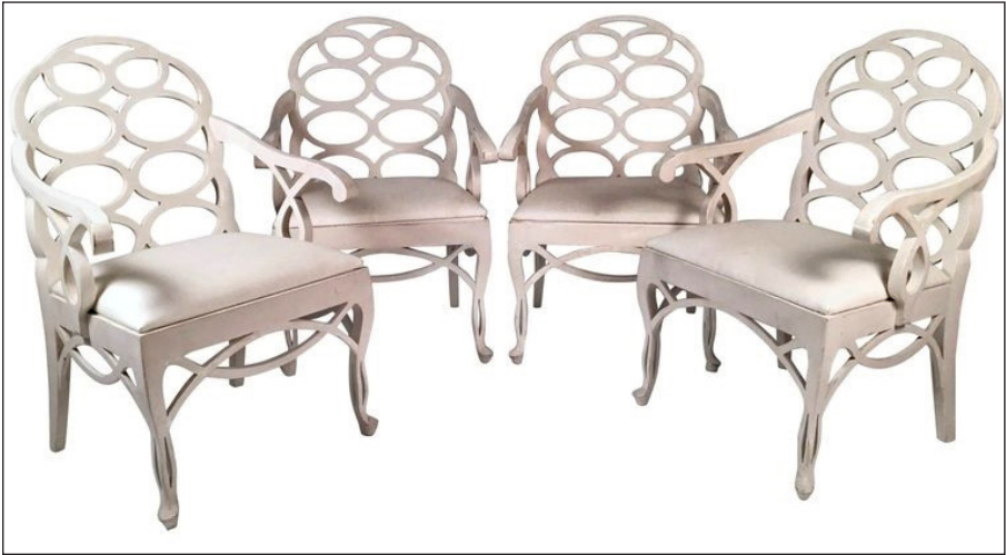
ANDREW SPINDLER ANTIQUES & DESIGN, Essex, Mass. — A set of four generously proportioned loop armchairs designed by the celebrated interior designer Frances Elkins (1883–1953), American, mid-Twentieth Century.