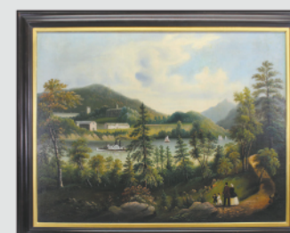
Fanny Flora Bond Palmer (1812 - 1876) "View of West Point" Oil on canvas. Sight Size: 23 x 31.5 in. Featured in the exhibition "This Perfect River-View": The Hudson River School and Contemporaries in Private Collections in Highlands (Putnam County Historical Society & Foundry School Museum July 20th- November 25, 2007).