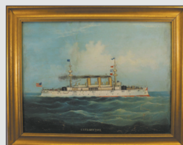
Antique oil on board painting of USS New York (ACR-2/CA-2) was the second United States Navy armored cruiser.