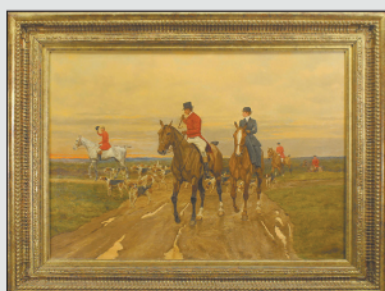
Edward Algernon Stuart Douglas (United Kingdom, 1850 - c.1920) Oil on canvas painting of a fox hunting scene. Sight Size: 17.5 x 23.5 in.