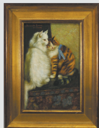
Henriette Ronner (1821 - 1909) Oil on panel painting. Signed upper left. Sight Size: 12 x 8 in.