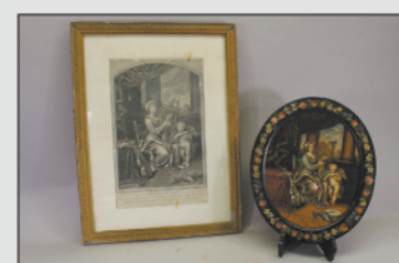
19th C French Ebonist Plaque w/ Original Engraving of the plaque. Overall Sizes: 20 x 15 / 13 x 11 in.