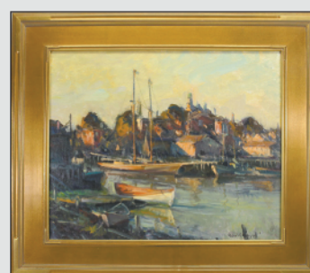
"Port of Gloucester" Robert Charles Gruppe (born 1944). oil on canvas painting signed lower right. Titled verso. Sight Size: 19 x 23 in.