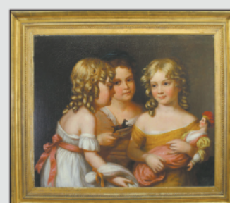
Charles Bird King (District Of Columbia, Rhode Island, 1785 - 1862) "Girl's Playtime" oil on canvas painting. Sight size: 25 x 30 inches. Provenance: Christie's lot 4, 9/27/90.