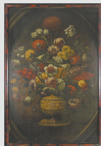
Dutch School 17th/Early 18th Century Old Master Still Life Painting. Sight Size: 37 x 25 in. Oil on canvas laid on board.