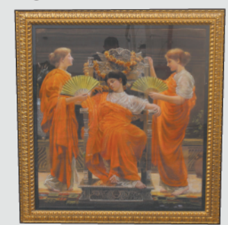
Eugene von Blaas (Italy, Austria, 1843 - 1932) Monumental Pastel of three women. Signed and dated 1919 lower right. Sight size: 45 x 40 in. Overall Size: 54 x 49 in. After Albert Joseph Moore's (1841 - 1893) painting "Midsummer".

For more information bidders can visit SarasotaEstateAuction.com , Email SarasotaEstateAuction@gmail.com or call 941.706.3910