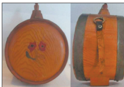
The Very Best Shaker Canteen in Existence. Shaker museums were contacted and did not deny its being Shaker, but had no evidence of its existence. Three others are included.