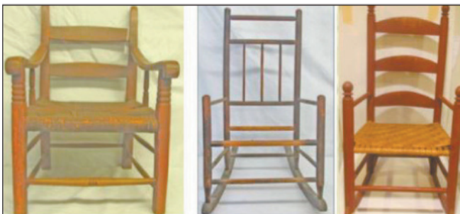
Three Pilgrim Era Children's Chairs, Two with Original Red Paint, Carver Chair Missing Cloth Seat. Over Twenty-Five from 1630-1750.