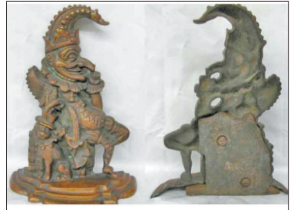
Two Bronze 11 1/2 Double Cast Punch Door Stops in Excellent Condition, Unknown to Have Existed.