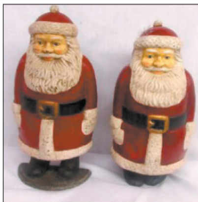
Extremely Rare Original Double Cast Santa Clause Door Stop and Bank; Over Twenty-five Other Door Stops are in this Sale.

One of the Rarest Flax Wheels in Existence and Excellent Running Condition. It is 22" tall. A few worm holes on one cross stretcher.