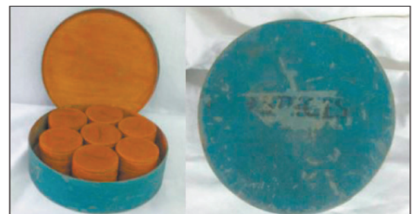
Extremely Rare Hingham Spice Box with Seven Turned Numbered Containers.