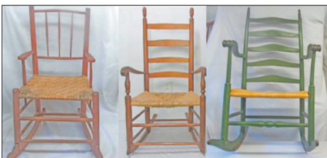
Three Very Rare Early 1630's -1710 Rocking Chairs in Excellent Condition. Over forty chairs from 1700-1800 in this sale.