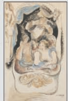
PAVEL TCHELITCHEV (RUSSIAN 1898-1957) , At a Theatre Box , 1923, gouache, India ink and graphite on paper; 18 7/8 x 12 1/4 in., $1,750-2,250