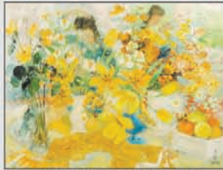
LE PHO (VIETNAMESE-FRENCH 1907-2001) , In the Garden , oil on canvas; 35 1/4 x 45 7/8 in., $27,000-35,000