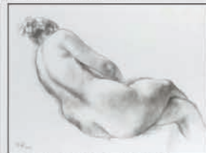
FRANCISCO ZUNIGA (MEXICAN 1912-1998) , Desnuda , 1976, charcoal on paper; 21 1/4 x 27 1/4 in., $2,000-3,000