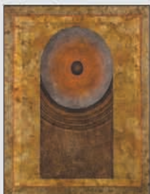
ZBIGNIEW MAKOWSKI (POLISH B. 1930) , Nucleus , 1963, oil on canvas; 65 x 49 in., $10,000-15,000