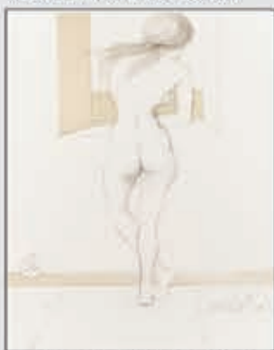
SALVADOR DALI (SPANISH 1904-1989) , Nude at the Window , 1970, color lithograph on paper; 29 3/4 x 21 5/8 in., $1,500-2,500