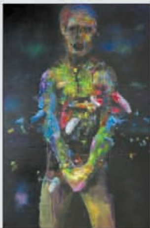
LITIANBING (CHINESE B. 1974) , Untitled , 2006, oil on canvas; 118 x 78 in., $10,000-15,000