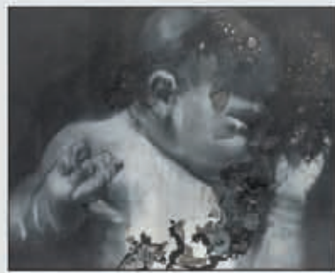
LITIANBING (CHINESE B. 1974) , Bebe 2 , oil on canvas; 25 1/2 x 32 1/8 in., $4,000-6,000