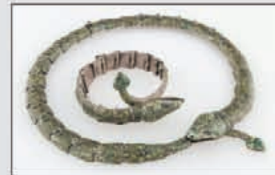
ENAMELLED SILVER SNAKE NECKLACE AND BRACELET SUITE, MELESIO RODRIGUEZ OF MARGOT DE TAXCO, MEXICO, MID 20TH CENTURY , length of necklace: 17 1/4 in., diameter of bracelet: 2 1/2 in., $600-800