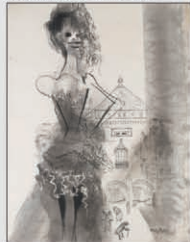
WILLIAM GROPPER (AMERICAN 1897-1977) , Espania , ink on paper; 25 1/4 x 19 1/2 in., $500-700