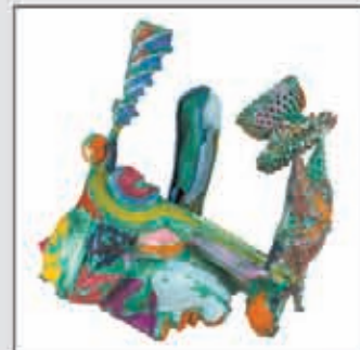
NANCY GRAVES (AMERICAN 1939-1995) , Specific Mystery of Sleep , 1989, bronze, polychrome patina and baked enamel; 18 x 19 x 14 in., $5,000-7,000