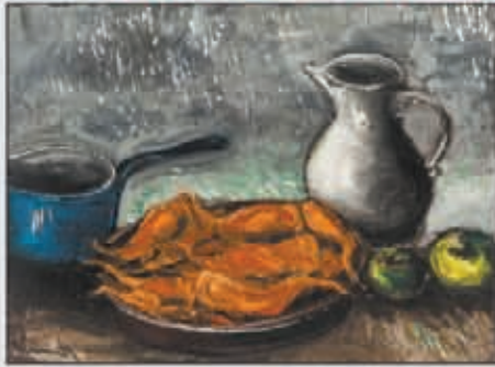
MAURICE DE VLAMINCK (FRENCH 1876-1958) , Still Life with Red Fish , oil on canvas; 21 1/4 x 28 3/4 in., $25,000-35,000

VIEW FULLY ILLUSTRATED CATALOG AT WWW.SHAPIROAUCTIONS.COM