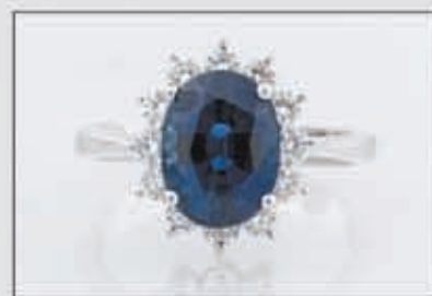
A WHITE GOLD RING WITH AN OVAL SAPPHIRE AND DIAMONDS , overall weight: 4.8 g, $5,000-7,000