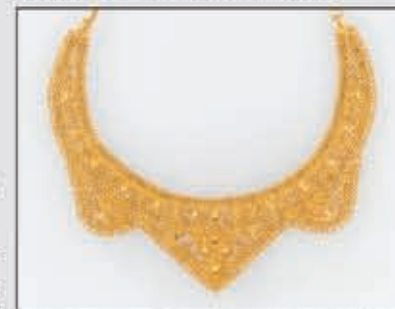
A GRANULATED HIGH KARAT GOLD INDIAN BRIDAL NECKLACE , interior length: 17 in., $2,000-3,000