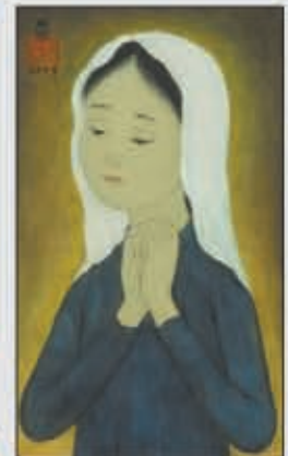
MAI TRUNG THU (VIETNAMESE-FRENCH 1906-1980) , Jeune fille , gouache and ink on silk mounted on paper; 10 1/4 x 5 7/8 in., $26,000-32,000