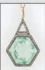
AN IMPRESSIVE ANTIQUE RUSSIAN AQUAMARINE AND DIAMOND PENDANT, MAKERS MARK IN THE FORM OF A CYRILLIC MONOGRAM IG, MOSCOW, 1909-1917 , full height of pendant with suspension ring: 1 5/8 in., $10,000-15,000