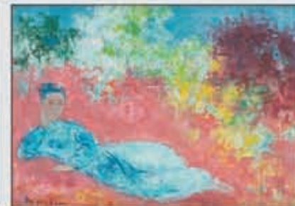
VU CAO DAM (VIETNAMESE-FRENCH 1908-2000) , Le Poete , oil on canvas; 9 5/8 x 13 in., $5,000-$7,000