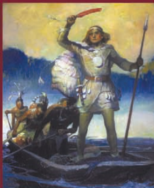
Frank E. Schoonover (1877-1972) The Flamingo Feather , 1923