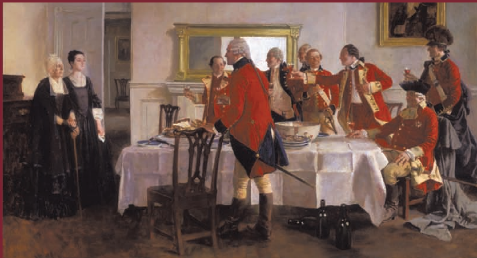
Howard Pyle (1853-1911), An Unwelcome Toast , 1895