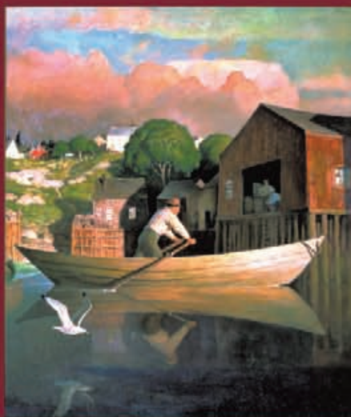
N.C. Wyeth (1882-1945) The Doryman , 1933