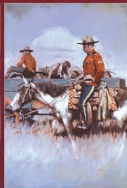
Harvey Dunn (1884-1952) The Prisoners , 1914