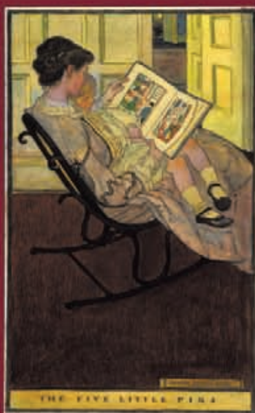
Elizabeth S. Green (1871-1951) The Five Little Pigs , 1905

This exhibition highlights the work of Howard Pyle, known as the "Father of American Illustration," and the generation of illustrators he taught. In 1894, Pyle founded the first School of Illustration in America at Drexel Institute, then in 1900 starting the Howard Pyle School of Illustration in Wilmington, Delaware. His students at both schools became known as "The Brandywine School", which included some of America's greatest illustrators, who are represented in this exhibition: Stanley Arthurs, Anna and Ethel Betts, Harvey Dunn, Anton Otto Fischer, Philip R. Goodwin, Elizabeth Shippen Green, W.H.D. Koerner, Violet Oakley, Frank Schoonover, Jessie Willcox Smith, Sarah Stilwell Weber and N.C. Wyeth.