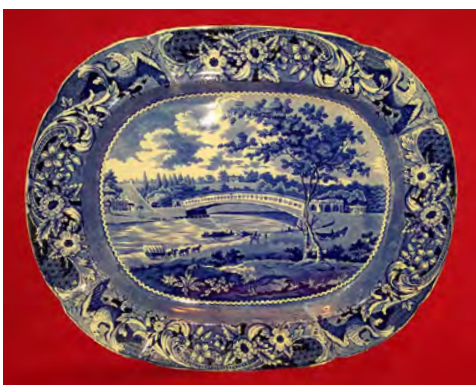
18 inch Dark Blue "Upper Ferry Bridge Over The Schuylkill River" Platter by Joseph Stubbs, Circa 1825, Mint Condition.

The Phelps School, Malvern, PA 610.692.4800 www.chestercohistorical.org