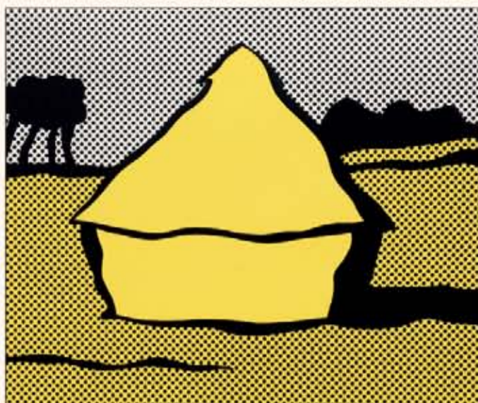
Roy Lichtenstein, Haystack , color screenprint, 1969. Estimate $8,000 to $12,000.