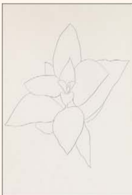
Ellsworth Kelly, Milkweed , pencil, 1969. Estimate $30,000 to $50,000.