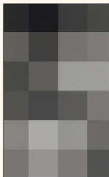
Christopher Wool, Untitled , set of five digital inkjet prints, 2003. Estimate $25,000 to $35,000.