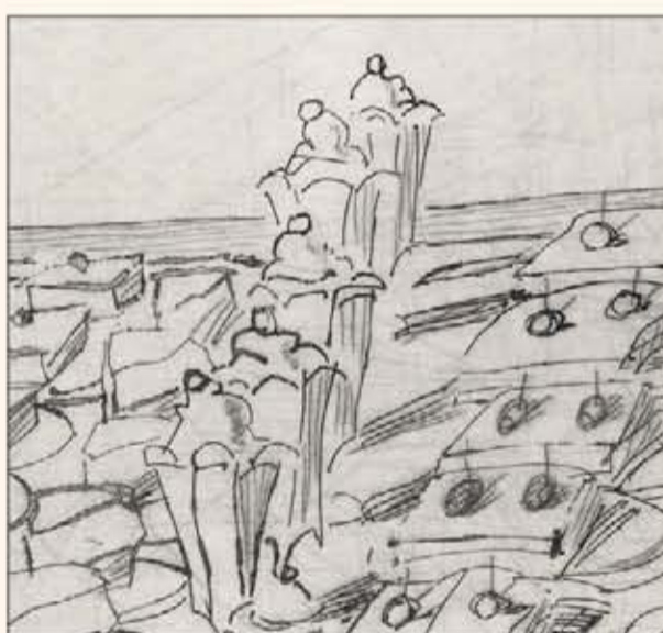
Wayne Thiebaud, Snack Counter , etching and drypoint, 1966. Estimate $15,000 to $20,000.