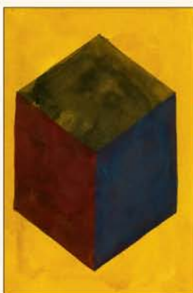
Sol LeWitt, Cube , gouache, 1991. Estimate $10,000 to $15,000.