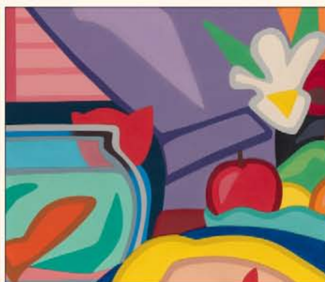
Tom Wesselmann, Still Life with Blonde and Goldfish , mixografia print on hand-made paper, 2000. Estimate $10,000 to $15,000.