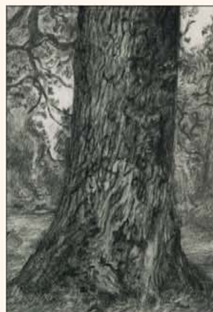
Lucian Freud, After Constable's Elm , etching, 2003. Estimate $25,000 to $35,000.