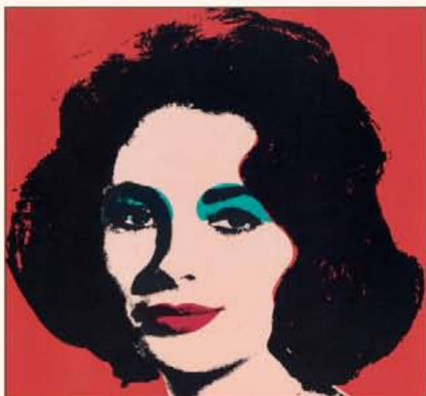
Andy Warhol, Liz , offset color lithograph, 1964. Estimate $30,000 to $50,000.