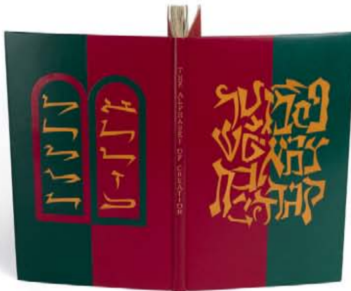
Ben Shahn & Paul Bonet, The Alphabet of Creation , with a signed drawing by Shahn, New York, 1954. Estimate $6,000 to $9,000.