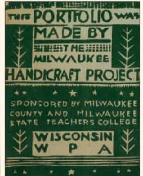
Applied Design: Block Printed Textiles , six volumes, issued by the Milwaukee WPA Handicraft Project, 1937-38. Estimate $4,000 to $6,000.