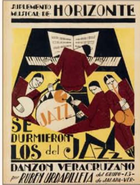
Nine volumes of the Mexican Stridentist journal, with images by Diego Rivera & Leopoldo Méndez, 1926-27. Estimate $20,000 to $30,000.