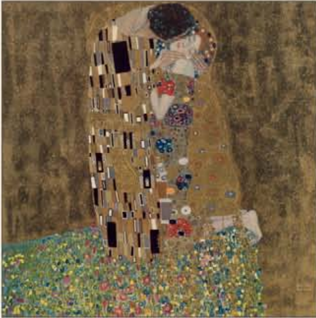
Gustav Klimt, Das Werk , Vienna & Leipzig, 1918. Estimate $45,000 to $60,000.