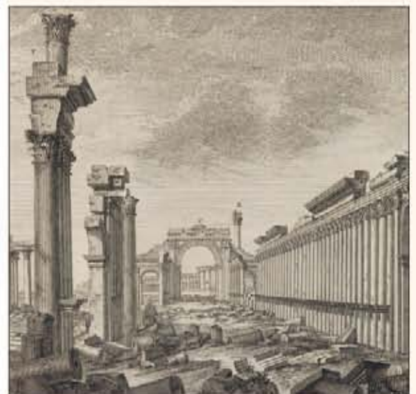
Robert Wood & James Dawkins, Les Ruines de Palmyre , first French edition, London, 1753. Estimate $1,500 to $2,500.