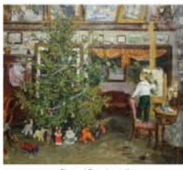
Signed Russian oil