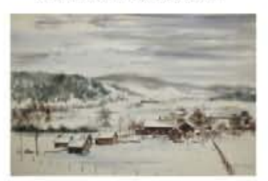
Paul Sample, w/c