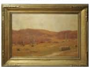
Oil, Bruce Crane