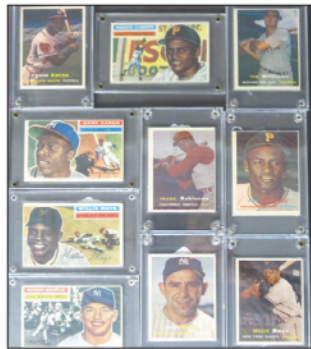
Hundreds of Baseball Cards from the 50s