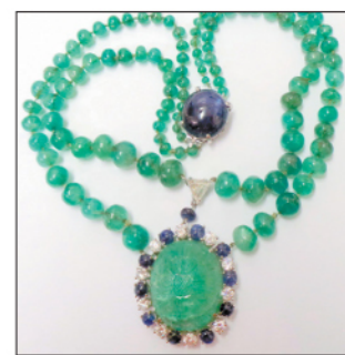
Large Emerald Carved Cabochon with Sapphires and over 3cts of Diamonds!