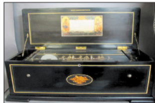
Orchestra Box – Nicole Freres