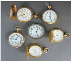
Collectible Pocket Watches