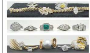
Over 100 Lots of Fine Jewelry!