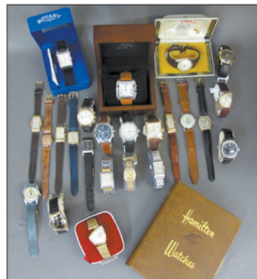
Over 100 Collectible Wrist Watches!