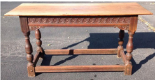
Early table (Woodstock estate)