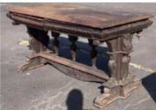
Early carved table