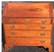
Early drop front desk