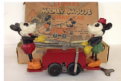
Mickey Car in box