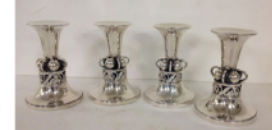
4 sterling Jensen design candlesticks