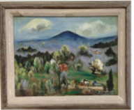
Georgina Klitgaard - o/c Woodstock landscape