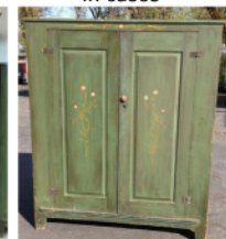
Hudson Valley cupboard