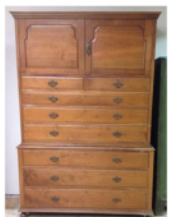
European chest on chest