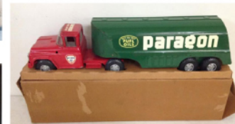
Buddy L in box