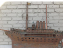
Guy Lombardo's 48" copper ship model