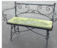
Early iron bench