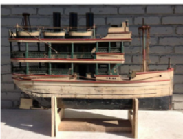
Early 41" boat in old paint