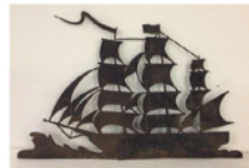
Sheet metal weathervane