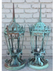
Pr. copper lights in old green patina