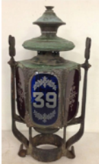
Rare Devoursney Fire Lantern