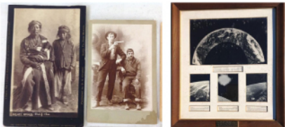
Indian & Western photography