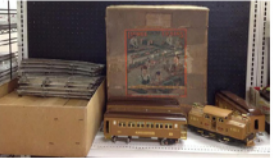
60 lots of trains