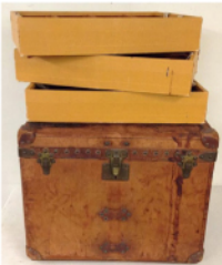
1920's Louis Vuitton leather trunk