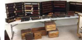
Incredible handmade train collection (1 lot)