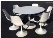
Mid Century table & chairs