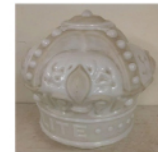
SOLITE Gas Globe

Live online bidding with LIVEAUCTIONEERS, INVALUABLE, AUCTION ZIP & EBAY LIVE