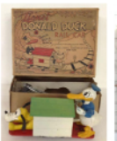
Donald Duck in box