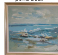
Stefan Lokos o/c seascape