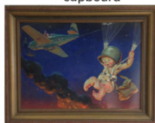
(2) Bert Yates o/b illustrations