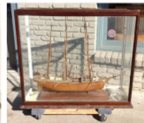
Early ship model in cases