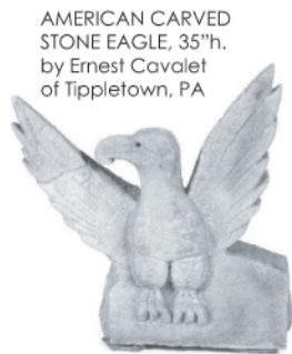
AMERICAN CARVED STONE EAGLE, 35"h. by Ernest Cavalet of Tiptletown, PA