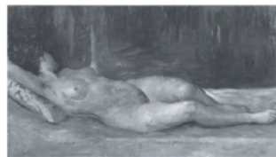
ODALESQUE IN THE MANNER OF LOVIS CORINTH (GERMANY, 1858-1926) $10,000-$15,000