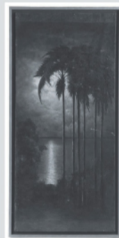
OIL BY GRIF TELLER