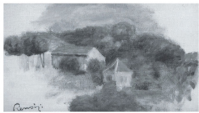
ESQUISSE DE PAYSAGE BY PIERRE AUGUSTE RENOIR (FRANCE, 1841-1919) Oil on canvas, signed lower left. Landscape study with cottages. 5.75"h. 10.25"w., gilt frame, 12.25"h. 16.5"w. Estimate $140,000-$160,000

Garth's Auctions Inc. PO Box 369 Delaware, Ohio 43015 740.362.4771 info@garths.com www.garths.com