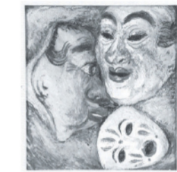
MASKS IN THE MANNER OF JAMES ENSOR (BELGIUM, 1860-1949) $6,000-8,000