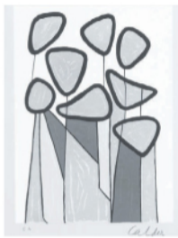
Fine Selection of Prints by CALDER, PICASSO, MIRO, APPEL CHAGALL & more