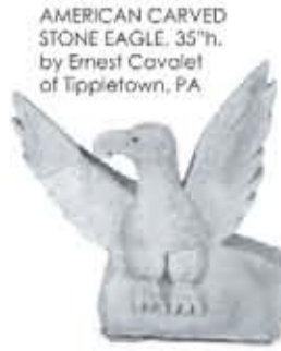
AMERICAN CARVED STONE EAGLE. 35" h. by Ernest Cavelet of Tiptopville, PA