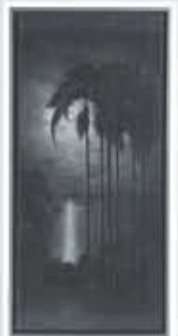
OIL BY GRIF TELLER