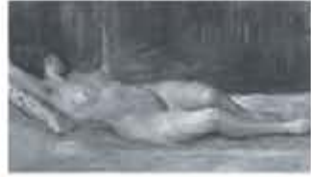
ODALESQUE IN THE MANNER OF LOUIS CORINTH (GERMANY, 1858-1926) $10,000-$15,000