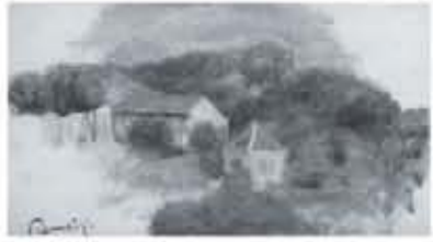
ESQUISSE DE PAYSAGE BY PIERRE AUGUSTE RENOIR (FRANCE, 1841-1919) Oil on canvas. signed lower left. Landscape study with collages. 5.75h. 10.25w. gilt frame. 12.25h. 14.5w. Estimate $140,000-$160,000

Garth's Auctions Inc. PO Box 369 Delaware, Ohio 43015 740.362.4771 info@garths.com www.garths.com