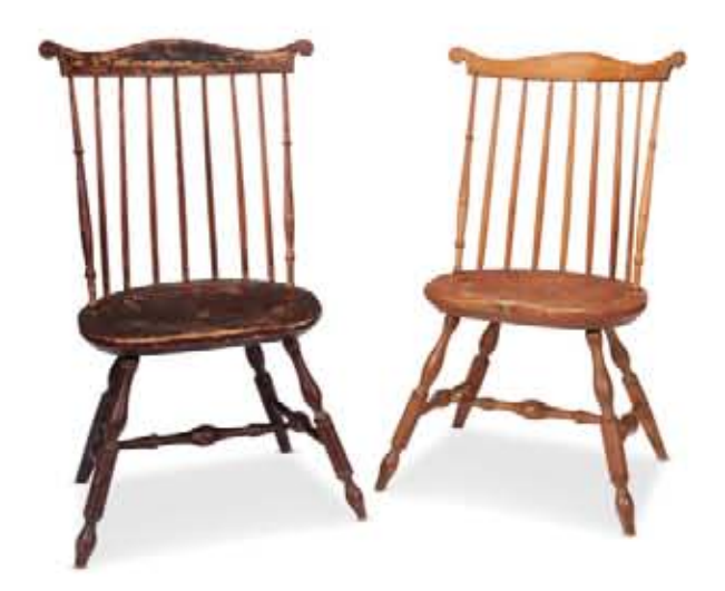
Two fan-back Windsor side chairs Lancaster County, PA, circa 1780 $5,000-8,000