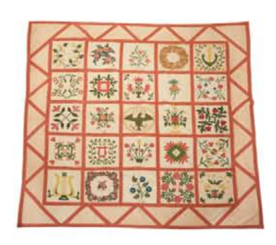
Appliquéd Quaker album quilt Baltimore, MD, dated 1845 $10,000-15,000