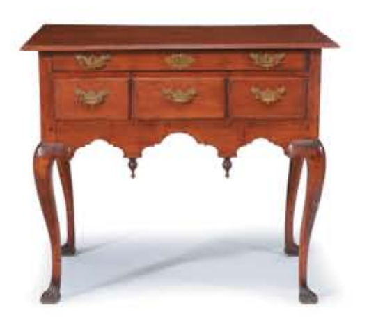
Queen Anne maple dressing table Connecticut, circa 1750 $4,000-6,000