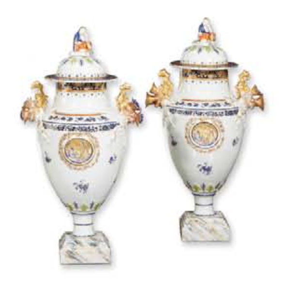
Pair of Neoclassical Chinese Export porcelain twin-handled covered urns First quarter 19th century $5,000-7,000