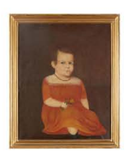
American School 19th century Portrait of a little boy in a red dress holding flowers $2,000-3,000