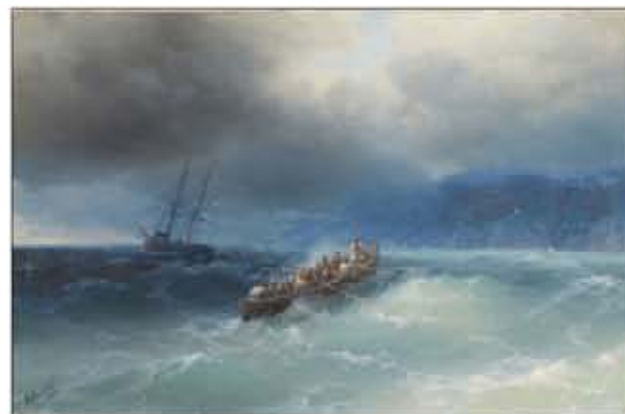
Ivan Konstantinovich AIVAZOVSKY (Russian, 1817 - 1900) Storm Over the Black Sea , 1893, Oil on canvas 21 x 33.25 in. - 53.5 x 84.5 cm.