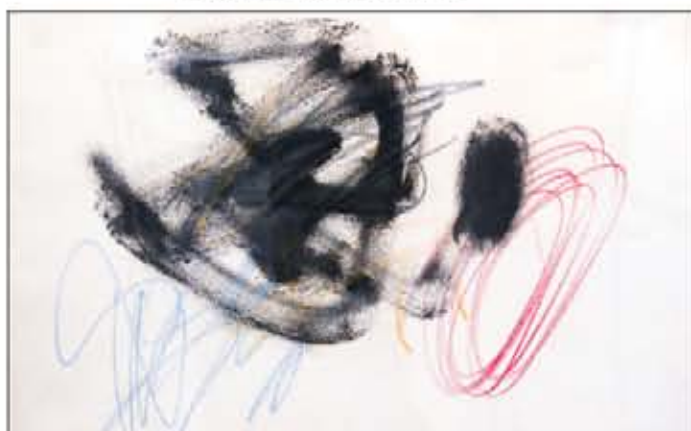
Joan MIRÓ (Spanish, 1893 - 1983) Untitled, 1960, Brush and black wash and colored wax crayons on paper 118.8 x 182.8 in. - 46.8 x 72 cm.