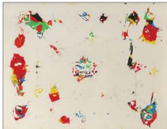
Sam FRANCIS (American, 1923 - 1994) SF94S , Acrylic on paper 22 x 29.5 in. - 56 x 75 cm.