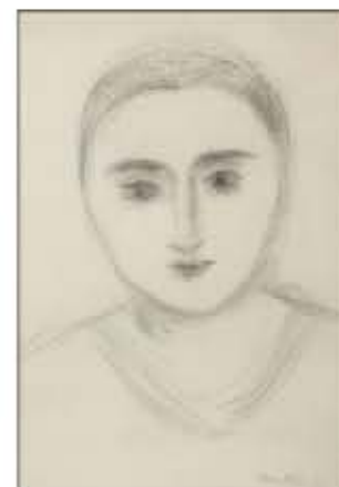
Henri MATISSE (French, 1869 - 1954) Tête de femme , 1950, Pencil on paper 19.5 x 13.3 in. - 49.5 x 33.7 cm.