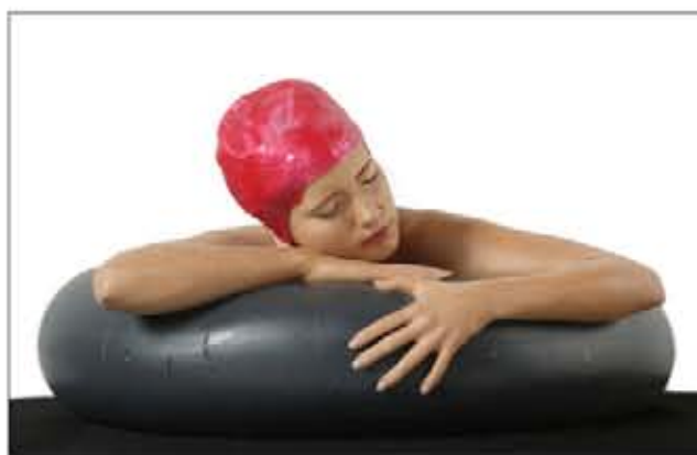
Carole FEUERMAN (American, born 1945) Innertube Variant II , 2013, Oil on resin 17 x 32 x 15 in. - 43.2 x 81.3 x 38.1 cm.