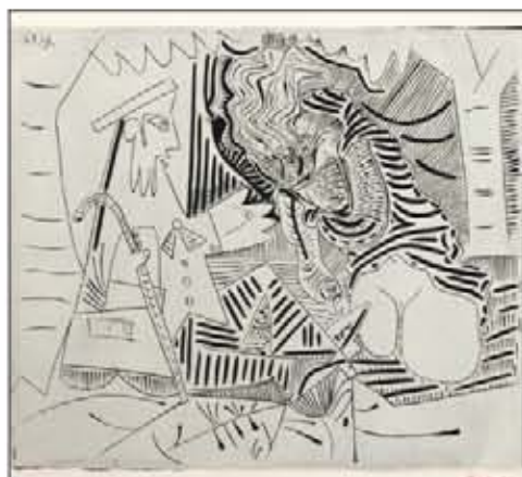
Pablo PICASSO (Spanish, 1881 - 1973) Le déjeuner sur l'herbe, after Manet, I , Linoleum cut 21 x 25 in. - 53 x 64 cm.