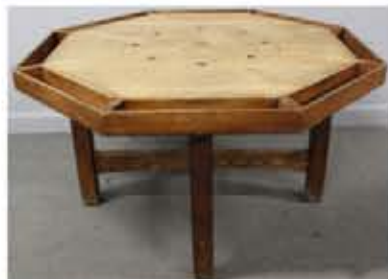
Stickley from actor Bruce Willis