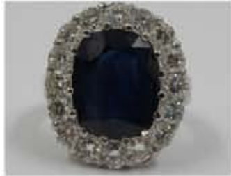
Sapphire & diamonds

Internet bidding at bidsquare.com • liveauctioneers.com