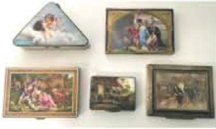
Silver enamel boxes