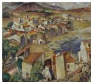
Mela Muter o/c