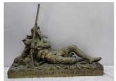
Lord Ronald Sutherland Gower