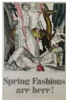
Oil on panel