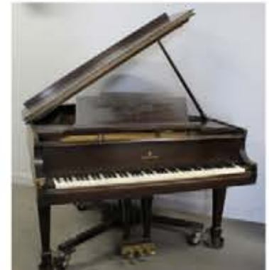
Steinway & Sons