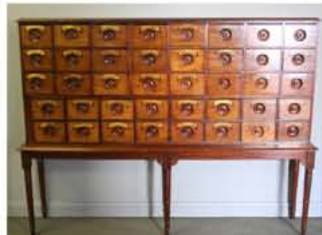
1 of 2