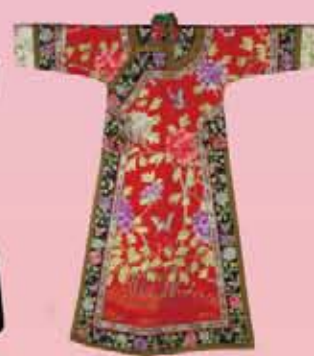
MANY CHINESE ROBES