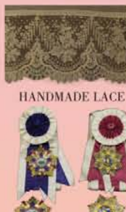
HANDMADE LACE IMPORTANT KUOMINTANG MEDALS