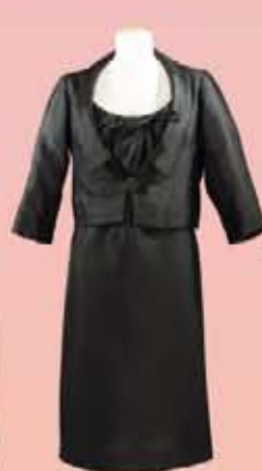
1950s DIOR COUTURE