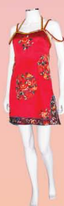
TOD OLDHAM MINI DRESS

LANDMARK ON THE PARK 160 CENTRAL PARK WEST (at 76th St) NEW YORK CITY