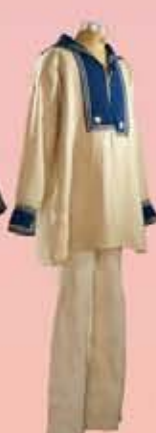
MANS BOAT CLUB SUIT, 1850s