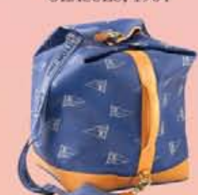
RARE VUITTON CUP BAGS