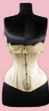
SILK SATIN CORSET, 1890s