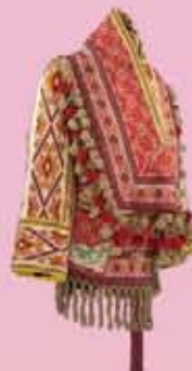
McQUEEN KNIT JACKET