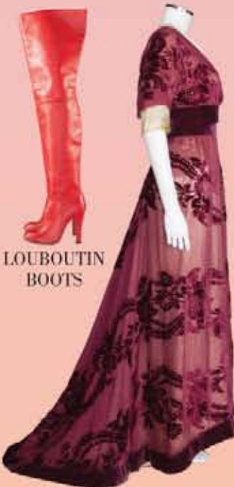
WORTH CUT VELVET, 1908