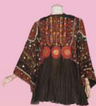
JUMLO TUNIC, PAKISTAN