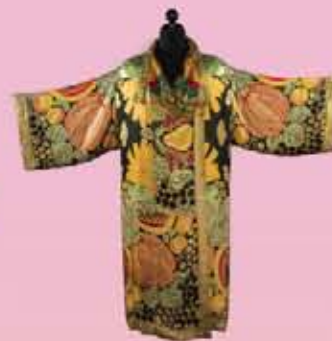
RAOUL DUFY FRUIT COAT, 1920s