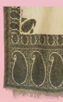
PAISLEY WEDDING SHAWL, 1820