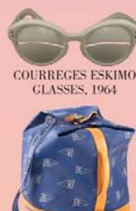
COURREGES ESKIMO GLASSES, 1964