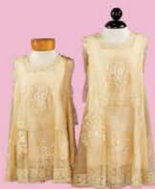
1910 GIRLS LACE SETS