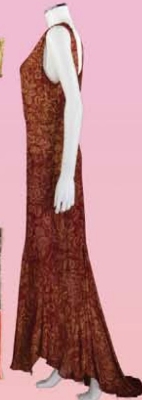
1930s PATOU COUTURE