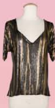
WHITING & DAVIS MESH TOP