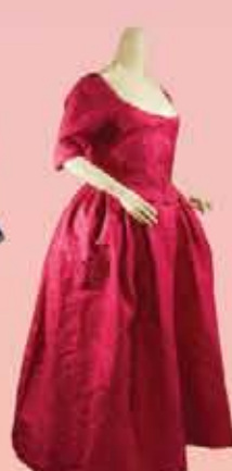
1760 SILK ROBE A L'ANGLAISE