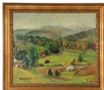
Lot 656 - GEORGE BENJAMIN LUKS (NY, 1867-1933) - "Pennsylvania Landscape", oil on upson board, signed, 22 3/4" x 26 3/4" est. $3000 - $5000