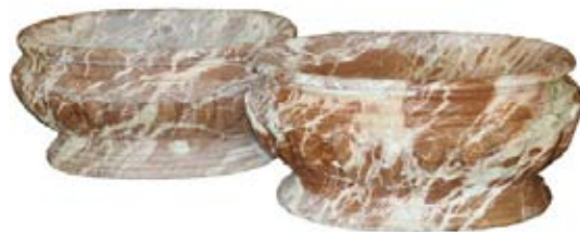
Lot 733 - 18th c. Italian Romanesque Garden Basins in red travertine marble, in oval form with lobed sides, 13" x 28" x 18" est. $2000 - $3000