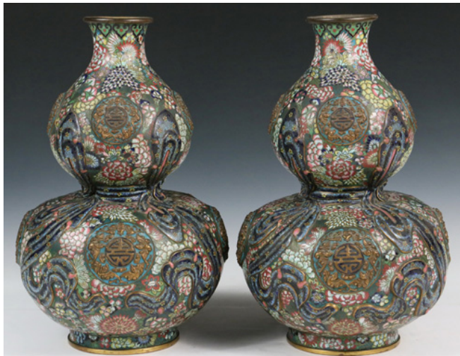
Lot 1098 - Pair of Chinese Double Gourd Cloisonne Vases over gilt bronze, with raised decoration centered on four symbols of longevity per tier, 12 1/2" x 7 3/4" diam. est. $10000 - $15000