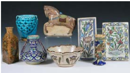
Lot 859 - (8) Pieces of Decorated Persian Pottery. est. $1000 - $1500