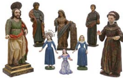
South American Colonial Santos and Continental Ecclesiastical Figures.