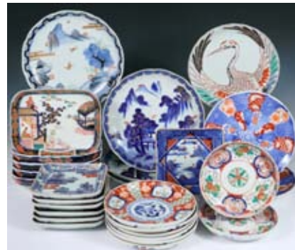
Lot 968 - (27 pcs) 20th c. Japanese Imari Porcelain. est. $600 - $800