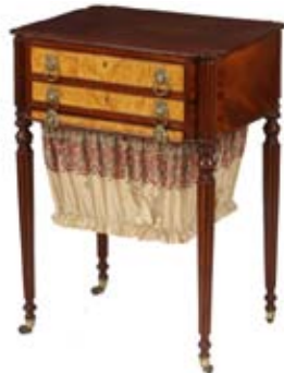
Lot 927 - Sheraton Period Mahogany Stand having canted turret corners, reeded stiles and matching tapered round legs, 29" x 20 3/4" x 16" est. $1000 - $1500