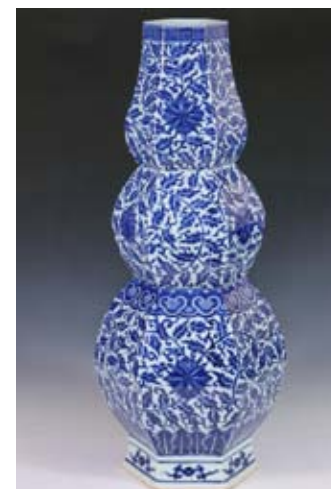
Lot 1111 - Chinese Porcelain Qing Dynasty Blue and White Triple-Gourd Hexagonal Form Vase with Chrysanthemum decoration, 23 1/2" x 10" diam. est. $1000 - $1500