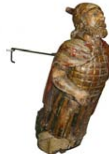
Lot 610 - Ship's Figurehead of a Viking Warrior in solid yellow pine, late 18th to early 19th c., 58" tall est. $10000 - $15000