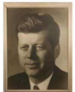
Lot 1247 - JFK Black & White Photographic Campaign Portrait. Originally hung in the Florida State HQ from the Presidential Election of 1960. 39 1/2" x 29 1/4" est. $2000 - $3000