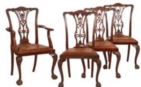
Lot 641 - (8) Chippendale Style Mahogany Dining Chairs, two arm & six side, with pierced ribbon and leaf backsplats. est. $2000 - $3000