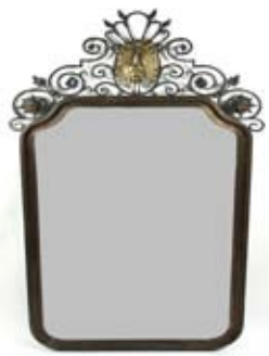
Lot 1430 - Wrought Iron & Bronze Framed Mirror by Oscar Bach, signature tag on back, 65" x 34" est. $3000 - $5000