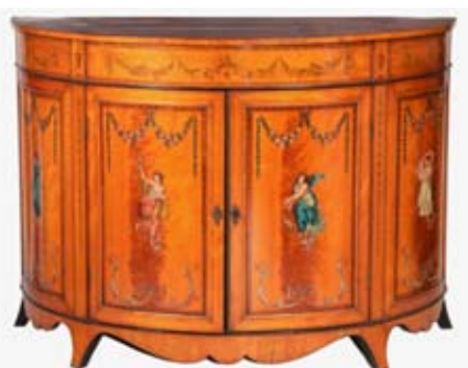
Lot 705 - Adams Style Demilune Cabinet in mahogany with inlaid and painted decoration, 39" x 54" x 24" est. $2500 - $3500