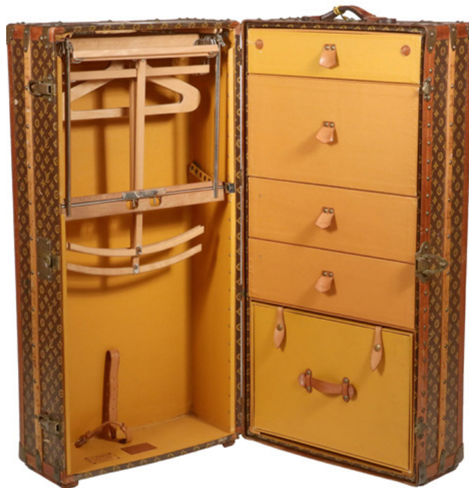
Lot 1235 - 1920s Louis Vuitton Wardrobe with stenciled monogram canvas, wood slat and brass trim with locks (and key). Appears to be s/n 769318; the lock is s/n 0593-7. 44 1/2" x 17" x 22" est. $8000 - $12000