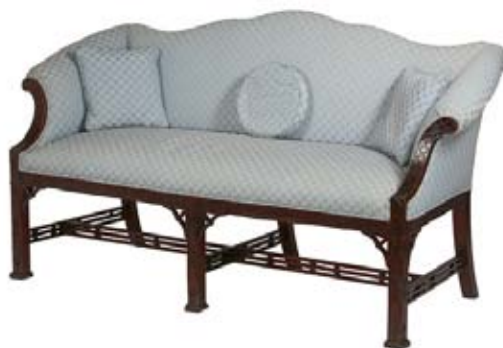
Lot 670 - Late 19th to early 20th c. Diminutive Chinese Chippendale Camelback Sofa in powder blue brocade upholstery, 64" x 26" est. $1200 - $1800