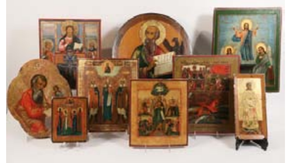
Lot 1239 - English Sterling Silver (7) Piece Coffee & Tea Service, (5) pcs are hallmarked for Birmingham, 1931-33, maker L&R in a rectangular cartouche. est. $5000 - $7000