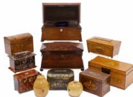
Fine Selection of 19th c. Tea Caddies