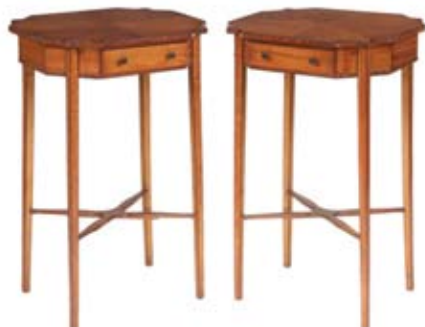
Lot 917 - Custom English Hepplewhite Stands, circa 1920s, in quartered satinwood veneer, 28" x 18" x 14 3/4" est. $800 - $1200