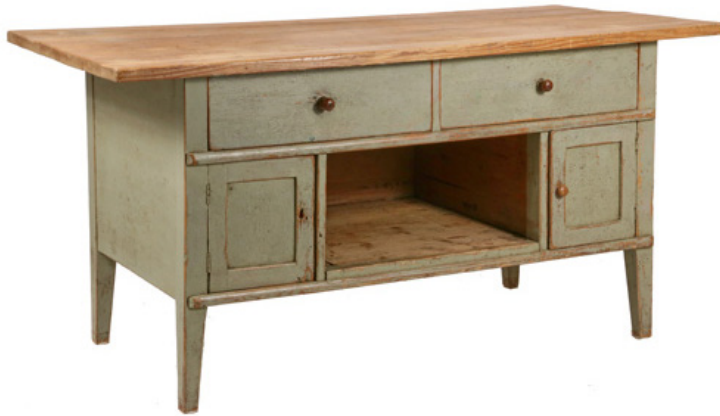
Lot 1365 - Late 19th c. Country Kitchen Work Table with a large overhanging pine top, 31" x 62" x 29" est. $1000 - $1500