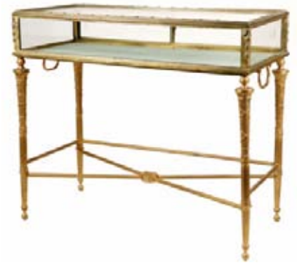
Lot 1290 - Gilt Bronze and Glass Classical Revival Vitrine, 40" x 45 1/2" x 22" est. $2500 - $3500