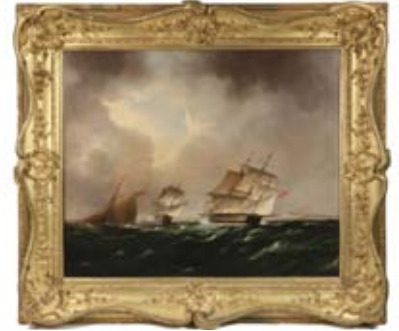
Lot 600 - THOMAS BUTTERSWORTH (UK, 1768-1842) - "English Man-of-War Forming Up in the Straits of Dover", oil on canvas, faintly signed. Titled on Quester Gallery label 24" x 29" est. $25000 - $35000