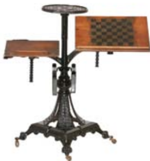
Lot 1215 - Circa 1875 Cast Iron Reading Stand, manufactured by the Holloway Company of Cuyahoga Falls, Ohio, roughly 39" tall, 17" square base, all folds into a compact space. est. $1000 - $1500