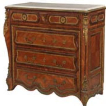
Lot 765 - Louis XIV Style, French Marble Top Dresser, with ormolu mounts, 43" x 45" x 20" est. $1000 - $1500