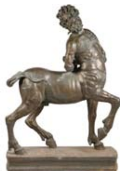
Lot 736 - FERDINANDO DE LUCA (19th - 20th c. Italy) - Monumental Bronze Garden Sculpture after the Furietti "Old Minotaur", artist signed, 54 1/2" x 38" x 16". est. $4000 - $6000