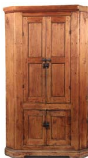
Lot 665 - 18th c. Pumpkin Pine Corner Cupboard, one piece, 80" tall, 48" wide, takes a 30" corner. est. $1000 - $2000