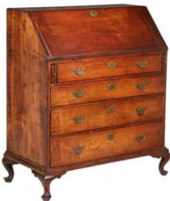
Lot 560 - 18th c. Queen Anne Slant Lid Desk in Figured Maple and Walnut, Boston area, 42 1/2" x 36" x 19 1/2". Cf. See "Fine Points of Furniture (Early American)" by Albert Sack, pg 143, "Best", with similar fitted interior. est. $3000 - $5000