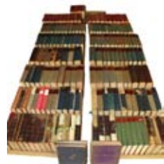
Lot 1705 - Complete collection of "Punch" magazines from inception through 1970, in various bindings, as issued. est. $1000 - $1500