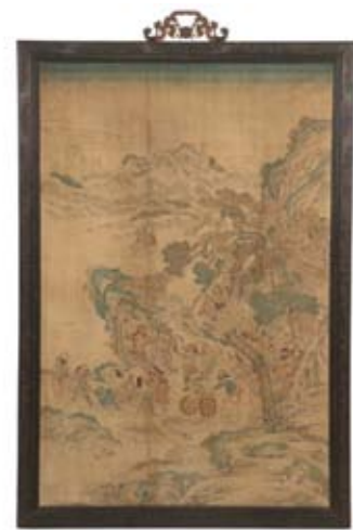
Lot 1096 - 18th c. or Earlier Framed Chinese Watercolor on Silk, depicting a procession of a Warlord down a mountain path, 40" x 26" est. $1000 - $1200