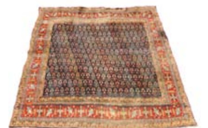
Lot 652 - Early 20th c. 8'1" x 8'3" Bidjar carpet from Northwest Persia. est. $1500 - $2000

liveauctioneers THOMASTON Live invaluable