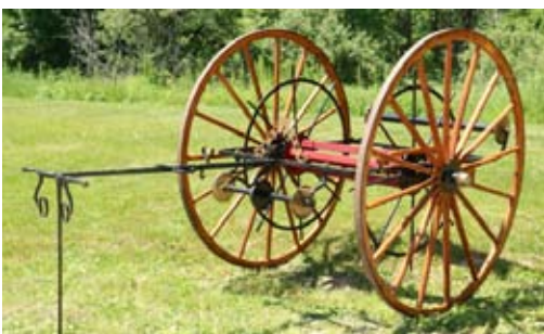
Lot 690 - Mid 19th c. Iron and Oak Two-Man Fireman's Hose Cart by M.B. Little, New York, 65" oak wheels, 66" wide at axle, 126" long. Fully restored. est. $3500 - $5000