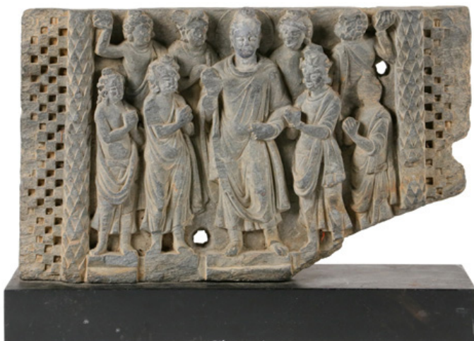
Lot 792 - Stone Relief Carving, Great Departure of Buddha, grey schist, Gandhara, 1-2nd Century. 9 1/2" x 15 1/4" stone, 2" x 16" x 4" plinth. est. $2000 - $3000