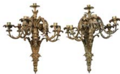
Lot 1379 - Circa 1880 Belle Epoch six stem candle sconces in gilt bronze, roughly 21" x 16" x 19" est. $1000 - $1500