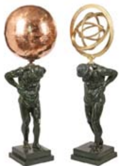
Lot 731 - Pair of Early 20th c. Sculptures, Atlas Bearing the Globe and the Heavens, after the originals at Versailles, approx. 59" x 18" est. $5000 - $7000