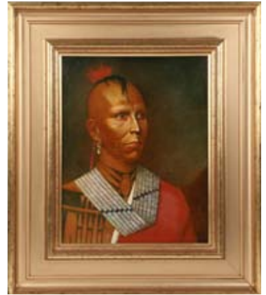
Lot 175 - ROBERT G. CONNELL (Contemporary Pittsburgh, PA) "The Orator", oil and encaustic on canvas, unsigned, 18 3/4" x 14 3/4" est. $4000 - $8000