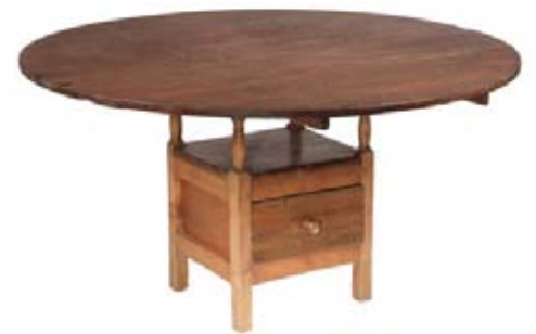
Lot 540 - Colonial New England Pine and Maple Chair Table with turned arm supports and single drawer below the seat, 53 1/2" diam top, 28" x 17 1/2" x 18" base. est. $1000 - $1500