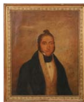
Lot 526 - 18th c. Colonial Portrait of a Successful Businessman, original water gilt laurel leaf frame, 29" x 23" est. $1000 - $2000