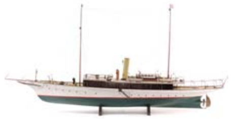
Lot 605 - Model of Steam Yacht 'Coquette' of New York, circa 1910, New York Yacht Club and family burgees, 31" x 65" x 9" est. $10000 - $15000