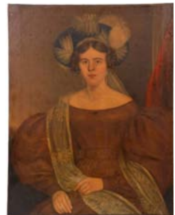
Lot 516 - 18th c. Life-Sized Waist Length Portrait of a Young Society Bride in Magnificent Gown and Headdress, 36" x 28" est. $1000 - $2000