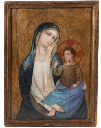
Lot 722 - Old Master Icon, Continental Madonna and Child, oil on panel, 15 3/4" x 11 3/4" est. $2000 - $3000