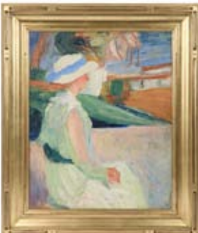
Lot 1507 - Impressionist Portrait of Woman in Summer Dress, oil on canvas, unsigned, marked "Smith" on back of canvas, circa 1915, 21 1/4" x 17" est. $2000 - $3000