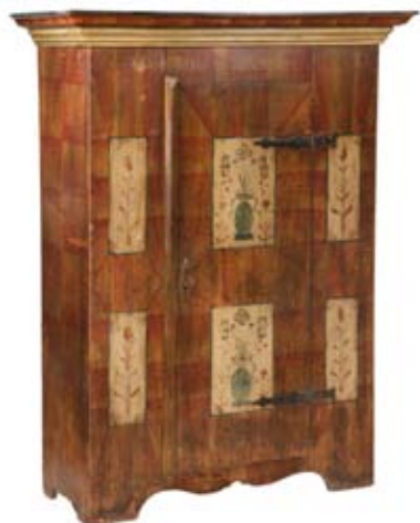
Lot 735 - 18th c. German Schrank, Paint Decorated Softwood Armoire, 69 1/2" x 53 1/2" x 22" est. $1000 - $2000