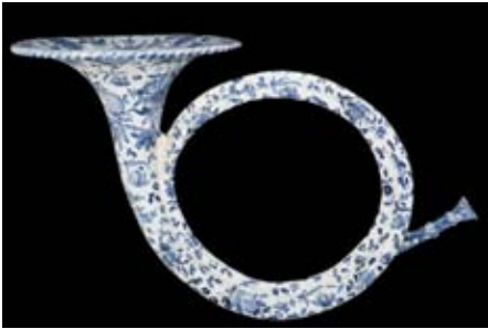
Lot 702 - Late 18th - early 19th c. Delft Full-Sized Hunting Horn, with blue and white overall floral decoration, 24" long, 10 3/4" bell. est. $3000 - $4000