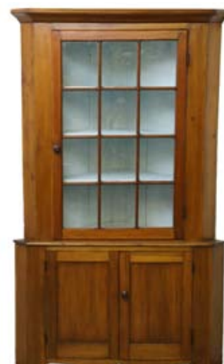
Lot 680 - 18th c. Country Pumpkin Pine Corner Cupboard, peg construction, 79 1/2" x 47" x 26", takes a 30" corner. est. $800 - $1200

liveauctioneers THOMASTON Live invaluable