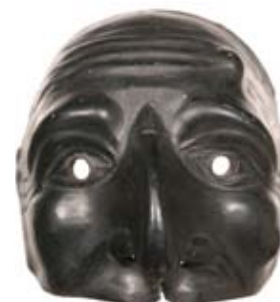
Lot 753 - Late 17th to early 18th c. Commedia Lacquered Dell'Arte Leather Mask of Punchinello, 6 1/2" x 6" x 5" est. $1500 - $2500