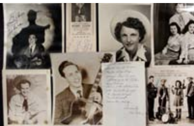
Lot 1700 - Collection of Early Country Western Music Promotional Material, dating from roughly 1946 to 1966, including letters from Chet Atkins, Les Paul and Smokey Warren. est. $2000 - $3000