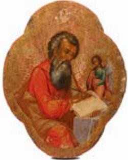
Lot 1002 - Circa 1840 Four-Lobed Icon of Saint John the Divine with an Angel, in egg tempera, 13" x 10" est. $1500 - $2000