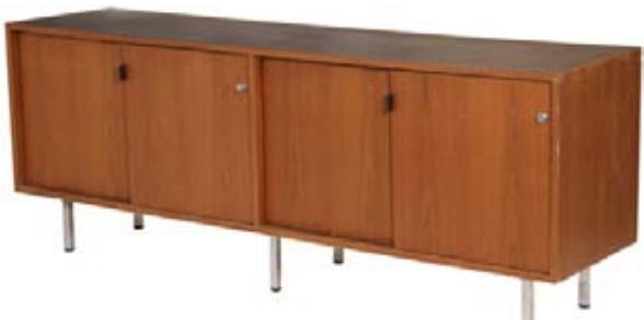
Lot 1404 - Circa 1965 Modernist Credenza designed by Florence Knoll Bassett (1917- ) for Knoll Inter-national, with walnut case, laminate top, chromed steel legs, 27 1/2" x 74 1/4" x 17 3/4" est. $800 - $1200