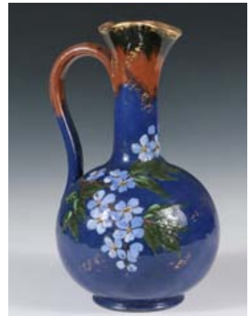
Lot 1411 - Rookwood Art Pottery Ewer dated 1882, decorated by Albert Humphreys, marked 'ROOKWOOD, 1882' and incised 'A.H.', 11 1/4" high, 6 1/2" diameter. est. $1000 - $1500