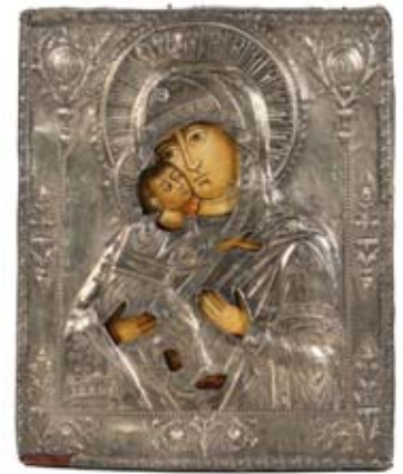
Lot 1012 - 19th c. Russian Icon, Our Lady of Vladimir, egg tempera on wooden panel, with silver oklad, 11 3/4" x 9 3/4". est. $1000 - $1500