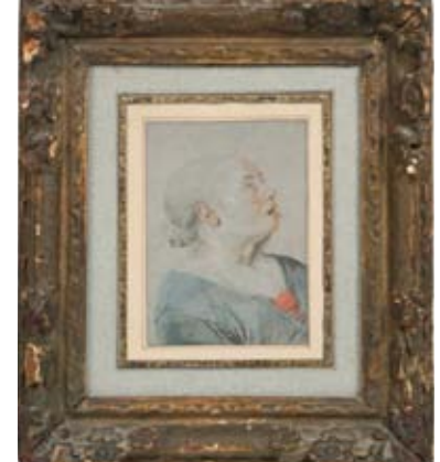
Lot 707 - GERRIT DOU (Netherlands, 1613-1675) "Vieille femme en buste chantant", a 'tronie' in black and red chalk with gouache, 4 1/2" x 3 1/2" est. $2000 - $3000

liveauctioneers THOMASTON Live invaluable