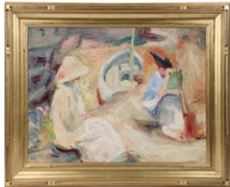
Lot 1508 - Impressionist Portrait of a Woman Painting a Woman, oil on canvas, unsigned, marked "Smith" on back of canvas, circa 1915, 18 1/4" x 24 1/4". est. $2000 - $3000