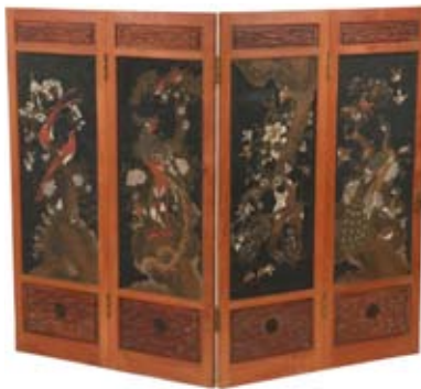
Lot 1321 - Japanese 4-Panel Screen, Kinoki (Cypress) Framed Screen with painted silk panels. Each panel is 53" x 18" est. $800 - $1200