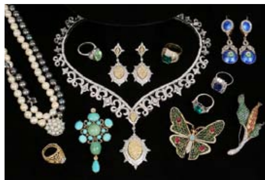
Fine Estate jewelry including a Necklace and Earring Suite containing a total of 39 carats of diamonds.