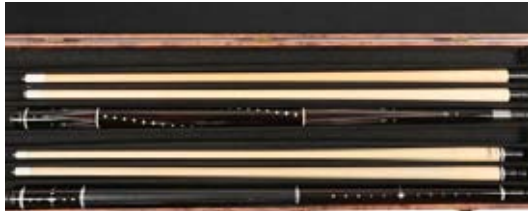
Lot 394 - (2) High Quality Pool Cues by David Jacoby, one signed and dated 7-10, the other marked 1/1, in custom fitted flat three-cue hard-case of faux burlwood vinyl. est. $2000 - $3000