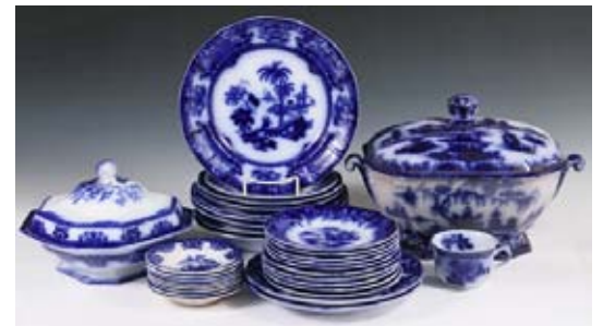
Lot 1489 - (57) Pieces of 19th c. Ironstone Flow Blue China by various makers. est. $800 - $1200