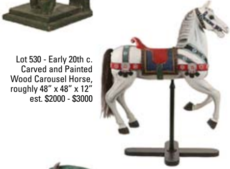
Lot 530 - Early 20th c. Carved and Painted Wood Carousel Horse, roughly 48" x 48" x 12" est. $2000 - $3000