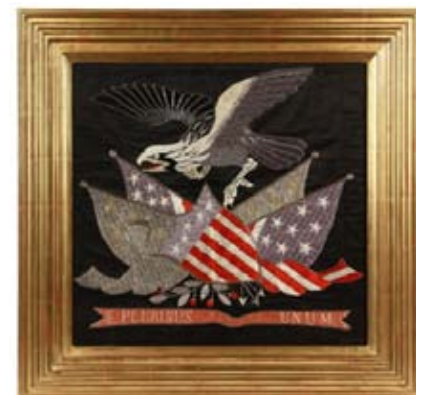
Lot 603 - Japanese Silkwork, US Patriotic Theme, circa 1890, 18 1/2" x 19" est. $1000 - $1500