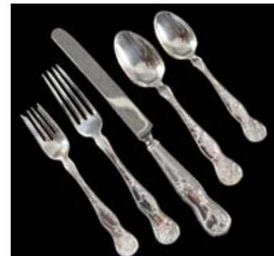
Lot 1232 - (40) Pieces of Tiffany & Co Sterling Silver Flatware, American Garden pattern, service for eight, 76.48 oz. tw. est. $3000 - $5000