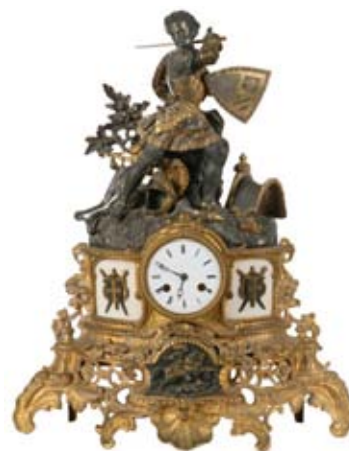
Lot 1330 - Fine French Figural Mantel Clock with inset porcelain panels, 8-day time & strike movement marked '1619', 20" high, 16 1/4" x 8" est. $800 - $1000