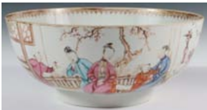
Lot 878 - 19th c. Famille Rose Porcelain Rum Bowl, having a continuous polychrome domestic scene, 4 7/8" x 11 1/4" diam. 1 of 14 lots of Famille Rose being offered. est. $1000 - $1500