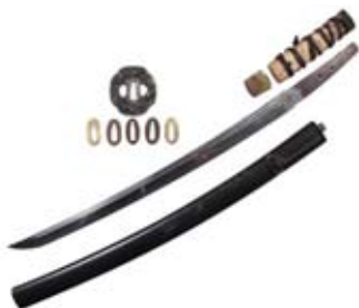
Lot 972 - Late 16th or early 17th c. Japanese Koto Period Wakazashi, probably Bizen, Overall length: 25" (63.5 cm); blade length: 17 3/4" (45.5cm), weight: 13.64 oz (380.9g) est. $2000 - $3000