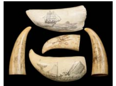
Lot 551 - (5) Scrimshaw Whales teeth, incl: a pair of ship portraits of "The Emerald" both signed 'SHW', 4 1/4" & 4 1/2" long, "Taking of Cachalot, 1859", 5" long, Whaling Scene, 5 3/4" long, American Eagle, 3 3/4" long. est. $1800 - $2500