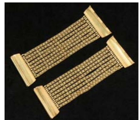
Lot 1261 - Pair of High Carat Yellow Gold Handmade Etruscan Revival Design Bracelets, c. 1820-40, 7" long 2 1/2" wide, 126.6 dwt tw. est. $6000 - $8000