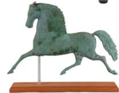
Lot 506 - 19th c. "Black Hawk" Running Horse Weather vane in patinated copper with cast zinc ears, attr. to Harris and Company, Boston, Mass. Ca. 1875-1890. 16 1/2" x 25" est. $1000 - $2000