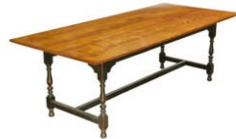
Lot 825 - The D.R. Dimes Co. "Salisbury Tavern Table"; Finest Quality Reproduction 18th c. Style Country Dining Table, flame maple top, 30" x 90" x 40" est. $1000 - $1500