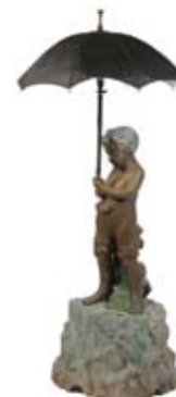
Lot 1240 - Cast Zinc Garden Fountain Figure of a Young Boy holding an umbrella of tin, "Manufactured by A.B. & W.T. Westervelt, NY", 50" tall, 26" diam. est. $1000 - $1500