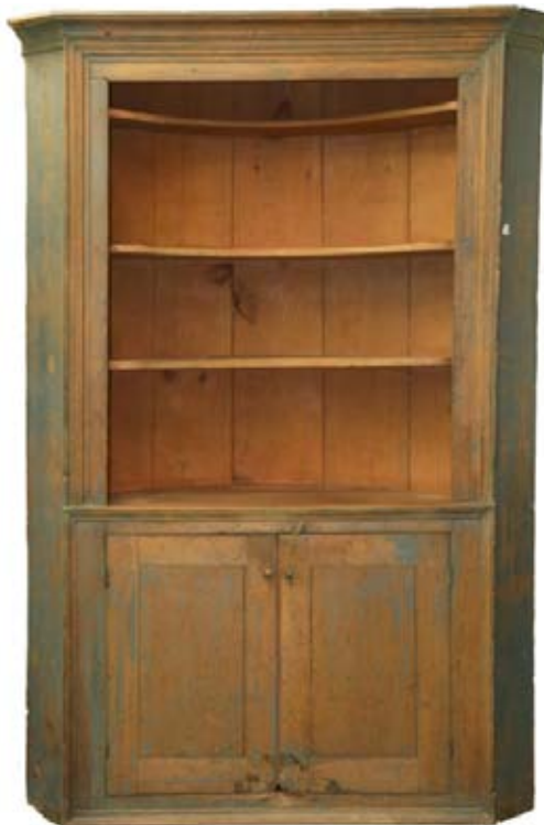
Lot 550 - 18th c. Painted Pine Barrel Back Corner Cupboard in dump cart blue paint, with a pumpkin painted interior, 82" tall, 49" wide, takes a 39" corner. est. $1500 - $2500