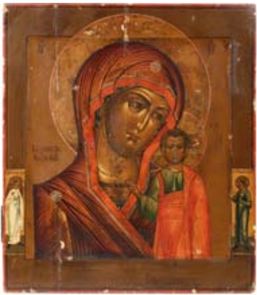
Lot 1014 - 19th c. Russian Icon, Madonna and Child flanked by small portraits of Saints, oil on panel, 14" x 12 1/4". 1 of 30 icons being offered. est. $800 - $1000