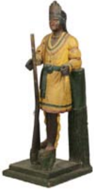
Lot 525 - 19th c Sidewalk Trade Advertising Cigar Store Indian, attr. to Thomas Brooks, in carved and painted wood with cast concrete elements to the base, 57" x 20" x 19" est. $25000 - $35000