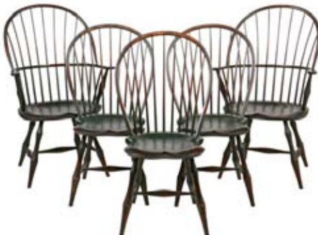
Lot 826 - (10) D.R. Dimes "RI Pennfield Continuous Arm Windsor"; Finest Quality Reproduction 18th c. Style Country Windsor Chair Set, (2) arm & (8) sides. est. $2000 - $2500