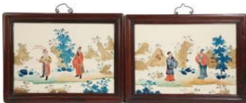
Lot 1084 - 19th c. Chinese Reverse Glass Painted Portraits of Confucian Scholars in Landscapes, in the original Rosewood frames, 9 1/2" x 13 1/2" est. $1000 - $1500