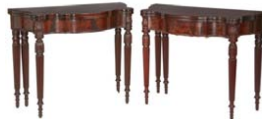
Lot 830 - Pair of Federal Period Boston Style Card Tables by the Paine Furniture Co. of Boston, in dark figured mahogany, 30 1/2" x 37 1/2" x 17 3/4" est. $1000 - $1500