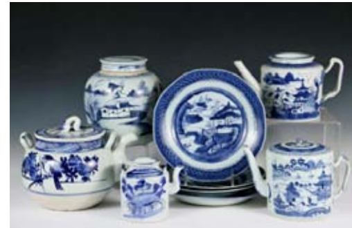
Lot 889 - (9) pcs. 19th c Chinese Export Porcelain. 1 of 58 lots of Chinese Export Porcelain being offered. est. $500 - $700