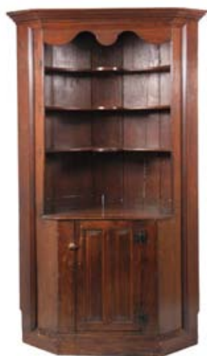
Lot 675 - 18th c. Maine Country Barrel Back Cupboard in walnut stained pine, 82 1/2" tall x 46" wide, takes a 24" corner est. $800 - $1200