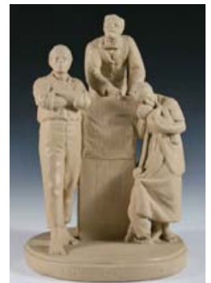
Lot 1311 - JOHN H. ROGERS (NY/CT/MA, 1829-1904) - "The Slave Auction", titled and signed on the base, an original 19th c. casting, overpainted, 13 1/2" x 9" x 8 1/2" est. $1000 - $1500

liveauctioneers THOMASTON live invaluable