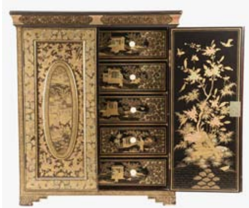
Lot 1097 - Circa 1890 diminutive Chinese Export two-toned gilt black lacquer collector's cabinet, 20 1/2" x 18" x 10" est. $1000 - $1500