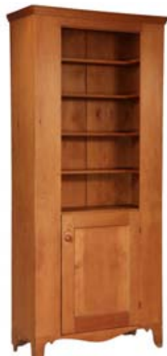
Lot 885 - New England 19th c. Pumpkin Pine Open Cupboard with flat molded top, 84" x 37 1/2" x 16 1/2" est. $700 - $900