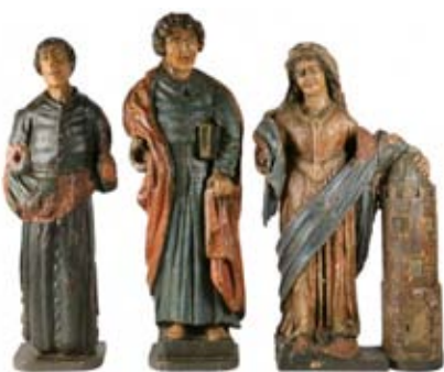
3 of the 9 early Ecclesiastical Statues being offered