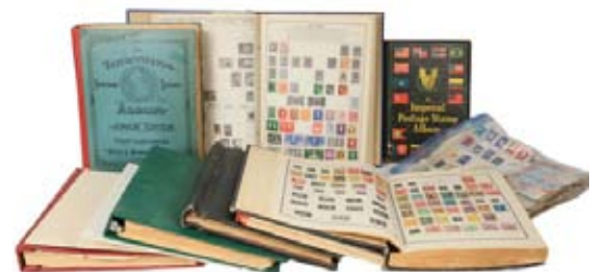
Lot 1601 - (8) Stamp Albums and a bag of loose stamps, including: 1933 Scott International Junior, and 1931 Scott International. est. $300 - $400