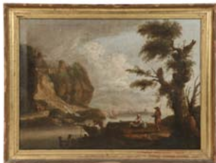
Lot 727 - Italian School, late 17th to early 18th c. Old Master painting, Capriccio Genre Scene, 16" x 22" est. $1500 - $2000