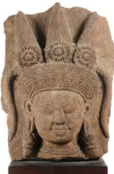
Lot 793 - Wall Fragment Relief Portrait in sandstone of the Buddha of Healing (Bhaisajyaguru) Ankor Wat, Cambodia, 12th-13th Century CE, 13" x 8 1/2" stone, 8" x 8" x 5" plinth. est. $2000 - $3000