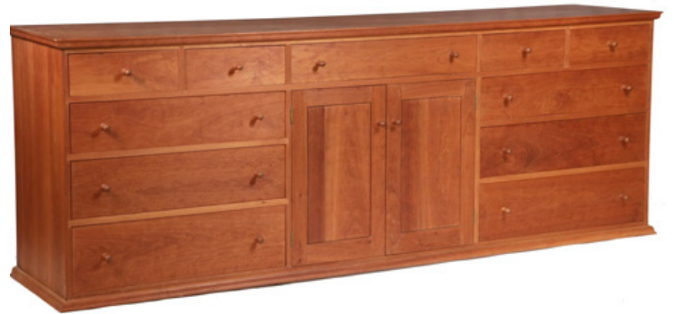
Lot 1250 - Custom Made Solid Cherry Cabinet by Maine Craftsman Thomas Moser. 32" x 88 3/4" x 19 3/4" - 1 of 5 lots of Thomas Moser furniture being offered. est. $4000 - $5000