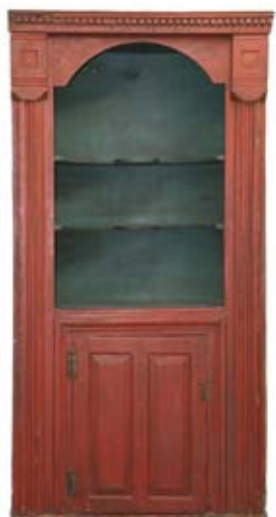
Lot 880 - 18th c. Softwood Architectural Open Front Cabinet in fabulous red paint, with green interior, 85" x 43", takes a 26" corner est. $1000 - $1500