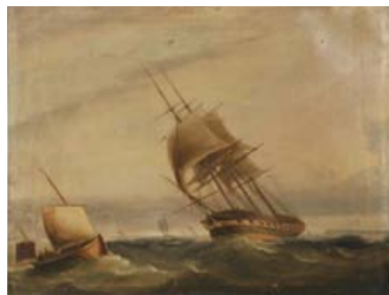
Lot 599 - IN THE MANNER OF THOMAS BUTTERSWORTH, SR. (UK, 1769-1842) - Man-o-War Sail-ing Towards a Fishing Boat in a Storm, oil on canvas laid to board, unsigned, 18 1/2" x 23 1/2" est. $1000 - $2000