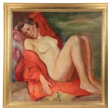
Lot 1558 - MARGARET MCKEE WALKER (20th c.) Nude Woman Reclining on a Red Coverlet, oil on canvas, signed lower left, 27 3/4" square. est. $1000 - $1500