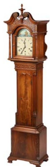
Lot 1257 - Mahogany Rocking Ship Dwarf Clock, circa 1930's, Chippendale style mahogany case. Brass 8-day spring driven movement, chiming on 8 tuned rods. 57 1/2" x 13" x 9" est. $1500 - $2000

liveauctioneers THOMASTON Live invaluable