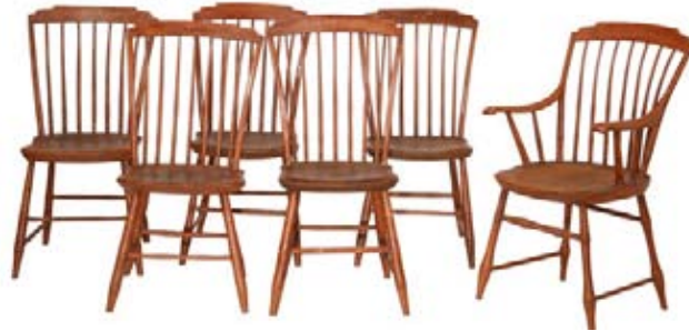
Lot 535 - Matching Set of One Arm and Five Side Chairs in a wonderful vintage red washed finish. Coastal New England, early 19th c. est. $1000 - $1600