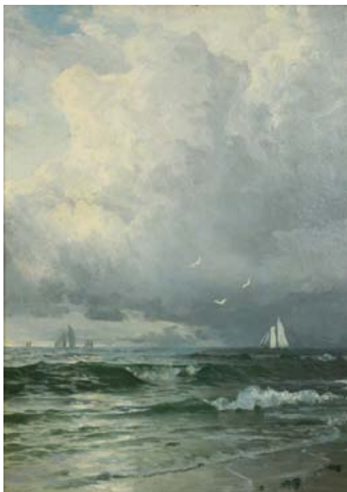
Lot 575 - WILLIAM TROST RICHARDS (PA/RI, 1833-1905) Stormy Sky with Coastal Schooners, oil on academy board, signed, 20 1/2" x 14 1/2" est. $20000 - $30000