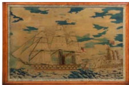
Lot 573 - Large Woolsey View of a Royal Navy Man-o-War passing a Castle Fortress, 24" x 38" est. $1500 - $2000