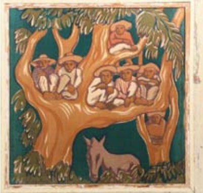
Lot 1582 - AFTER DIEGO RIVERA (NY/MI/Mexico, 1886-1957) - Printed Textile of Men Up in Trees, Burro below, signed, circa 1950, 27 1/2" x 27 1/2" est. $800 - $1000