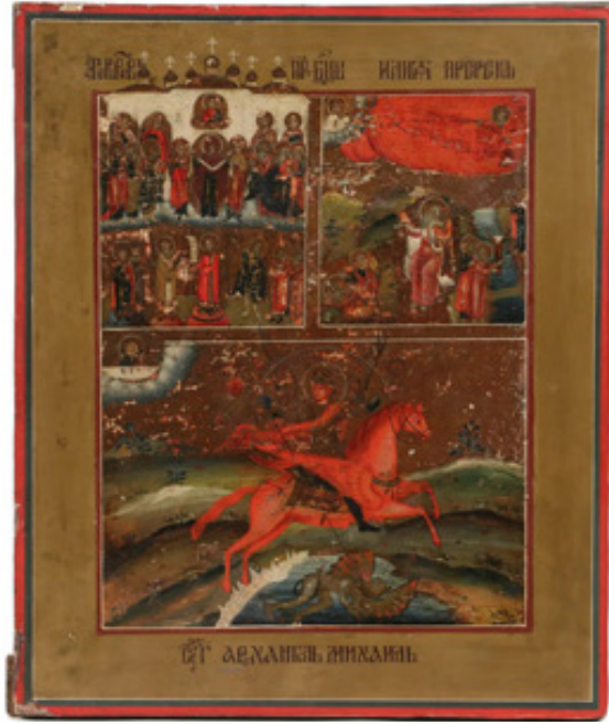
Lot 1000 - Circa 1800 Three Panel Russian Icon, depicting Apostles and Holy Family, 13" x 11" est. $2000 - $3000