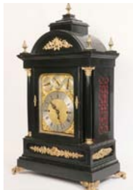
Lot 1258 - Black Lacquer Second Empire Style Bracket Clock with ormolu mounts, attributed to J.J. Elliott of London, brass 8-day fusee spring driven movement, 30" x 20" x 11 1/2" est. $1500 - $2500