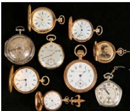
Some of the 19 pocket watches being offered incl. Patek Philippe, Waltham, Locke, Rockford and Agassiz.

Thomaston Place Auction Galleries, Inc. U.S. Route 1, P.O. Box 300, Thomaston, Maine 04861 Phone (207) 354-8141 Fax (207) 354-9523 www.thomastonauction.com