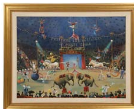
Lot 1536 - SALLY CALDWELL FISHER (ME, 1951 - ) "Monte Carlo Cirque", acrylic on artist's board, signed, 29 1/2" x 39 1/2" est. $3000 - $4000