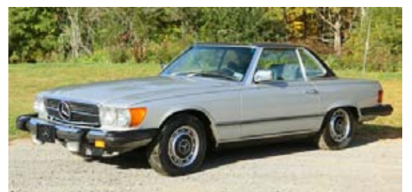
Lot 1260 - 1976 Mercedes-Benz 450SL Convertible Automobile, VIN#10704412033682, silver exterior, black interior. est. $4000 - $6000