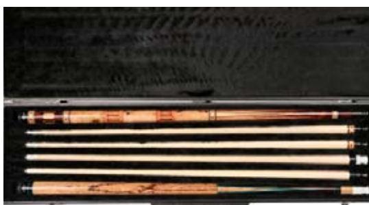
Lot 400 - (2) Pool Cues by David Jacoby, signed and dated 10-09 & 5-11, in custom fitted two-cue hard-case of black vinyl est. $1000 - $1500