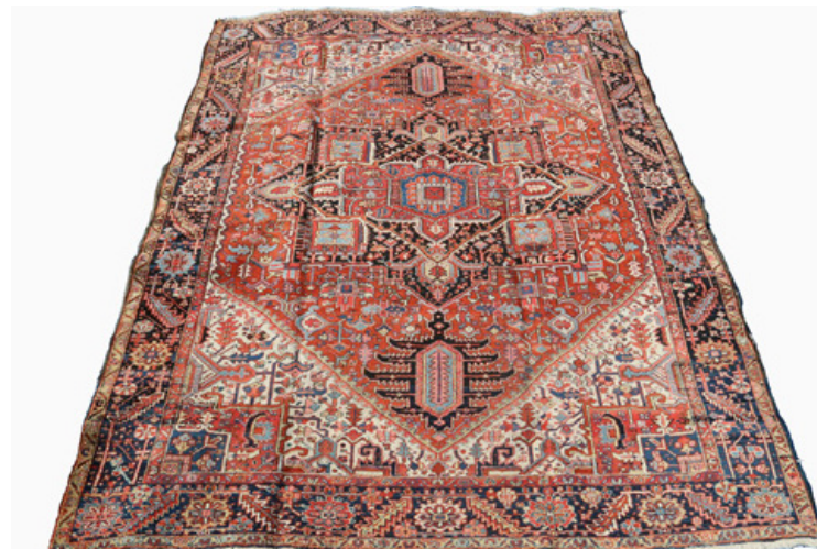
Lot 617 - Early 20th c. 9'4" x 12' Northwest Persia Heriz Carpet, early 20th c., est. $2000 - $3000