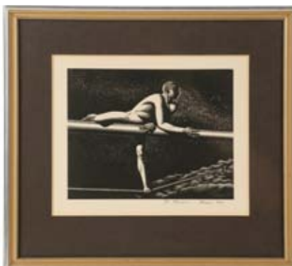
Lot 1511 - ROCKWELL KENT (NY, 1882-1971) - "Bowsprit", wood engraving on paper, pencil signed, inscribed "To Egremont", 1930, edition of 120, 5 3/8" x 6 7/8" impression. est. $1000 - $1500