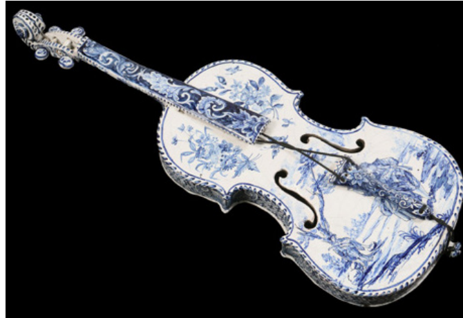
Lot 703 - Late 18th - early 19th c. Delft Full-Sized Violin, with blue and white floral decoration, 22" long. est. $2000 - $3000