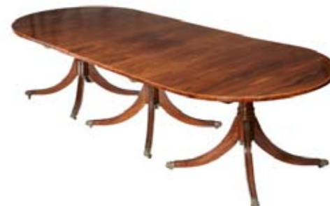
Lot 640 - Custom Duncan Phyfe Style Dining Table, very high quality, with rosewood figured top, 28 1/2" tall x 113" x 46", plus two 20 1/2" leaves. est. $2000 - $3000