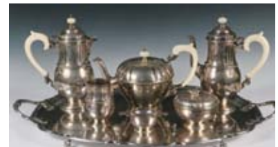
Sample of the 28 Russian Icons being offered