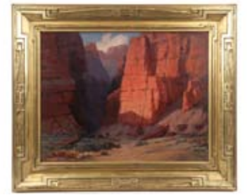
Lot 821 - Early Victorian English Fitted Brass Bound Gent's Toiletary Box, by T. Briggs, 27 Piccadilly, London, 3 3/4" high x 12 3/4" x 7 1/4" est. $1000 - $1500

liveauctioneers THOMASTON live invaluable