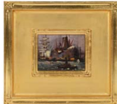
Lot 636 - ROBERT HENRI (NY/PA, 1865-1929) Harbor Scene, oil on canvas, laid to board by the artist, signed, 4" x 5 1/4" est. $6000 - $8000