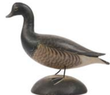
Lot 500 - Canada Goose Decoy, in painted wood, stamped on underside "A.E. Crowell, Maker, East Harwich, Mass.". 4 1/4" x 5" x 2 1/2" est. $400 - $600