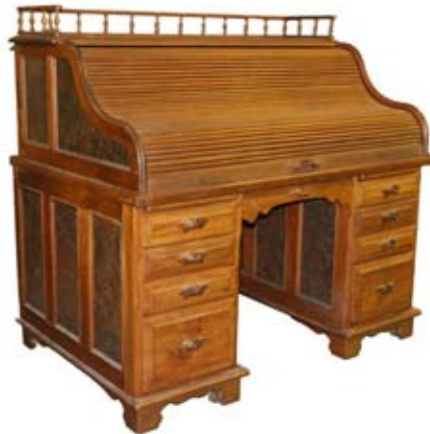
Lot 1335 - American Red Walnut Serpentine Roll-top Desk, with upper spindle gallery on molded top, fully fitted interior, 57" x 60" x 39" overall. est. $1000 - $1500