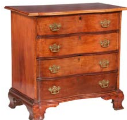
Lot 860 - 18th c. Mahogany Block End Serpentine Front Four-Drawer Blanket Chest, with molded hinged top, 36" x 38" x 21" est. $1000 - $1500