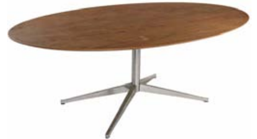
Lot 1400 - Circa 1970 Modernist Oval Conference or Dining Table, Florence Knoll Bassett (1917- ) for Knoll International, with Walnut Top, Chromed Steel Star Base, 28" x 78" x 48" est. $1000 - $1500