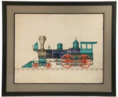
Lot 1724 - Rare color elevation of an early wood stoked, narrow gauge, 1875 Baldwin 4-4-0 "American" Model Steam Locomotive, ink and gouache, on paper 2 3/4" x 29" est. $800 - $1200