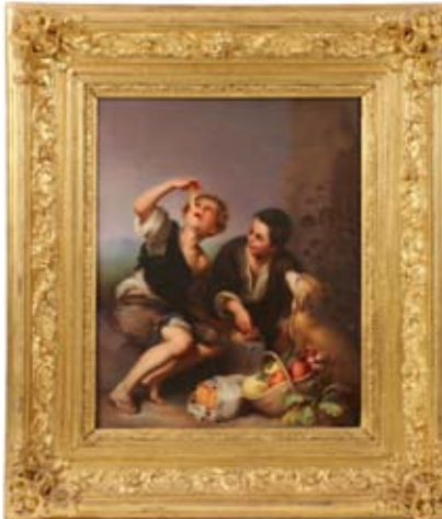
Lot 1228 - Circa 1870 Berlin KPM Porcelain Plaque, pencil signed "Henry Wimmer" (Munich), 12 3/4" x 10 1/2". est. $5000 - $8000