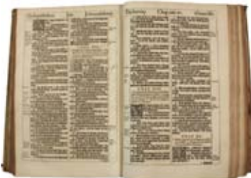
Lot 1047 - 1640 Barker Printing of the King James Version (KJV), known as the last and best of the "Black Letter" editions, printed in London. est. $15000 - $25000