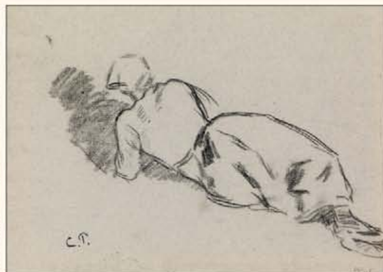
Camille Pissarro, Femme au fichu, allongée , black chalk. Estimate $10,000 to $15,000.