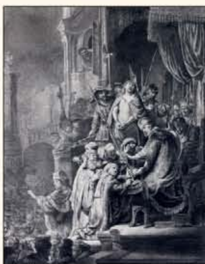
Rembrandt van Rijn, Christ Before Pilate: Large Plate , etching, engraving and drypoint, 1635-36. Estimate $60,000 to $90,000.