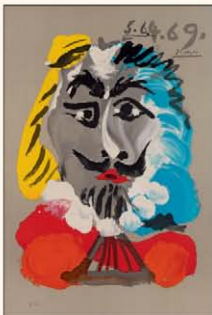
Pablo Picasso (after), Vingt-Neuf Portraits Imaginaires , complete portfolio with 29 color lithographs and text, 1969. Estimate $80,000 to $120,000.