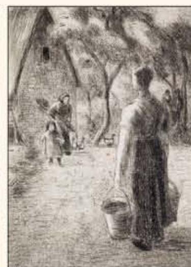
Camille Pissarro, Paysanne portant des seaux , drypoint and aquatint, 1889. Estimate $10,000 to $15,000.