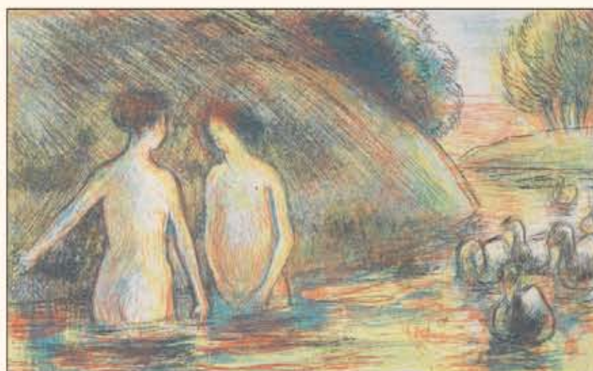
Camille Pissarro, Les Baigneuses gardeuses d'œufs , color drypoint, circa 1895. Estimate $15,000 to $20,000.