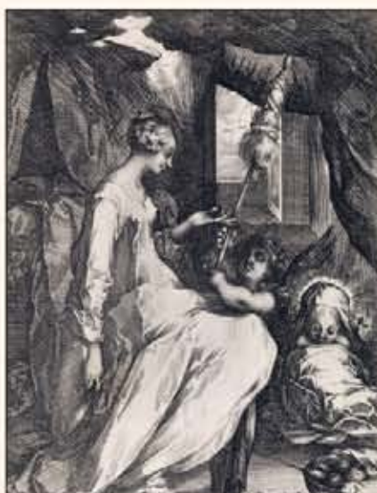
Jacques Bellange, The Virgin and Child with Distaff and an Angel , etching and engraving, circa 1615. Estimate $40,000 to $60,000.