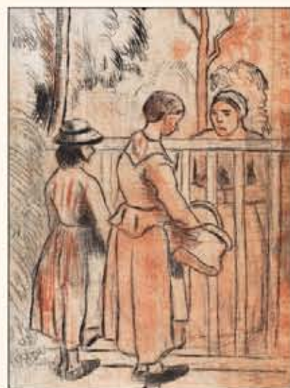
Camille Pissarro, Mendiantes , color etching and drypoint, circa 1894. Estimate $15,000 to $20,000.