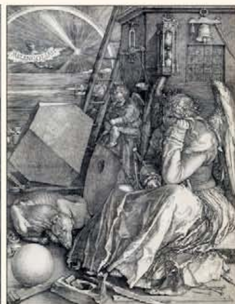
Albrecht Dürer, Melencolia I , engraving, 1514. Estimate $70,000 to $100,000.